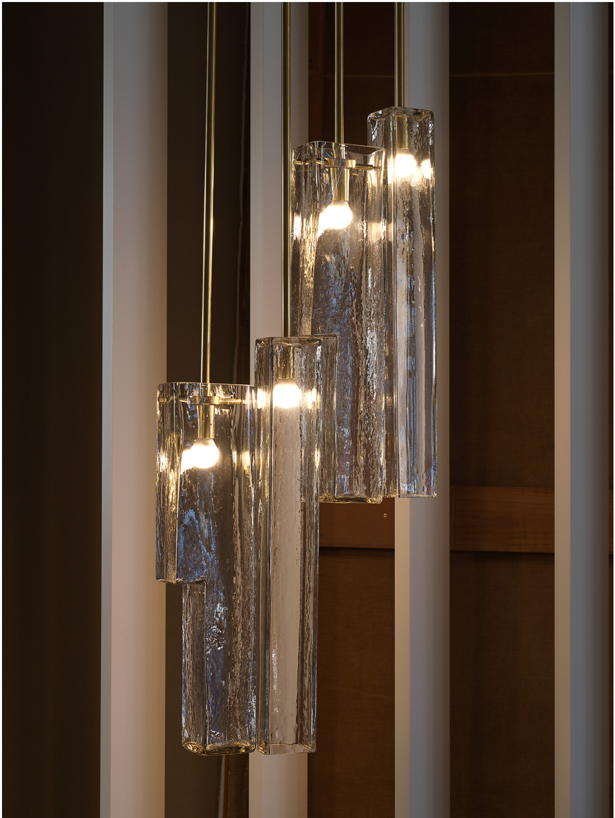
4. Leonor Antunes, Egle #2 , 2019, Murano glass, brass, electric wire, bulb Dimensions variable 128 x 17 1/2 x 4 1/8 in. (325 x 44.5 x 10.5 cm) Photo: Nick Ash Courtesy the artist and Marian Goodman Gallery