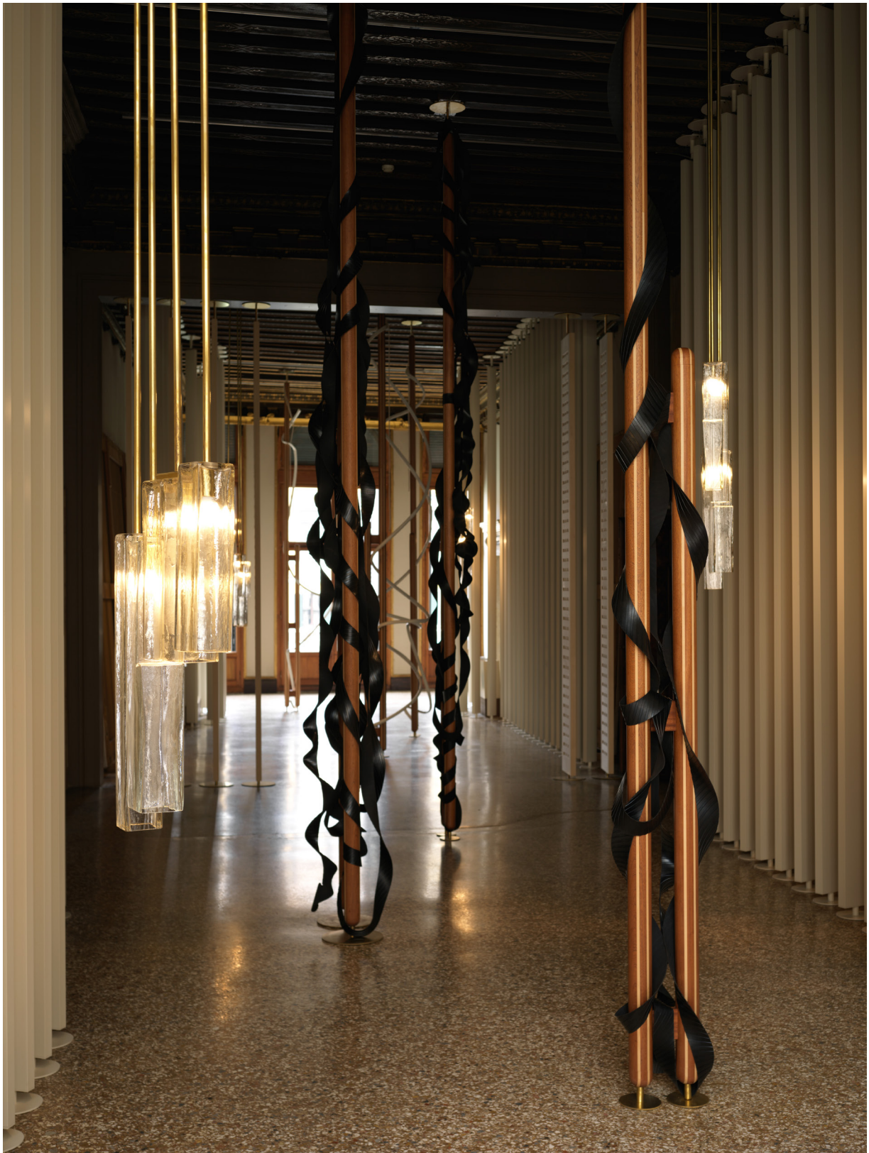
3. Leonor Antunes, A seam, a surface, a hing or a knot. Portugese Pavilion 2019 Venice Biennale, May 11 - November 2019.