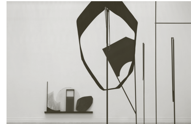
Installation view, 2019. RHA Gallery, Dublin

The poise and aesthetic restraint of Niamh O'Malley's work holds you, but at arm's length. There is a dissembling single-mindedness to it that obscures a poetic multiplicity. It is quietly assured, as if knowing its own mind, but something about it leaves exposed a chink of irresolution. Congregations of shaped glass panes, metal, wood, stone, and the odd LED screen at once impede, support, and intimate. I wonder where to begin. I reach out, feeling for traction, circling, casting around for points of entry, anchorage, something to hold onto. To help find my bearings, I look to language to translate O'Malley's structures and forms, but before long my sentences become contorted, stumbling over a succession of inelegant qualifying clauses and modifiers. I gather myself, beginning again.