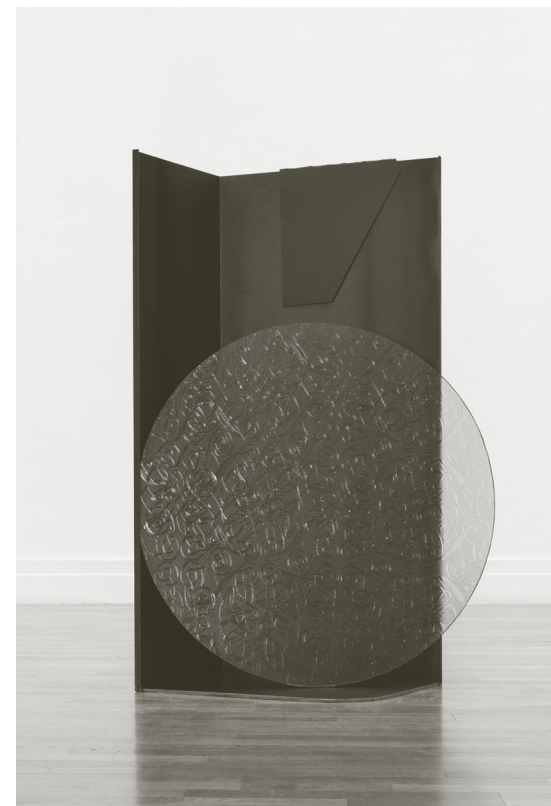
Corner (hold) 2019 Steel, textured coloured glass, graphite and varnish on card 1510 x 1040 x 600 mm

Most recently, street furniture has found its way into her work, though the spaces she alludes to remain abstracted. A set of drains runs alongside a window, a row of manhole covers line up, a video of a ventilation unit plays on a loop. These unremarkable objects become suddenly remarkable, almost monumental. Drain is made of a beautiful fossil-specked deep grey-black limestone. One side is raised, creating an exaggerated curve that runs down towards the window. In Covers staggered rows of gently domed and dimpled circles, large and small, are again made of limestone and set into mahogany-brown wood panels. They are moon-like save for subtle cutout handholds that suggest they might be opened to reveal holes, or something else. Vent plays on a freestanding LED screen - one and a half meters square - cut off from the wall. It pictures, close-up, the horizontal slats of a ventilation fan