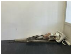
Tolia Astakhishvili The Endless House Mixed Media 270 x 70 x 47 cm (106 1/4 x 27 1/2 x 18 1/2 inches)