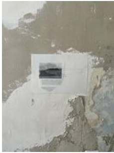
Tolia Astakhishvili Sleeping Traveler Pencil and collage on paper 21 x 29.7 cm (8 1/4 x 11 3/4 inches)