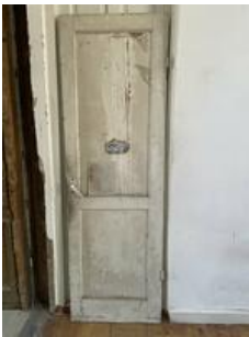
Tolia Astakhishvili Host Mixed media, Door, Drawing 202 x 65 x 4.5 cm (79 1/2 x 25 5/8 x 1 3/4 inches)