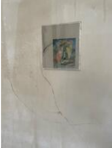
Tolia Astakhishvili For Those Who Are Not There oil on gyps section of the wall 23 x 20.5 x 2.5 cm (9 x 8 1/8 x 1 inches)