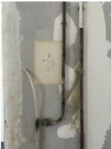
Tolia Astakhishvili Penetration / Doorway Mixed media, ink on paper Dimensions variable