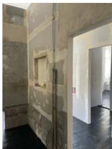
Tolia Astakhishvili Unsealed Mixed Media 570 x 500 x 300 cm (224 3/8 x 196 7/8 x 118 1/8 inches)

Tsinamdzghvrishili st. 49, Tbilisi, Georgia