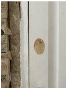
Tolia Astakhishvili The Main Entrance Mixed Media, Sticker Dimensions variable