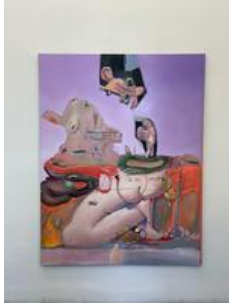
Stefanie Heinze TBC, 2022 Acrylic and oil on canvas 175 x 135 cm (68 7/8 x 53 1/8 inches)