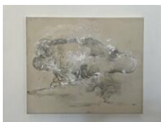
Tolia Astakhishvili Traveler's Smoking Dreams Indian ink, acrylic and oil on canvas 33 x 40 x 2 cm (13 x 15 3/4 x 3/4 inches)