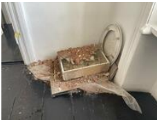
Tolia Astakhishvili On Both Sides II Mixed Media Dimensions variable