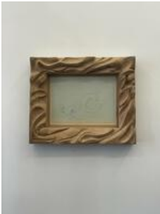
Tolia Astakhishvili Possession / I talk the enwalled totem aww Carved wood, drawing on paper 37 × 46 × 8 cm (14 5/8 × 18 1/8 × 3 1/8 inches)