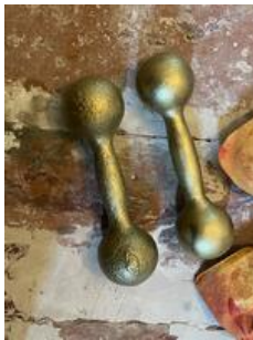
Nancy Lupo Untitled, 2022 Cast iron with golden pigment 24 x 7 x 6 cm (9 1/2 x 2 3/4 x 2 3/8 inches) Edition of 2