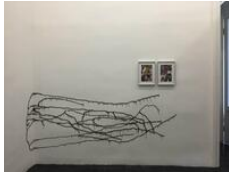
Keto Logua Start from the the beginning, 2022 Wall painting 90 x 258 cm (35 3/8 x 101 5/8 inches)

Tsinamdzghvrishili st. 49, Tbilisi, Georgia