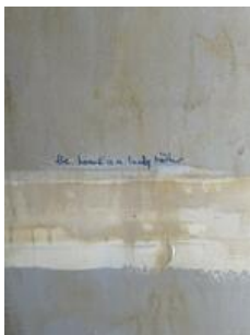
Tolia Astakhishvili Torn From Something Mixed Media Dimensions variable