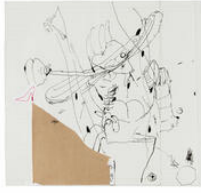
Stefanie Heinze O.T. (Bean Board) , 2021 Ink on paper, collaged 25.2 × 27 cm (9 7/8 × 10 5/8 inches)

Tsinamdzghvrishili st. 49, Tbilisi, Georgia