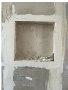
Tolia Astakhishvili Winds And Holes, Niche 3 Mixed Media Dimensions variable