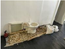
Tolia Astakhishvili On Both Sides I Mixed Media Dimensions variable