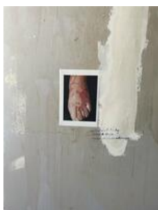
Tolia Astakhishvili Unsealed Words Mixed Media Dimensions variable