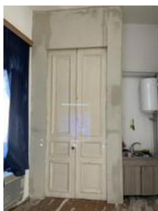
Tolia Astakhishvili Untitled Doors Dimensions variable