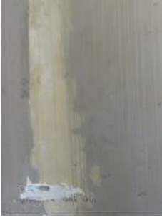
Tolia Astakhishvili Numb Skin Mixed Media Dimensions variable