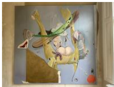
Stefanie Heinze Celestial Topping ( packs, peas & wheels) , 2022 Acrylic and oil on canvas 265 × 280 cm (104 3/8 × 110 1/4 inches)