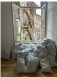
Tolia Astakhishvili Just Deserts Mixed Media Dimensions variable