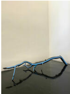
Keto Logua Artist does what she wants Part II , 2022 Wood branch, Mixed media 100 × 30 × 20 cm (39 3/8 × 11 3/4 × 7 7/8 inches)