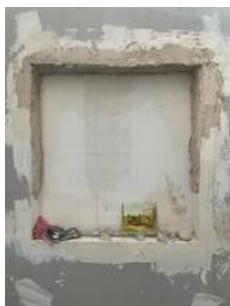
Tolia Astakhishvili Unsheltered, Niche II Mixed Media Dimensions variable