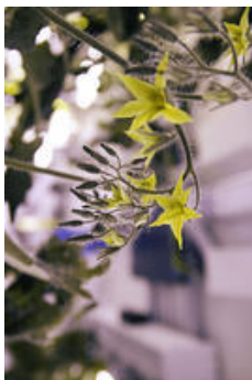
Keto Logua New Interface , 2022 Giclee print on Hahnemühle paper 37 × 27 cm (14 5/8 × 10 5/8 inches) (framed) Edition of 2 plus 1 AP