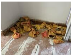
Nancy Lupo TBC, 2022 bows with door handle in gold powder 33 x 20 x 6 cm (13 x 7 7/8 x 2 3/8 inches)