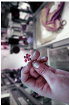
Keto Logua Experiment , 2022 Giclee print on Hahnemühle paper 37 × 27 cm (14 5/8 × 10 5/8 inches) (framed) Edition of 2 plus 1 AP