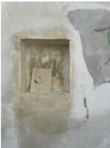
Tolia Astakhishvili Invisible Head / Niche I Mixed Media, drawing on rice paper 55 x 46 x 10 cm (21 5/8 x 18 1/8 x 3 7/8 inches) Dimensions variable