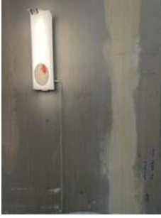
Tolia Astakhishvili Notes On Hours Lightbox, ink on paper, sensor 36 × 8.5 × 9 cm (14 1/8 × 3 3/8 × 3 1/2 inches) Dimensions variable

Tsinamdzghvrishili st. 49, Tbilisi, Georgia