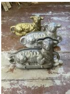
Nancy Lupo Untitled, 2022 Cast iron, gold pigment 30 x 13 x 19 cm (11 3/4 x 5 1/8 x 7 1/2 inches) Edition of 3