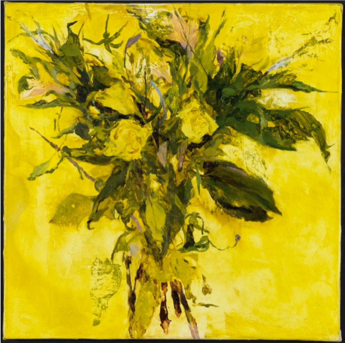
Lime Roses, 2015 Oil on canvas on board 50.5 x 50 cm, 19.9 x 19.7 inches, JP15-5

CORVI-MORA 1A KEMPSFORD ROAD LONDON SE11 4NU TELEPHONE 020 78409111 FACSIMILE 0207840 9112