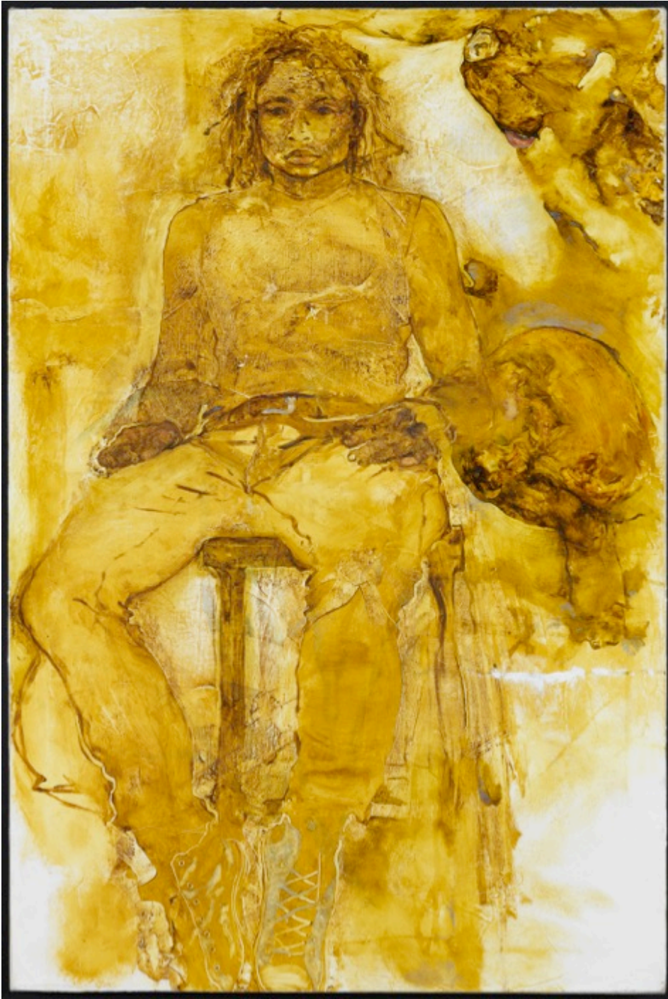
Untitled, 2014 Oil on canvas on board 91 x 61 cm, 35.8 x 24 inches, JP14-1

CORVI-MORA 1A KEMPSFORD ROAD LONDON SE11 4NU TELEPHONE 020 78409111 FACSIMILE 0207840 9112