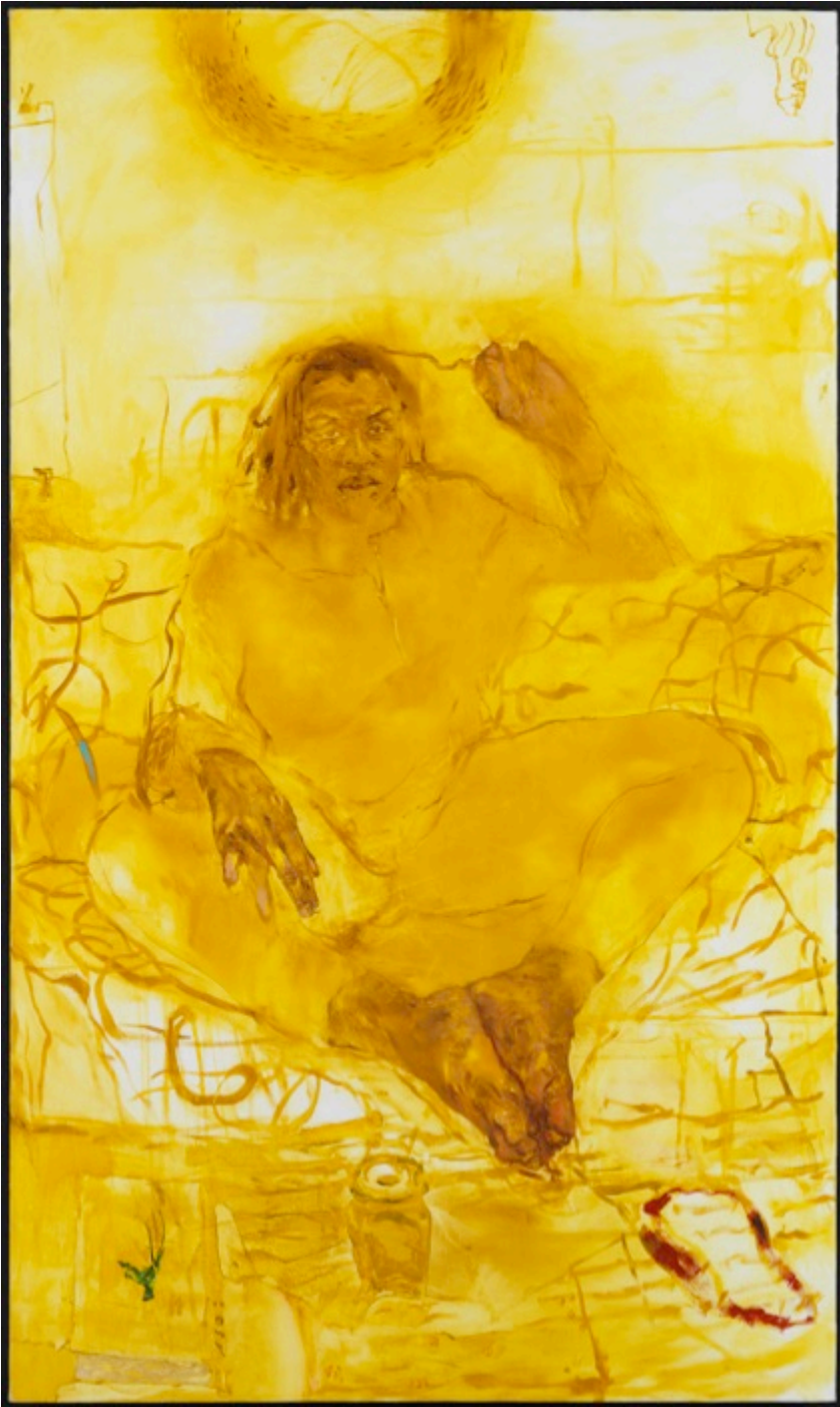
Alexandria, 2015 Oil on canvas 154.5 x 92 cm, 60.8 x 36.2 inches, JP15-1

CORVI-MORA 1A KEMPSFORD ROAD LONDON SE11 4NU TELEPHONE 020 78409111 FACSIMILE 0207840 9112