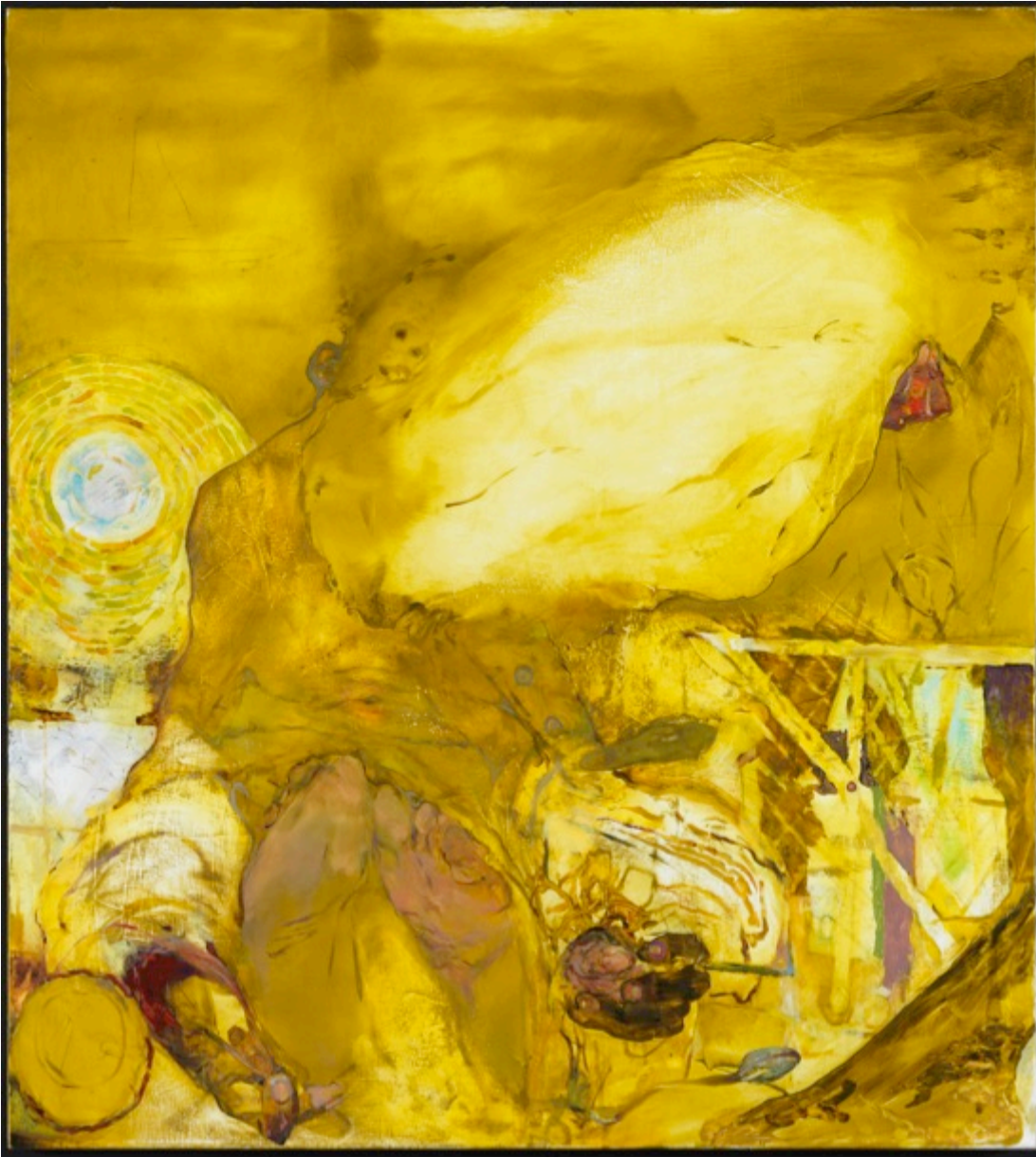
Nonplussed , 2015 Oil on canvas 101.5 x 91.5 cm, 40 x 36 inches, JP15-8

CORVI-MORA 1A KEMPSFORD ROAD LONDON SE11 4NU TELEPHONE 020 78409111 FACSIMILE 0207840 9112