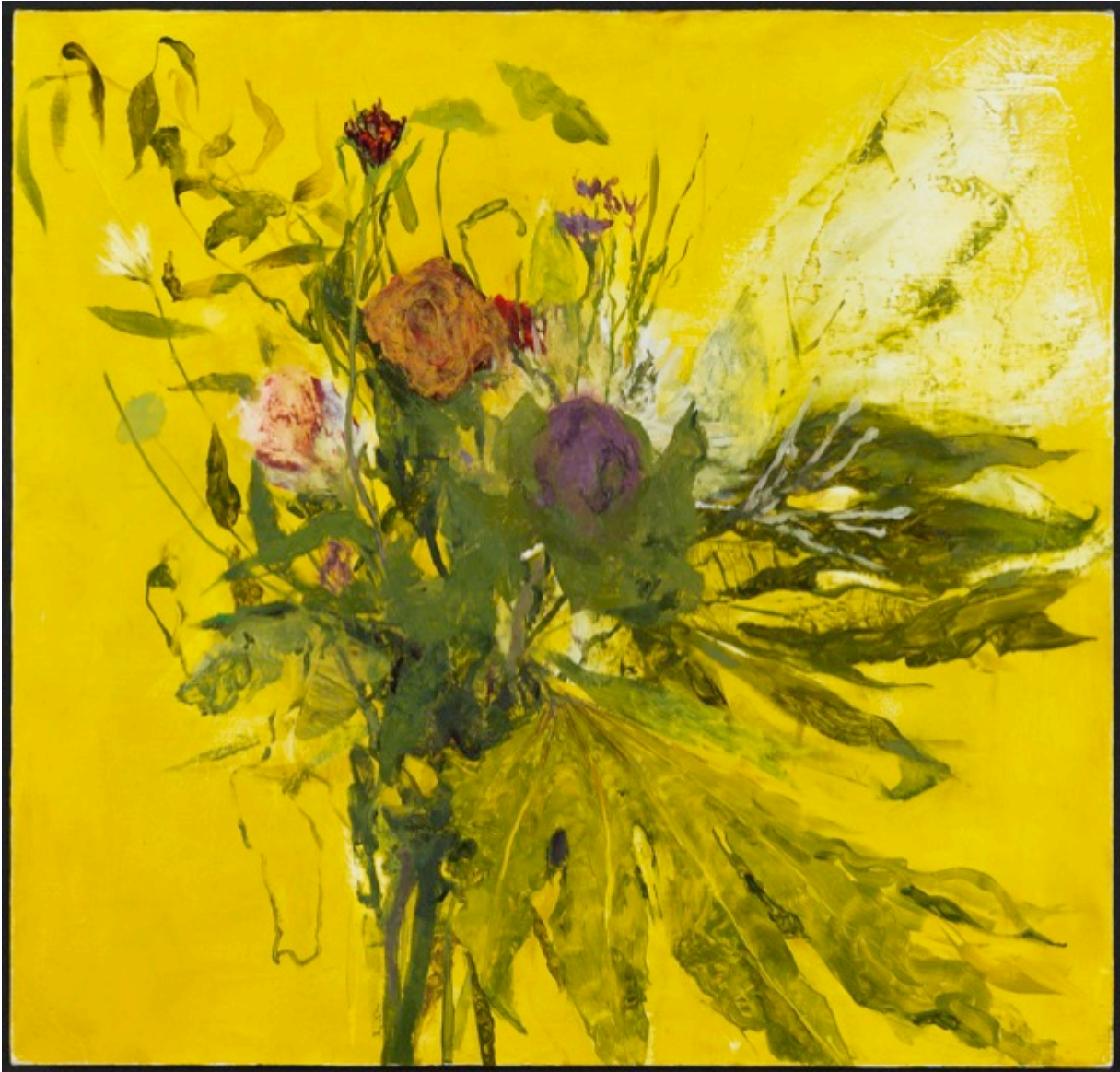
Untitled, 2015 Oil on canvas on board 51 x 53.5 cm, 20.1 x 21.1 inches, JP15-3

CORVI-MORA 1A KEMPSFORD ROAD LONDON SE11 4NU TELEPHONE 020 78409111 FACSIMILE 0207840 9112