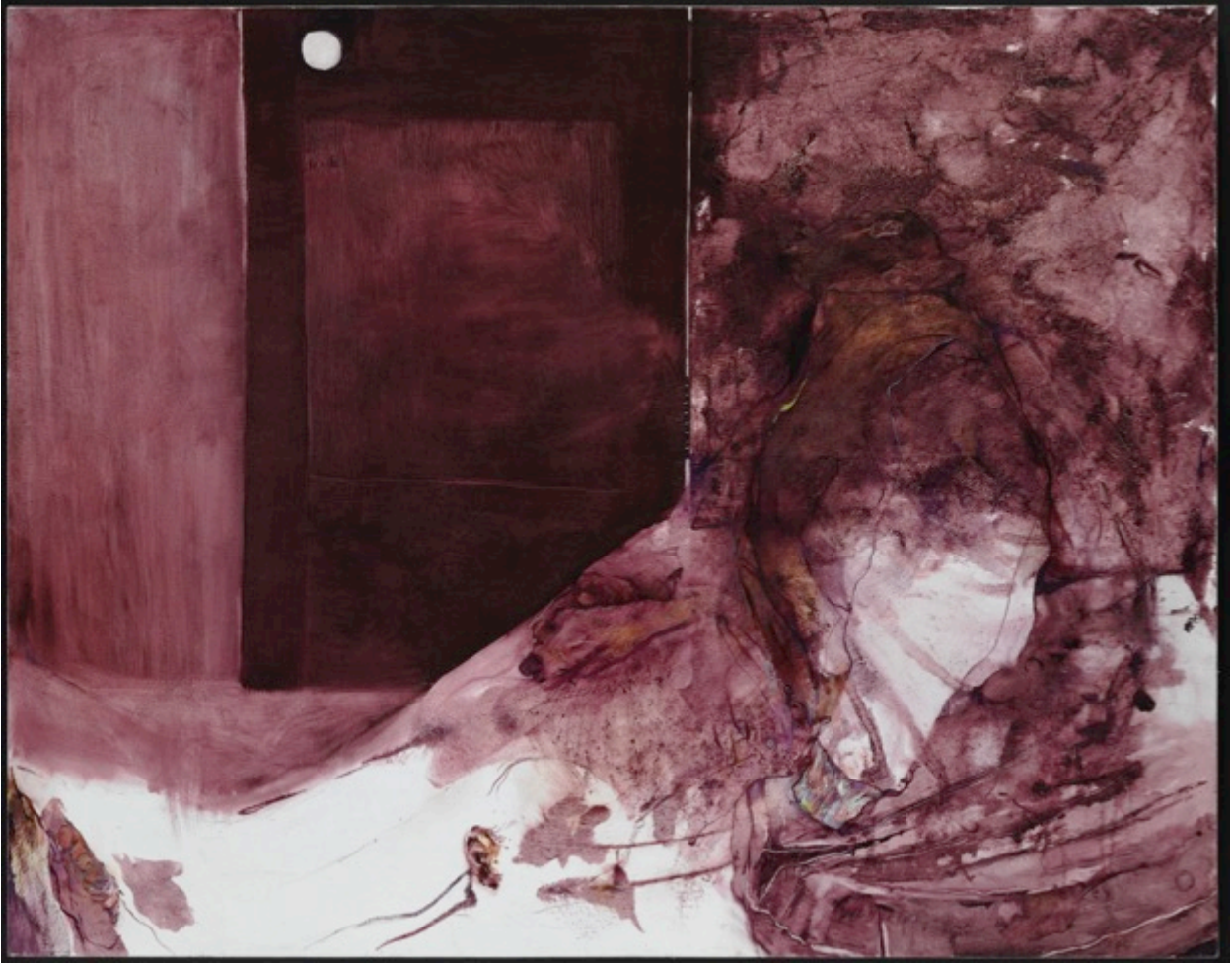
Vision Impaired , 2015 Oil on canvas 107.5 x 137 cm, 42.3 x 53.9 inches, JP15-4

CORVI-MORA 1A KEMPSFORD ROAD LONDON SE11 4NU TELEPHONE 020 78409111 FACSIMILE 0207840 9112