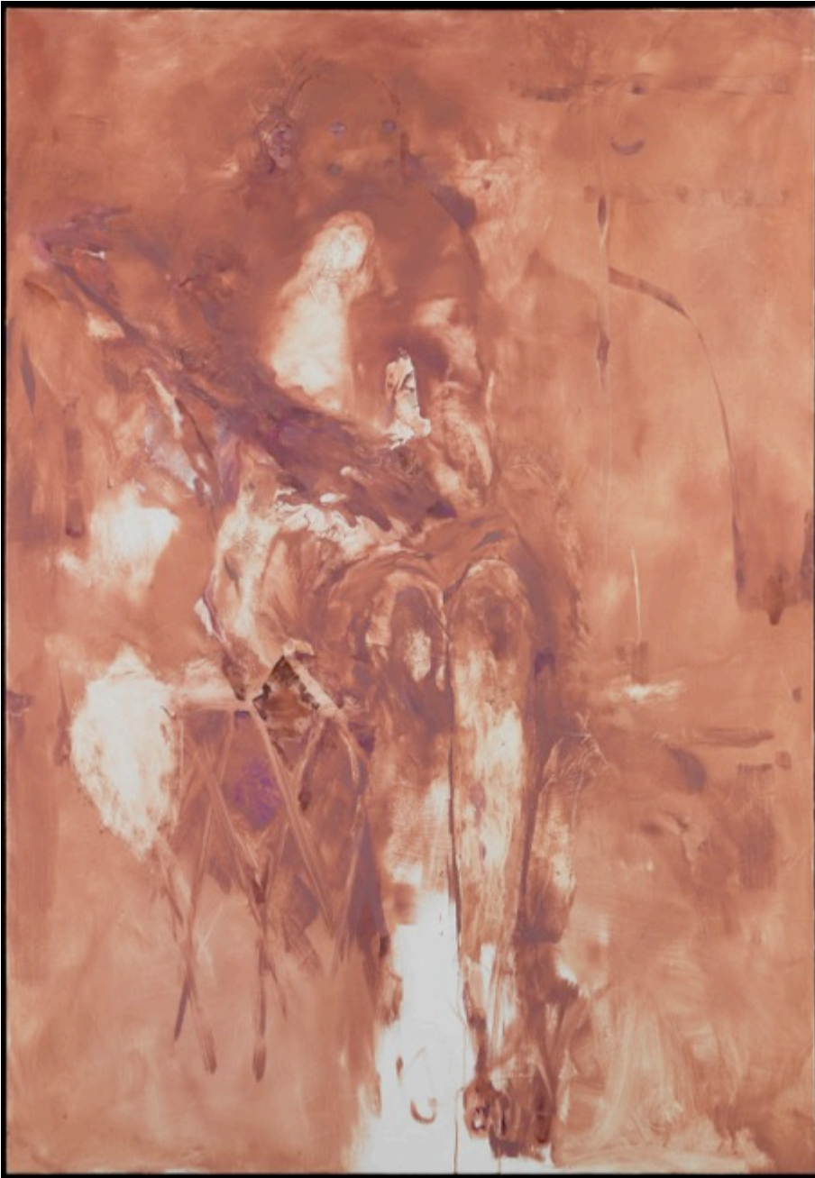
No Mind For Yearning, 2015 Oil on canvas 164.5 x 114.5 cm, 64.8 x 45.1 inches, JP15-9

CORVI-MORA 1A KEMPSFORD ROAD LONDON SE11 4NU TELEPHONE 020 78409111 FACSIMILE 0207840 9112