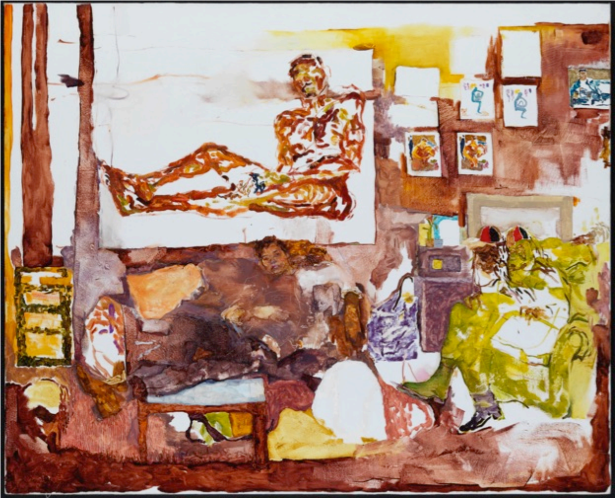
Jordan , 2014 Oil on canvas 98 x 121.5 cm, 38.6 x 47.8 inches, JP14-3

CORVI-MORA 1A KEMPSFORD ROAD LONDON SE11 4NU TELEPHONE 020 78409111 FACSIMILE 0207840 9112