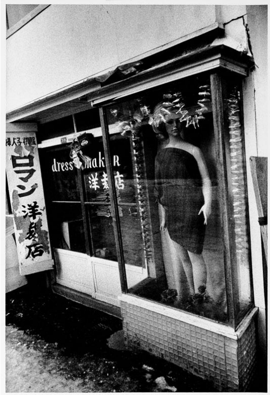
Daido Moriyama "Tsugaru", 2010 B & W print 41.8 x 28.3 cm