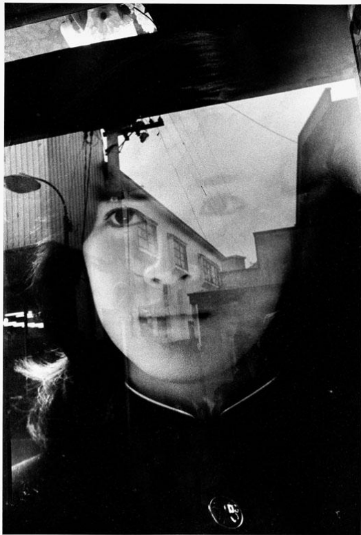
Daido Moriyama "Tsugaru", 2010 B & W print 41.8 x 28.3 cm