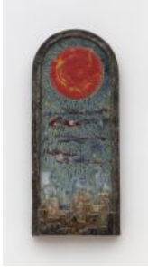
Bruce M. Sherman Urban Portal , 2022 Ceramic and glaze 20 1/4h x 8 1/2w x 1d in bsherman1132