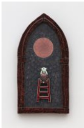
Bruce M. Sherman Persistence , 2022 Ceramic and glaze 19h x 9 1/2w x 1 1/4d in bsherman1139