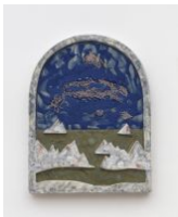
Bruce M. Sherman Full Emptiness , 2022 Ceramic and glaze 15h x 11 1/2w x 1 1/4d in bsherman1130