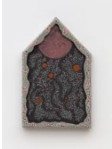
Bruce M. Sherman Celestial Sonata , 2022 Ceramic and glaze 15 1/4h x 9 3/4w x 1 3/4d in bsherman1137