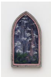
Bruce M. Sherman The Mystery of Perception , 2022 Ceramic and glaze 20 1/2h x 11 1/4w x 1 3/4d in bsherman1134