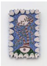
Bruce M. Sherman In Stillness, Spring Awakens , 2021 Ceramic and glaze 15 1/2h x 10w x 3/4d in bsherman1135