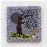
Bruce M. Sherman Tree and Eye Coordination , 2021 Ceramic and glaze 14h x 13 1/2w x 1d in bsherman1133