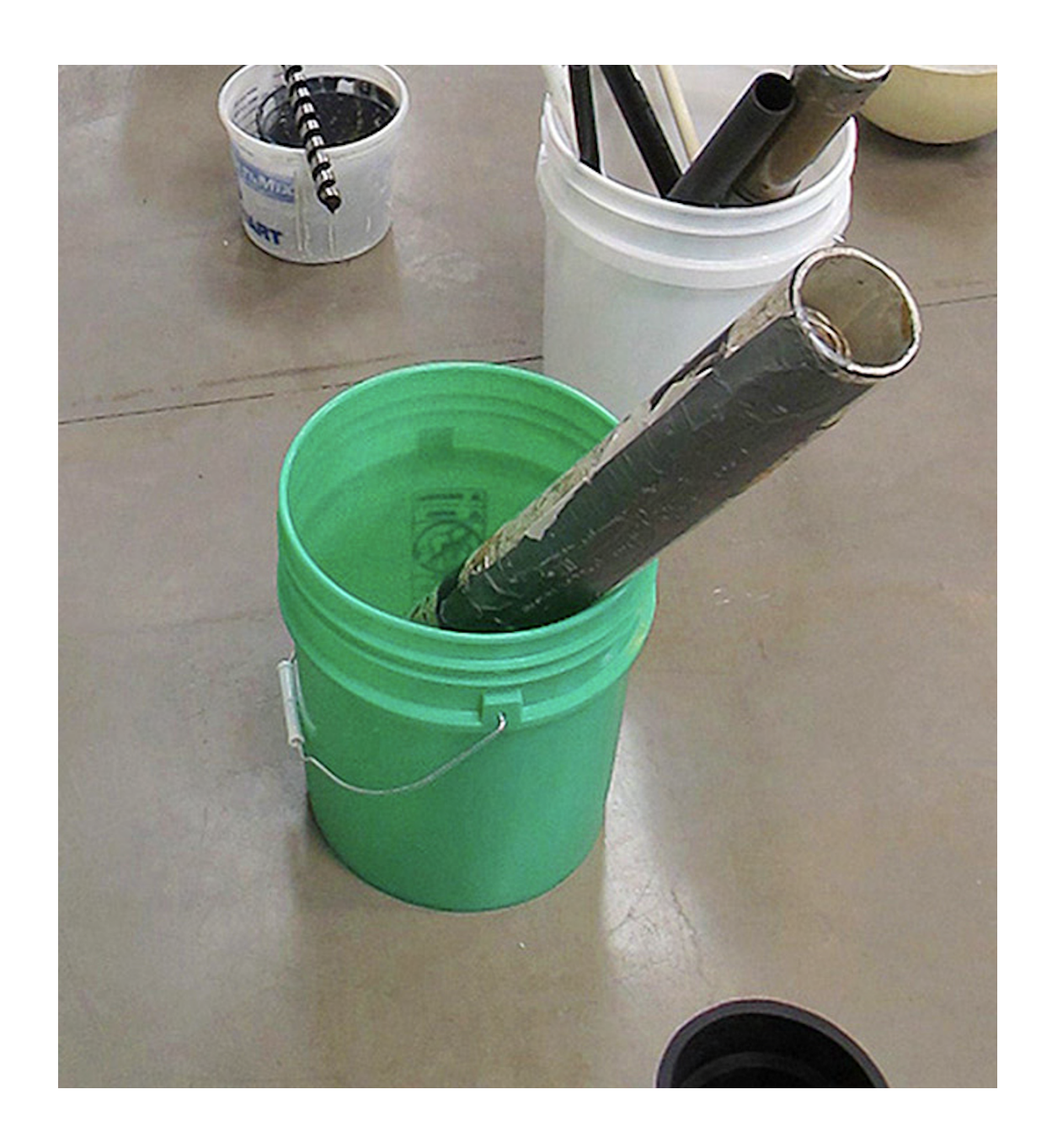
WILBERT QUEENLAND CARRYING CASE - PVC PIPE, DUCT TAPE, LEATHER STRAP, HARDWARE, VICTOR HOUTEFF BIBLICAL CHART DRAWINGS