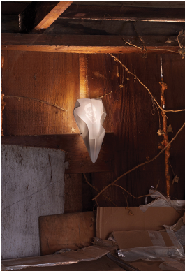
Sconce (Snowden Selfie) , 2013