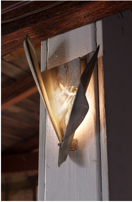
Sconce (356 Glyph, Metal) , 2015 Porous nylon, aluminum, lighting hardware 8 x 5 1/16 inches (20.32 x 12.86 cm) RADSM005