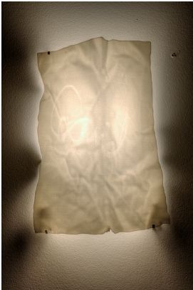
Sconce (Selfie) , 2013 Porous nylon, lighting hardware 8 3/4 x 6 inches (22.23 x 15.24 cm) RADSM006