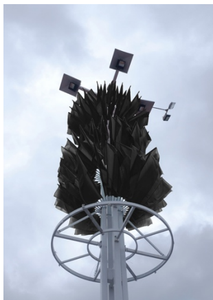
A Pole, 2020 Photography

analyse them later. There are no independent media in Belarus. They ceased to exist when Lukashenko gained power in 1994. By the end of 1994, Siarhiey Antonchyk, an MP in the Supreme Council of the Republic of Belarus, presented a report on corruption in the President's circles. The report was not published but newspapers were issued with blank pages because the ban on printing it had been issued at the last minute. From that moment on, independent media were either liquidated or submitted to the control of the authorities and published only radical propaganda. The installation makes references to the regime's placing ornamental red and green flags along the streets of Minsk. The flag's design was approved of during a rigged referendum, promoted by Lukashenko. This is not the national flag, there is no real idea behind it. It is a symbol of fear. The propaganda press is full of fear, hate and resentment.