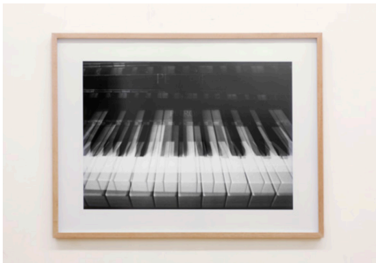
Kaspar Müller Untitled, 2006–2018 Digital print 90 × 69.5 × 3.5 cm