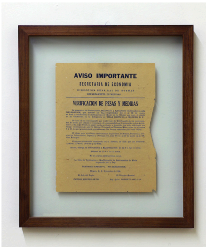
Diego Salvador Ríos Sobre los valores, 2011–2015 pencil on oficial communication from the Ministry of Economy, General Directorate of standards, department of measures. “Weight and Measurement Verification”. Delegation of Villa, Gustavo A. Madero, dated Mexico City, 1956 43 × 37.3 × 2.3 cm