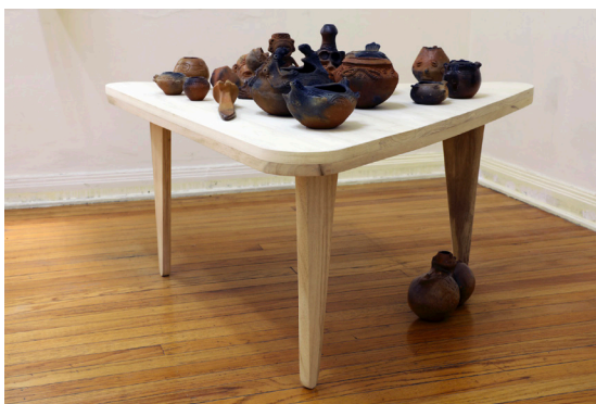
Jorge González Los ojos de cuadrados de Atabei (Part 2), 2018 Taller Cabachuelas Clay pots and wooden table Dimensions variable