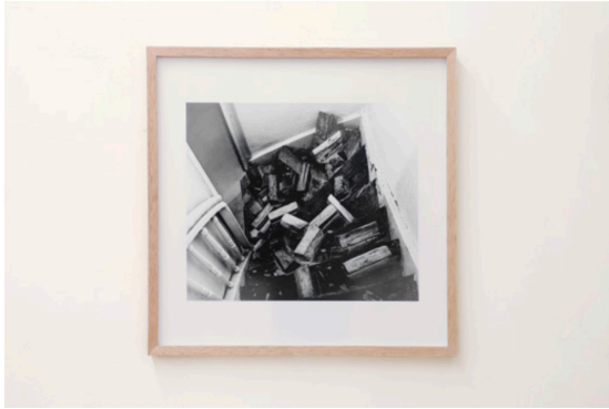
Kaspar Müller Untitled, 2006–2018 Digital print 60 × 67 × 2 cm