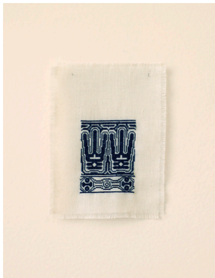
Jorge González Los ojos de cuadrados de Atabei (Part 3), 2017 embroidery 4.25 × 5.75 in (10.8 × 14.6 cm)