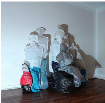
Matthew Langan-Peck Cien Años, 2018 plastic bags, spotlight Unique