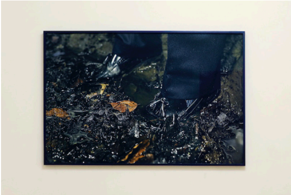
Maria Loboda The Evolution of Kings, 2017 Digital print on Hahnemühle paper 104 × 152 cm ed. 3 + 1 AP