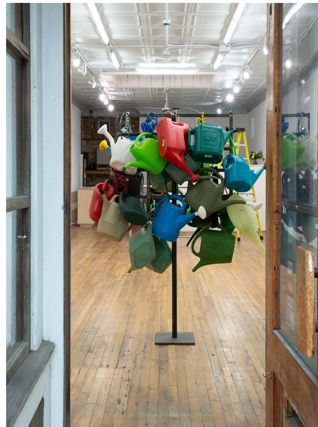
Part 2 'Community Garden (property)' 6'x3' watering cans, locks, steel