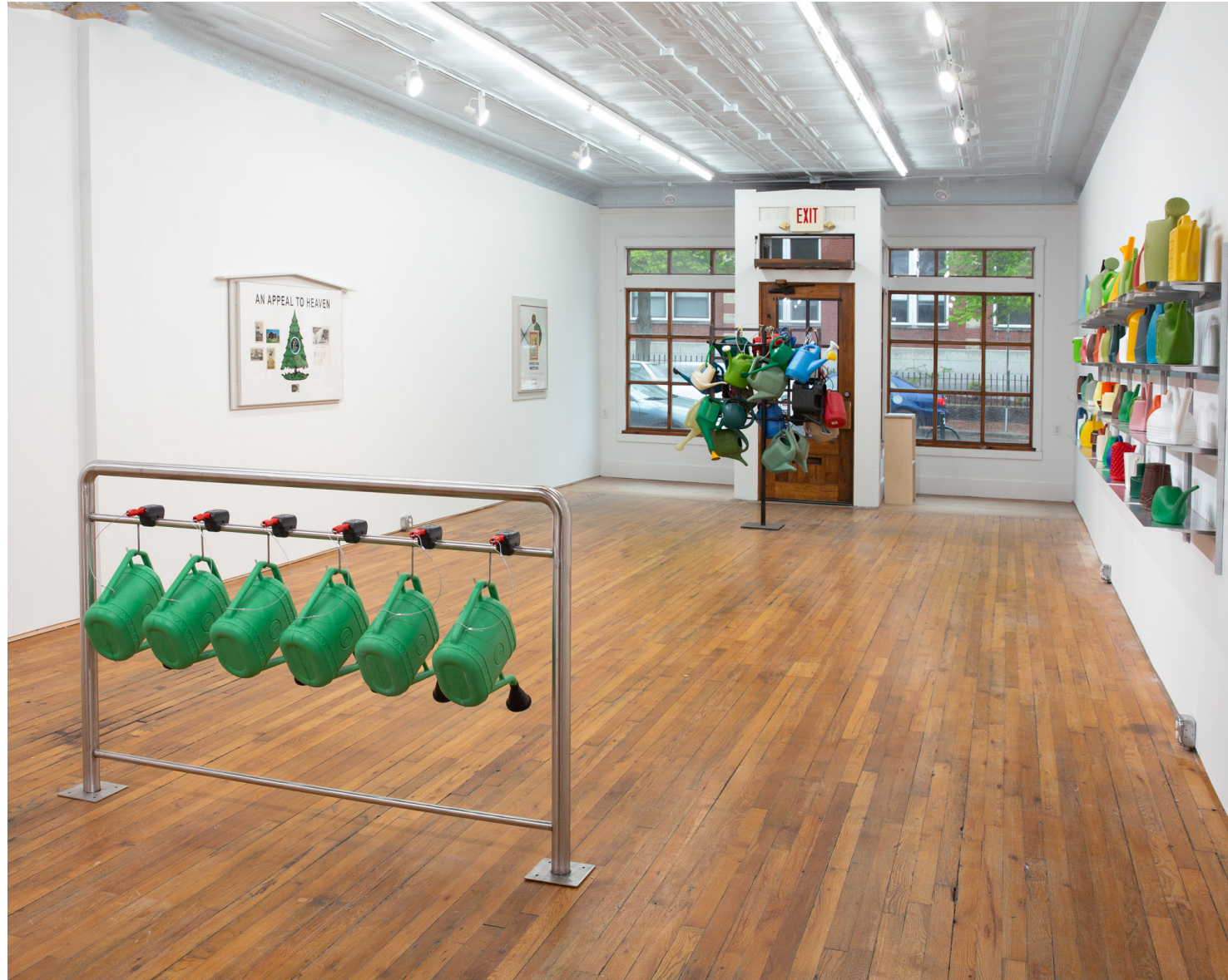
J.O.T.H. (JUST OVER THE HORIZON) installation