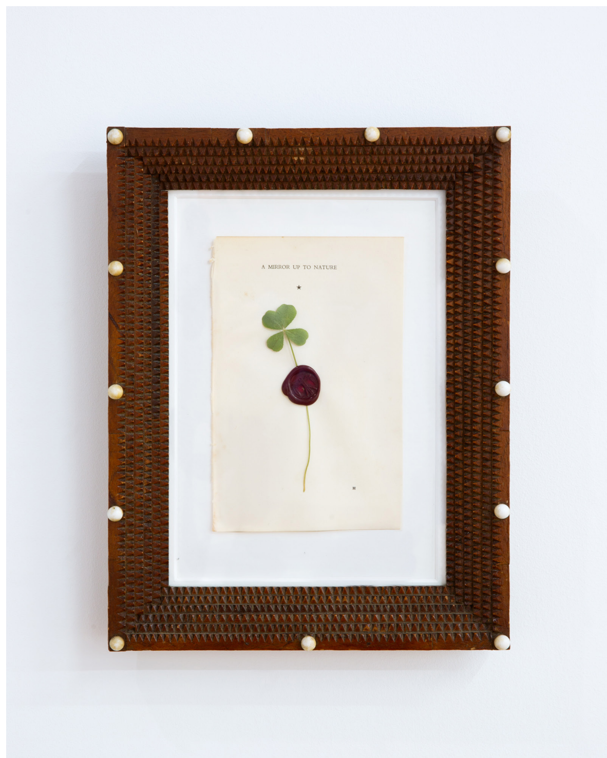
'Homeless Home' 12" x 9" Four leaf clover, wax, book page, Tramp art frame