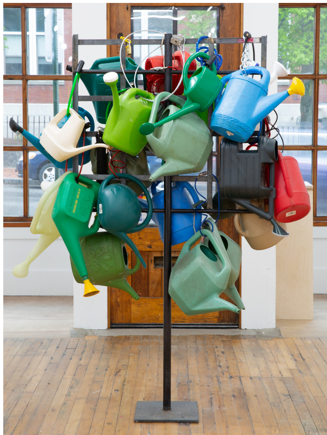
Part 2 'Community Garden (property)' 6'x3' watering cans, locks, steel