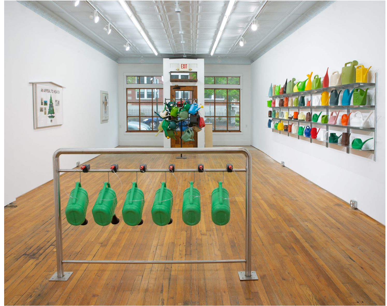
J.O.T.H. (JUST OVER THE HORIZON) installation