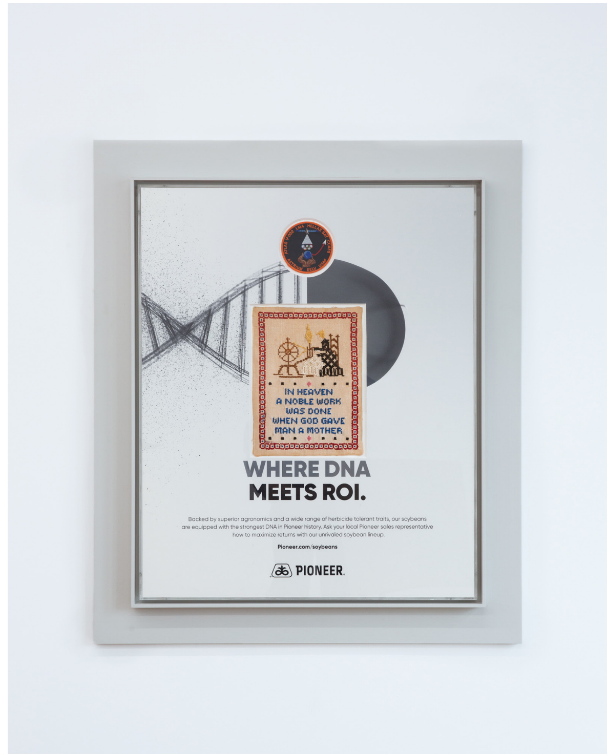
Where DNA meets ROI