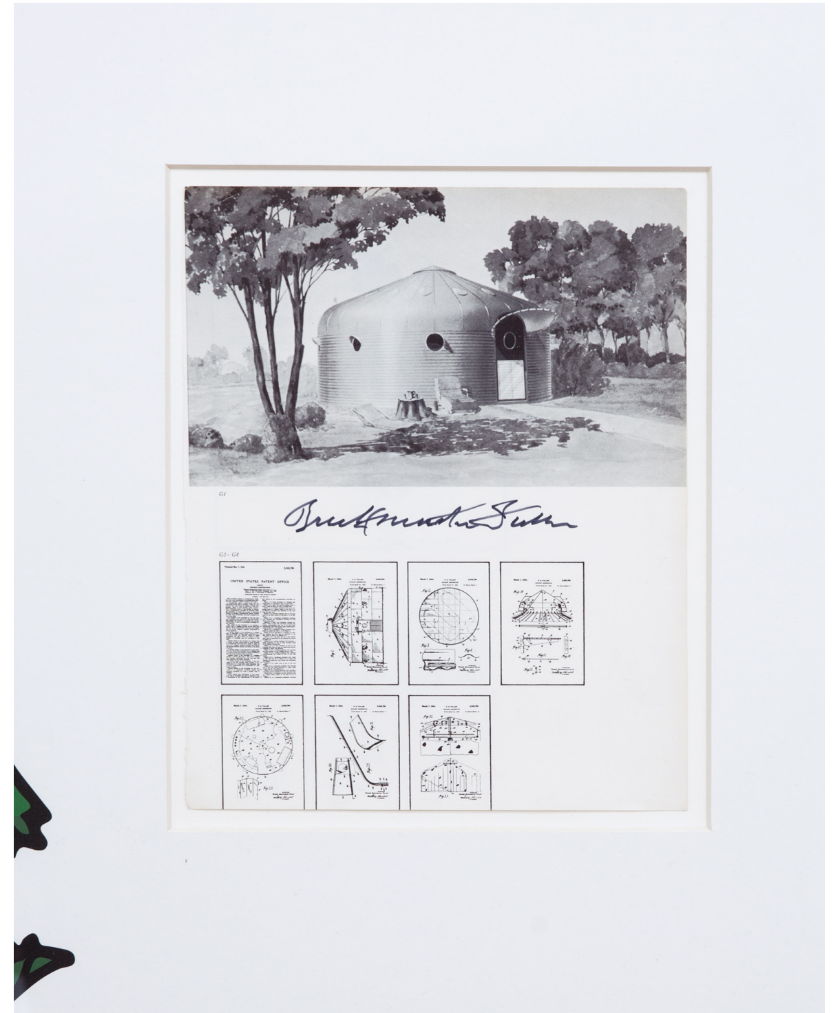
'Bury The Hatchett' (detail)