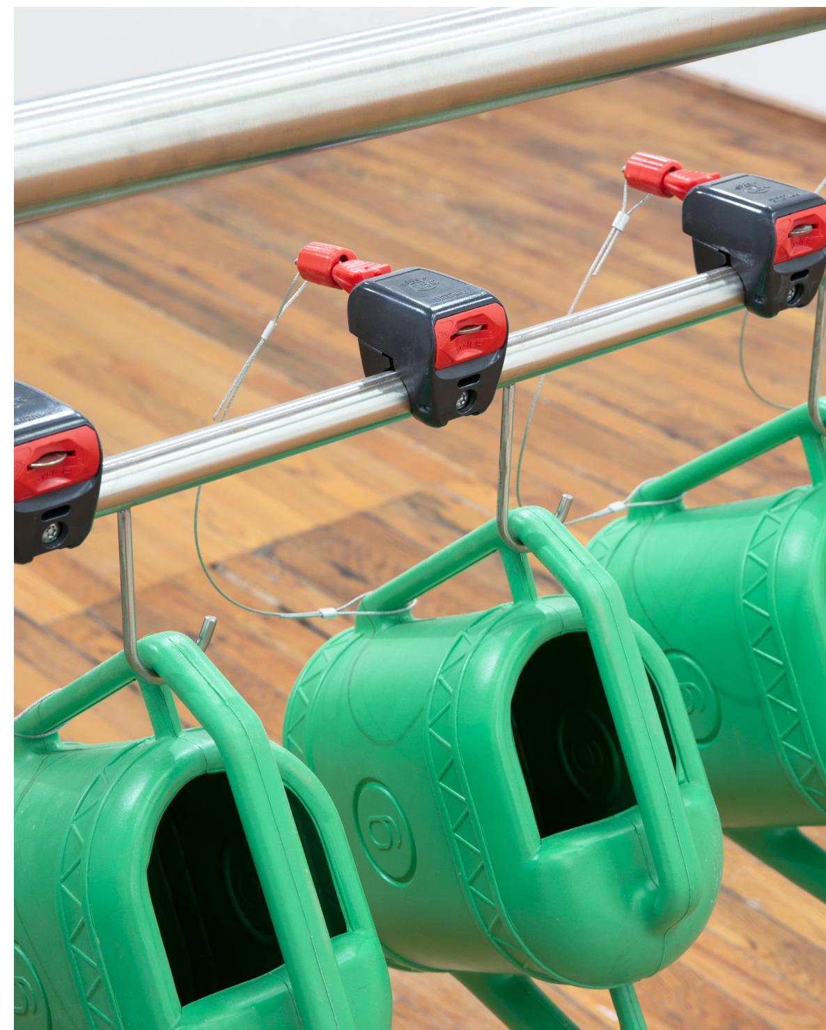
Part 3 (detail) 32.5"x26.5" 'Community Garden (asset)' 6'x3' watering cans, locks, steel