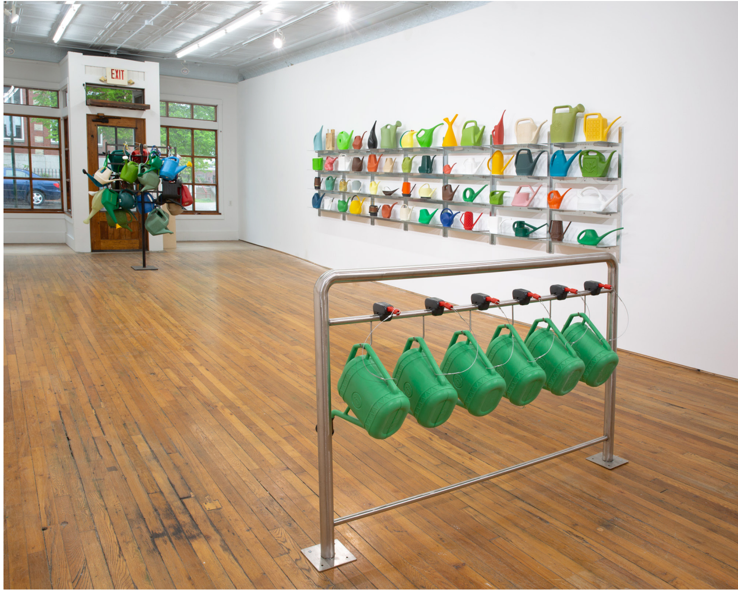
J.O.T.H. (JUST OVER THE HORIZON) installation