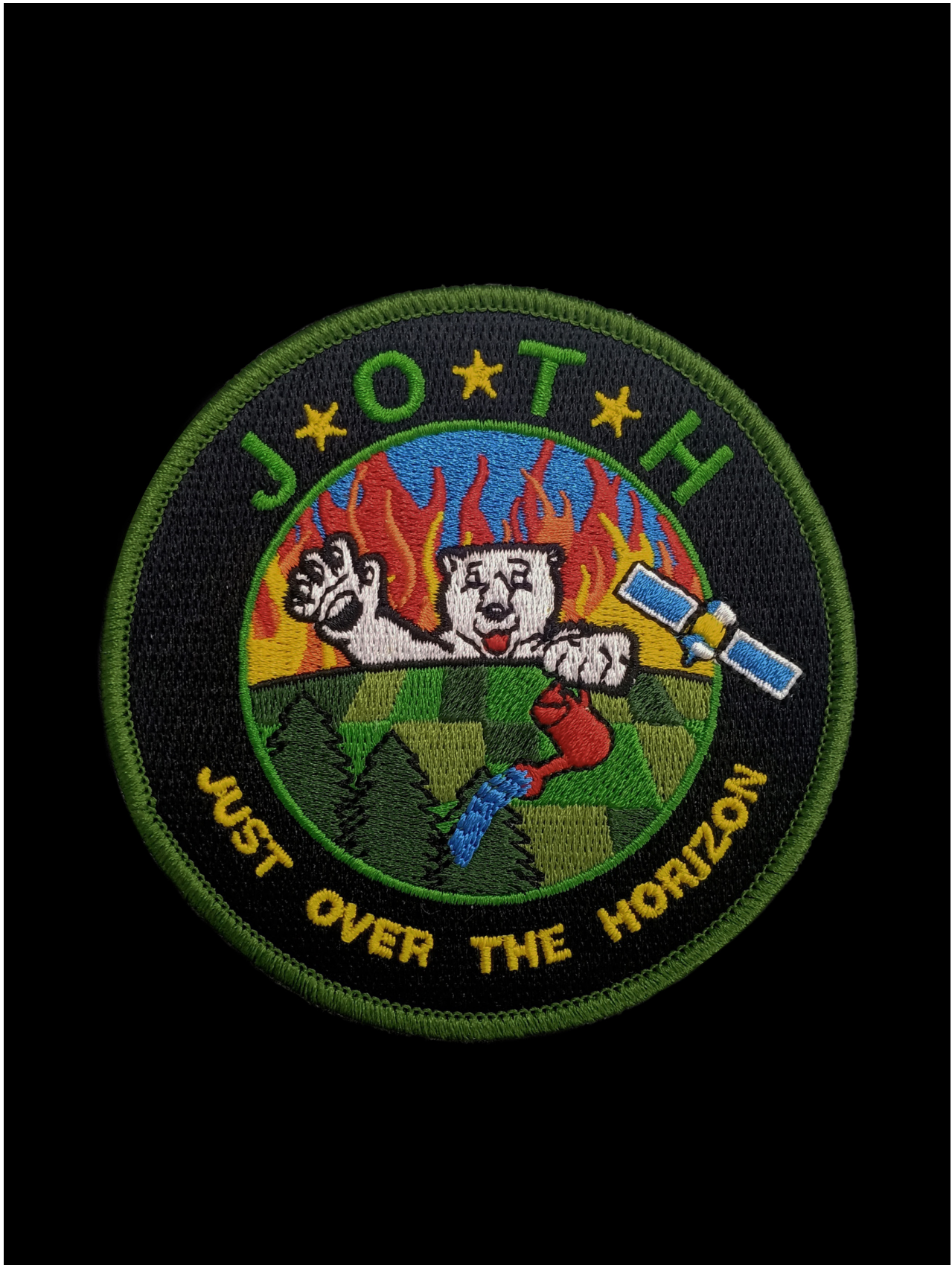
J.O.T.H. patch, 2022 ed. of 100 Embroidery