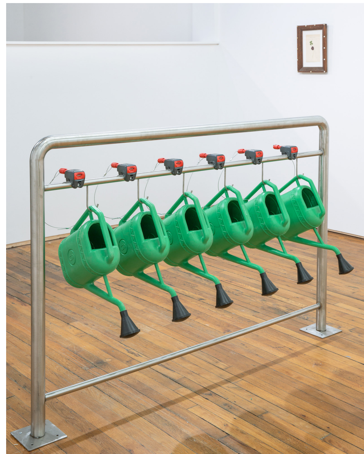
Part 3 'Community Garden (asset)' 6'x3' watering cans, locks, steel