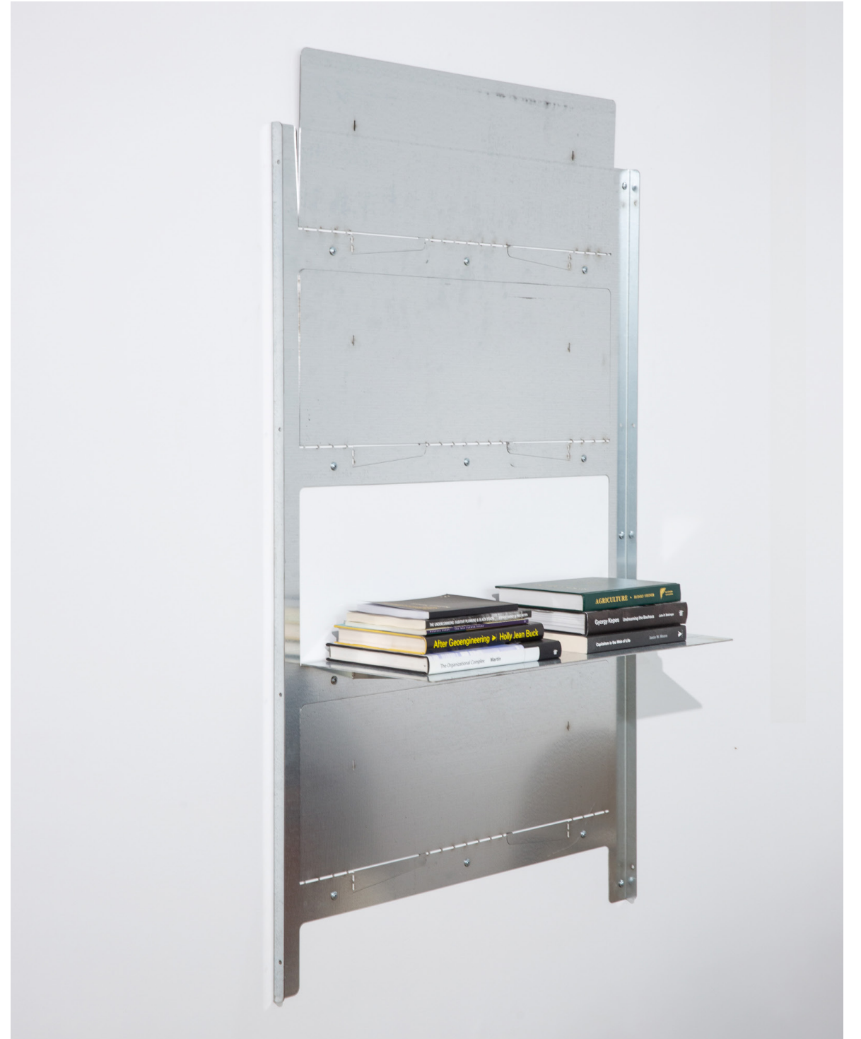
Folding steel shelf designed by artist 2022