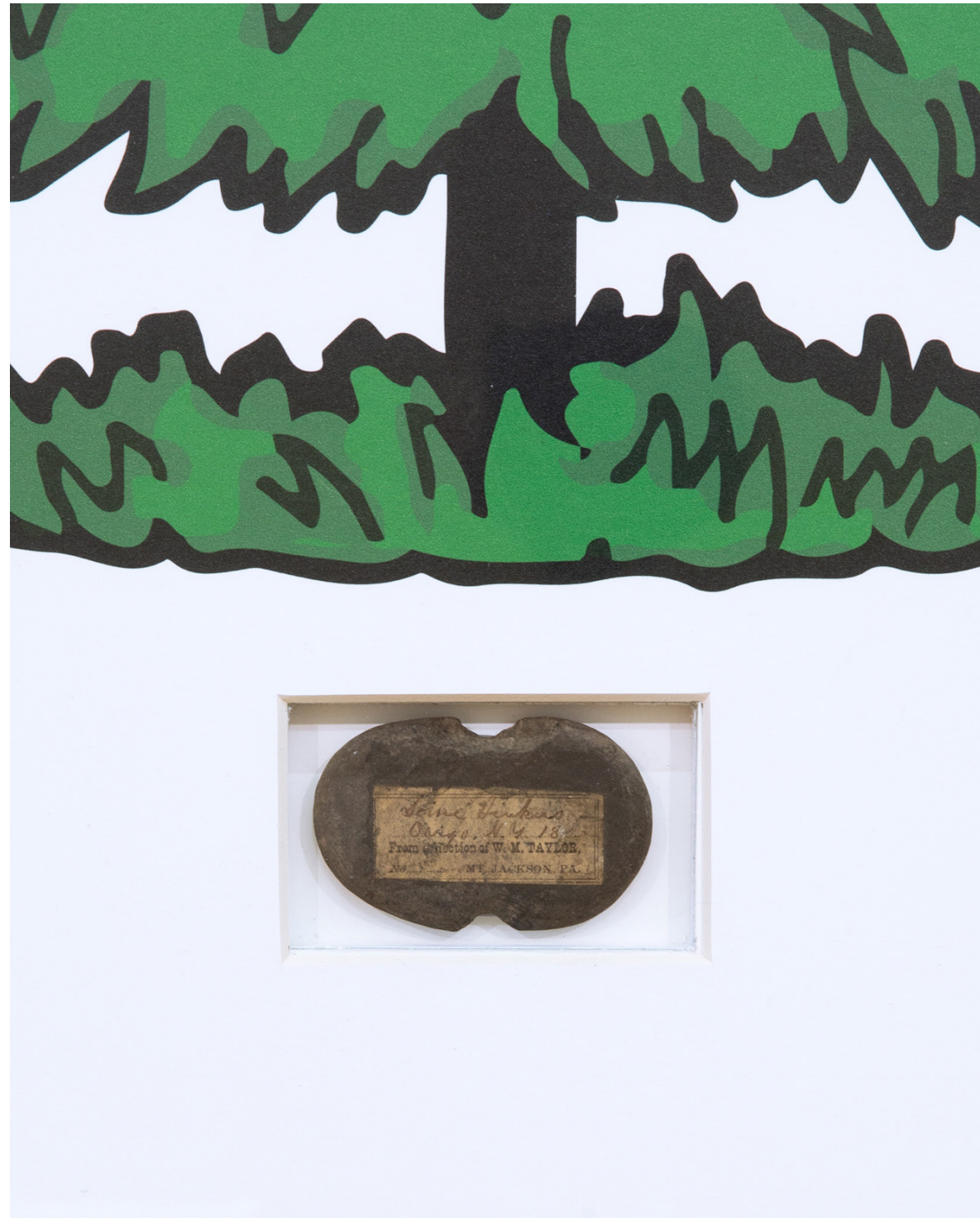
'Bury The Hatchett' (detail)