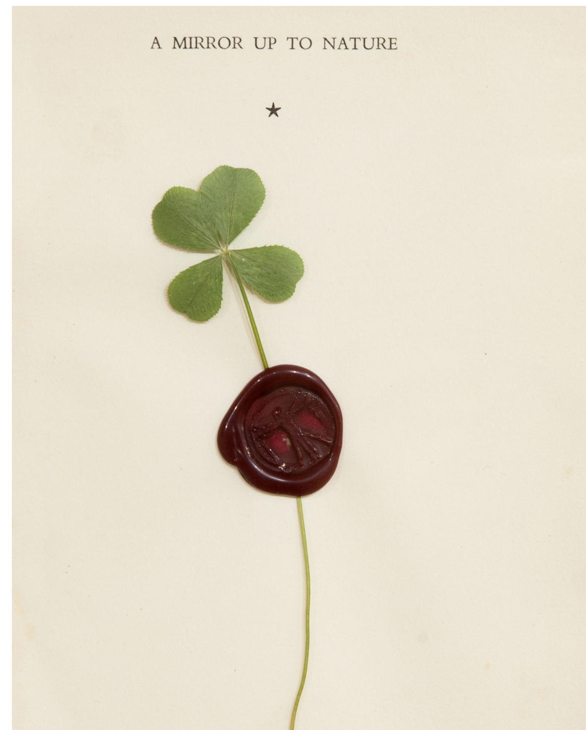
'Homeless Home' (detail) 12" x 9" Four leaf clover, wax, book page, Tramp art frame