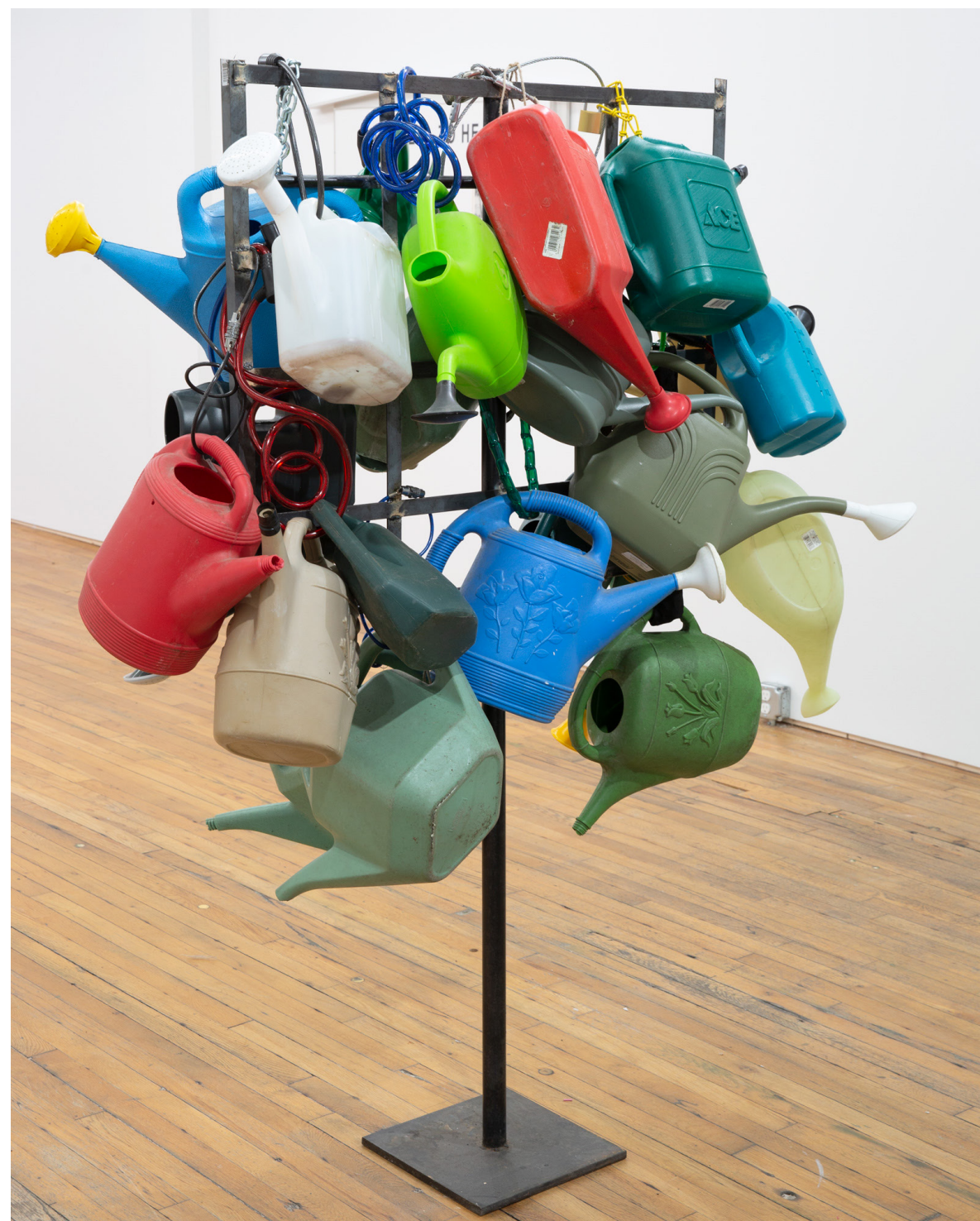
Part 2 'Community Garden (property)' 6'x3' watering cans, locks, steel