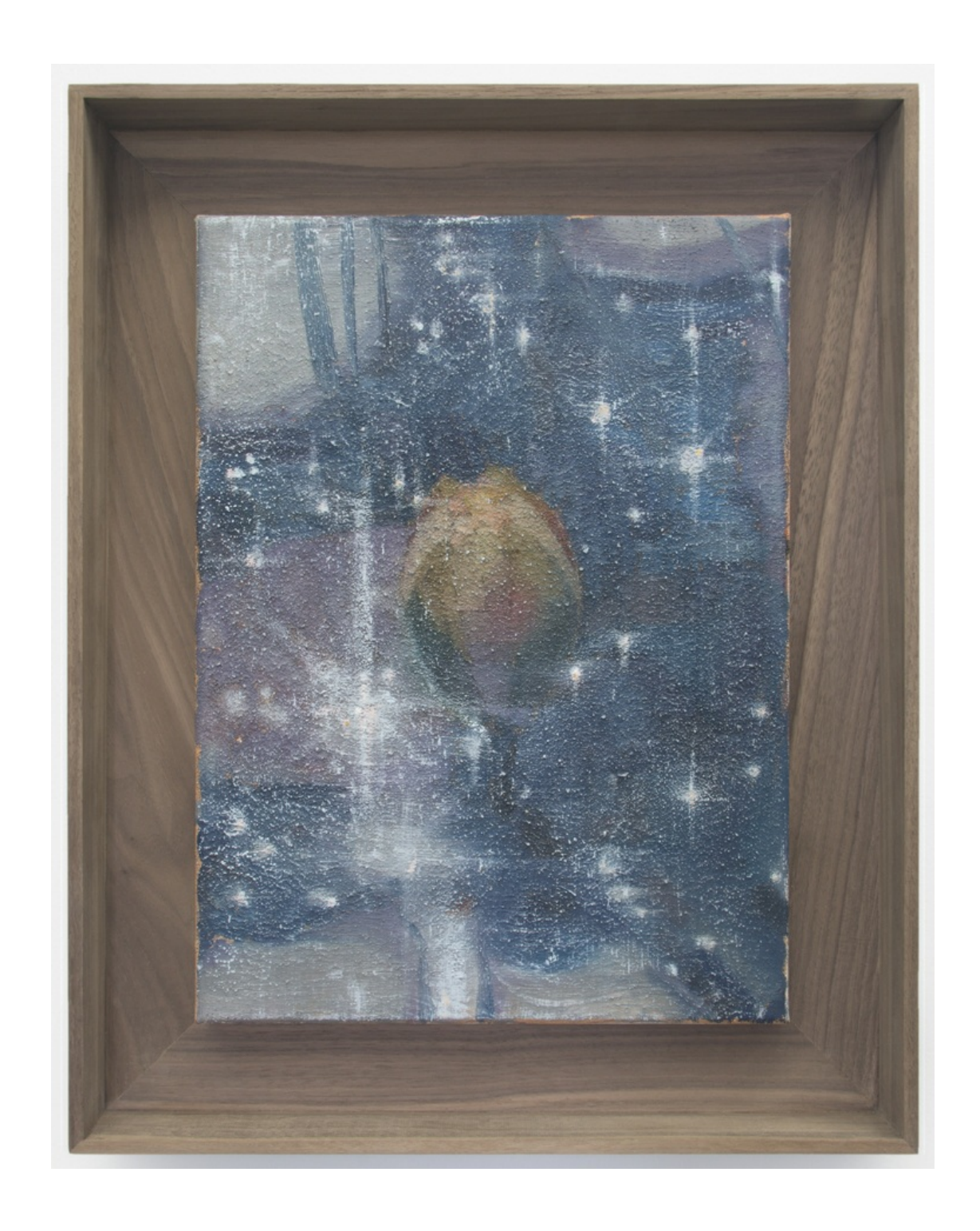
MICHAEL LOMBARDO Water Lily Bud, 2019 Oil on canvas with sand Artist frame, walnut 12 x 9 x 0.625 "