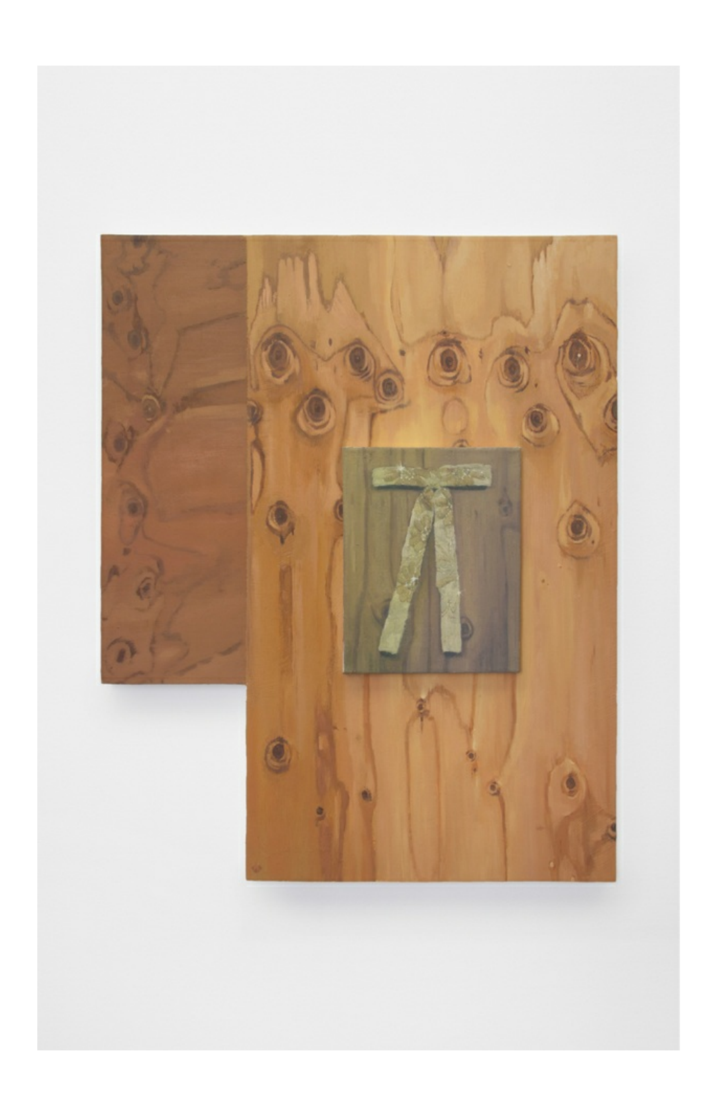
MICHAEL LOMBARDO Clip-On, 2021 Oil on wood panel with mounted oil on canvas 30 \times 24 \times 1.75 "