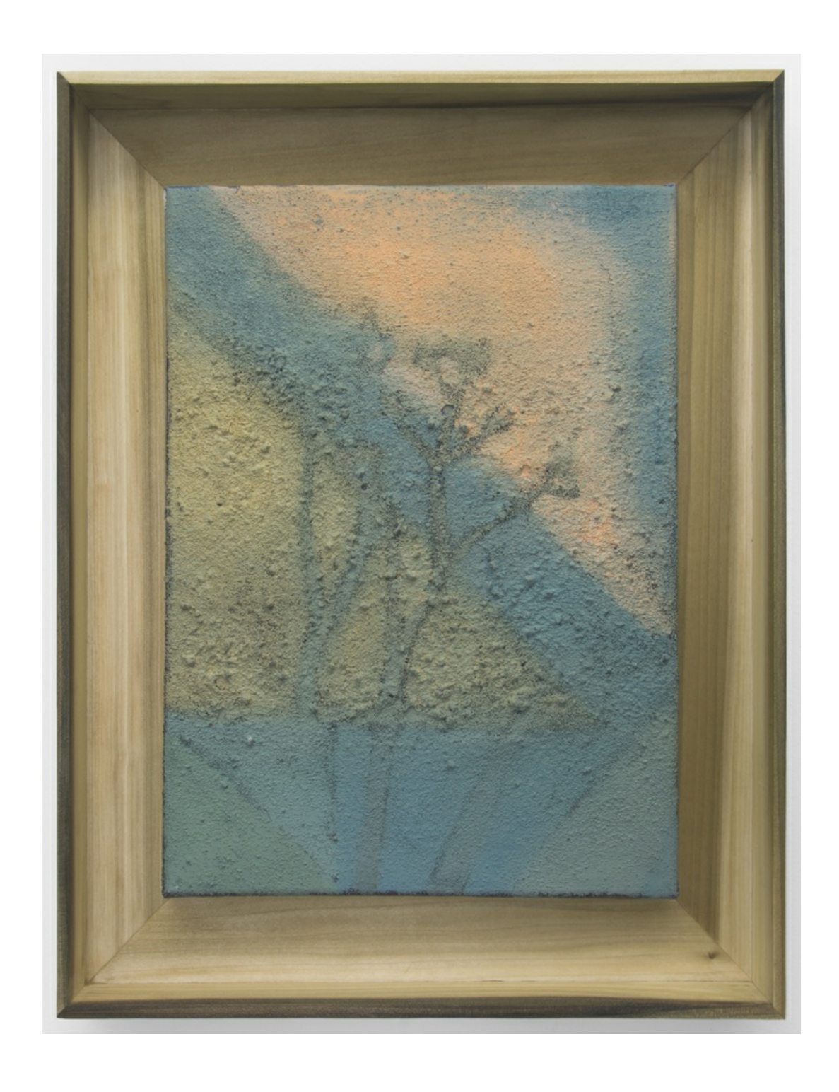
MICHAEL LOMBARDO Coming Home, 2019 Oil on canvas with dirt Artist frame, poplar 12 x 9 x 0.625 "