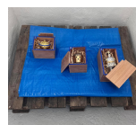
Lyndon Barrois Jr. MagiColor Mile , 2022 Brass and aluminum incense holders, custom oak boxes, acrylic pigment, jute, hay, plastic tarp, pallet 1. 10.5 x 12.5 cm, 2. 12.5 x 10.5 cm, 3. 18 x 10 cm