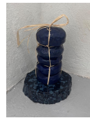
Addoley Dzegede Drained , 2022 Crystalline glazed ceramics, jute twine 22 x 10 cm