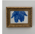
Lyndon Barrois Jr. Evidence (Slick) , 2022 Blue graphite on paper 23.5 x 18.5 cm