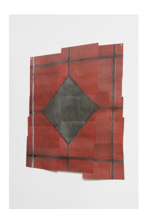
727 N Broadway, 2022 Inkjet prints 30 ½ x 28 ½ inches