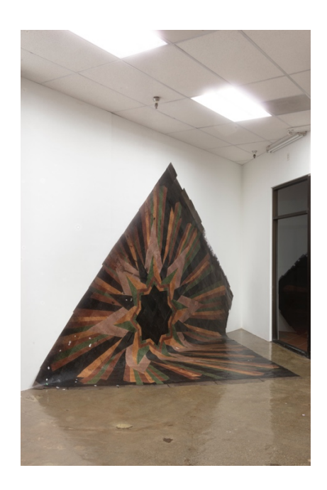
403 W 8 th Street, 2022 Inkjet Prints 120 x 204 x 90 inches