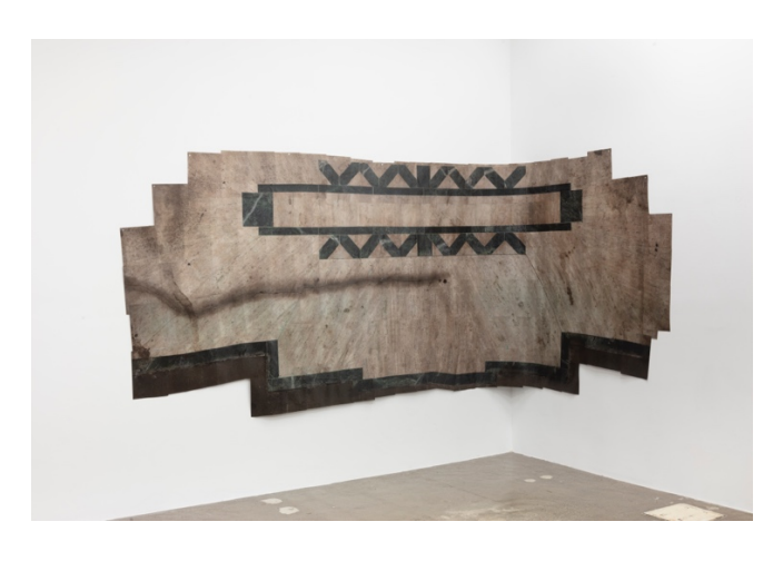
3074 Wilshire Blvd, 2022 Inkjet Prints 62 ½ x 112 x 58 inches