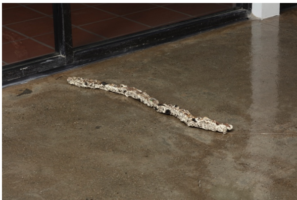
Hiroshi Clark Asphalt Fissure 2020 Silicon, Asphalt, Debris from Ground 30 x 3 x 1.5