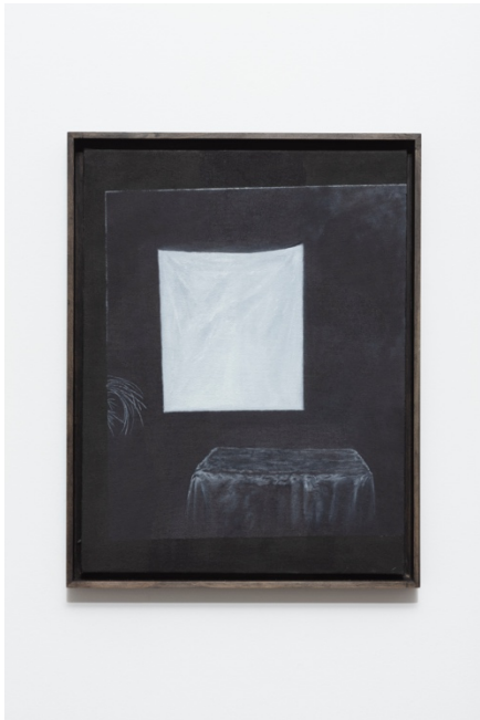
Max Clearly Untitled Paint on canvas Artist made frame 18 x14