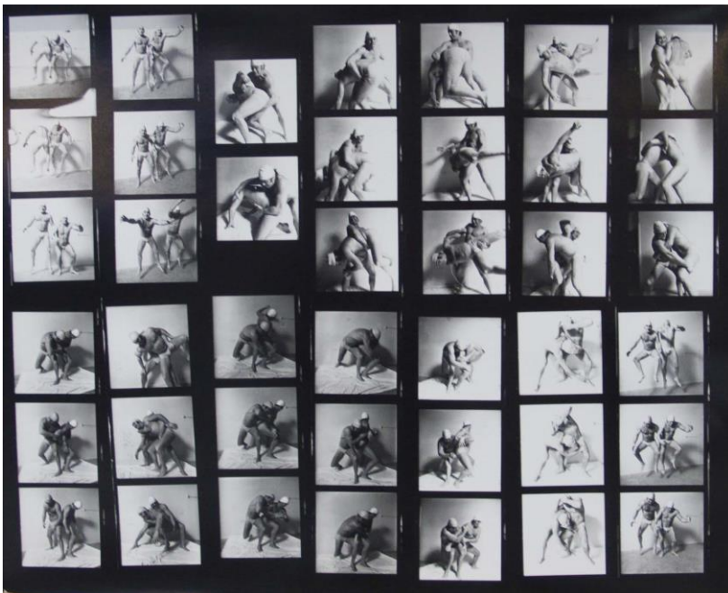
Contact sheet of two men wrestling in a studio from the floor of Bacon's Studio, ca. 1975