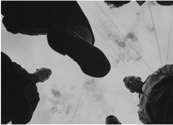
Shomei Tomatsu Untitled [Iwakuni] , from the series Chewing Gum and Chocolate 1960 Vintage gelatin silver print