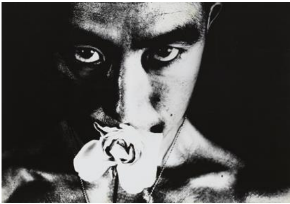
Eikoh Hosoe Ordeal by Roses #32 1961 Vintage gelatin silver print