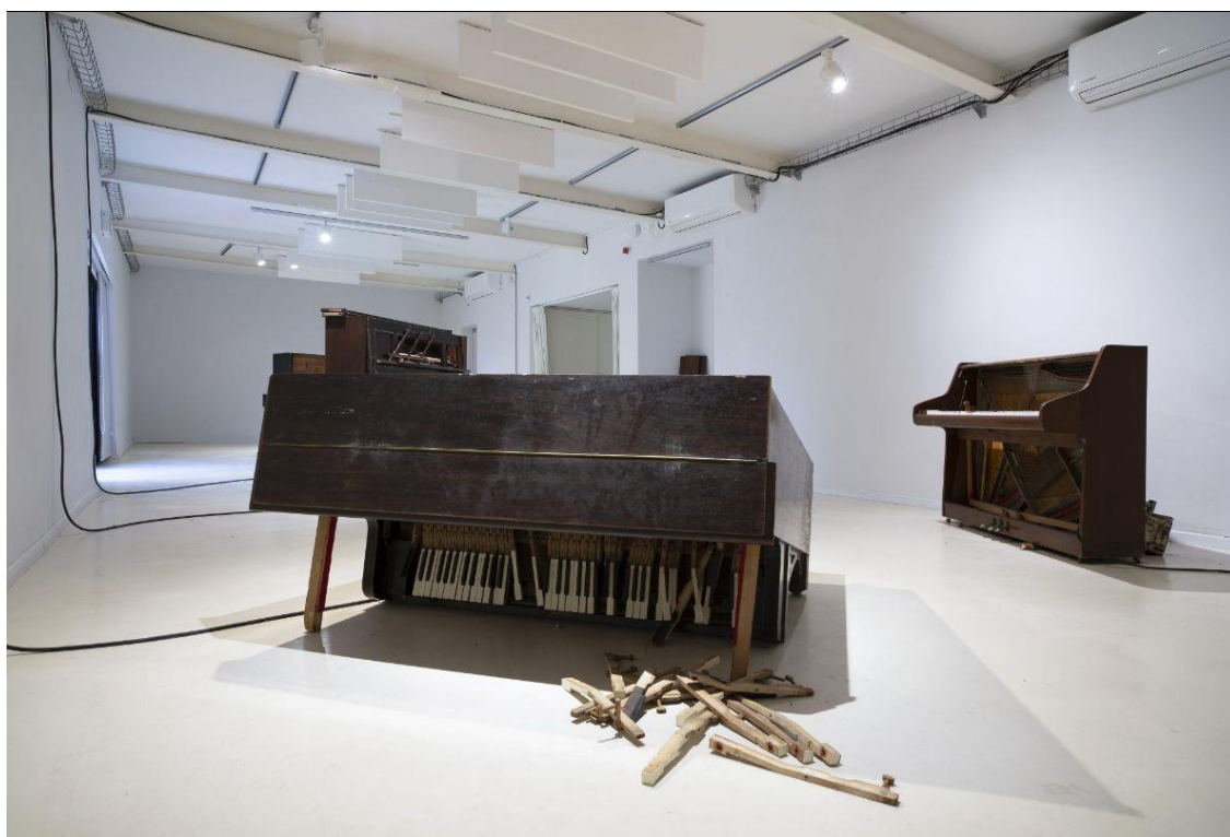
Maya Dunietz. Five Chilling Mammoths , 2021. Installation view at Artists Residence Herzliya.

Solo Exhibition of Newly Commissioned Sound Works Opens at Bemis Center