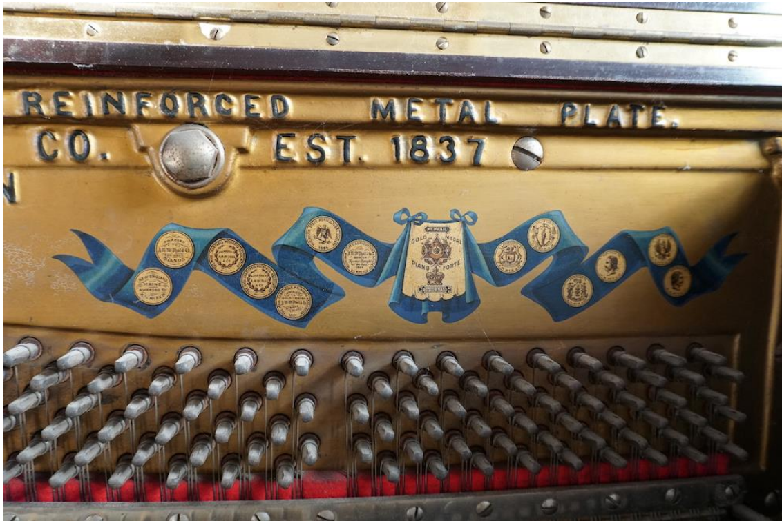
Detail of one of the 17 pianos used in the the Exhibition. Maya Dunietz received the collection of pianos from various donors in Omaha, Nebraska.