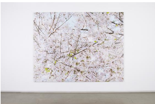
'Blossom leaves', 2010