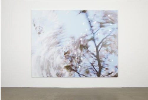
'Blossom – petals', 2009

1-3-2 5F Kiyosumi Koto-ku Tokyo #135-0024, Japan tel 03 5646 6050 fax 03 3642 3067 web www.takaishiigallery.com email tig@takaishiigallery.com