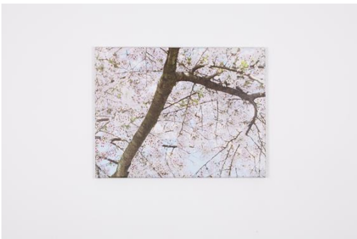
'Blossom – seen Ofili', 2010