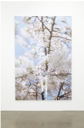
'Blossom – twins', 2009