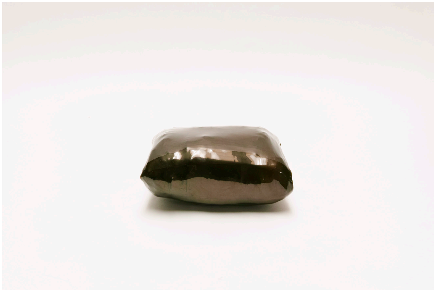
PLASTIC FREEDOM, 2022 Plastic 3 × 6.5 × 5 in.