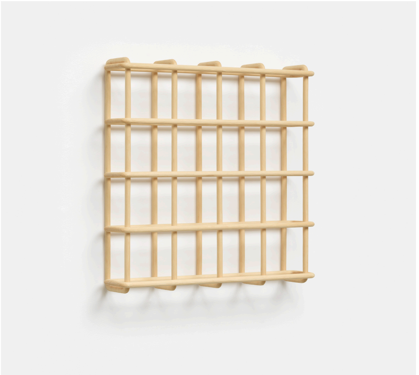
UNTITLED, 2017–ongoing Carved Alaskan yellow cedar Expanded view: 17.75 × 17.75 × 4 in.

Known collectively as 'the carvings', these pieces record nothing more than the time in which they were made. Each is unique – carved out of a single block of wood, and cut in such a way that it unfolds into a bounded grid of interlocking links that either hang from the wall or nest in collapsed form.