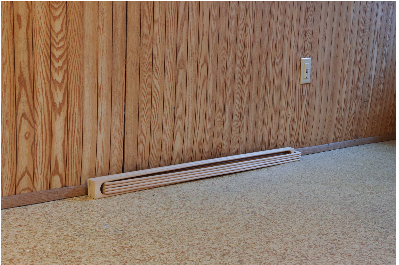
UNTITLED, 2013–ongoing Alaskan Yellow Cedar Collapsed: 2.25 × 2.25 × 41.5 in.