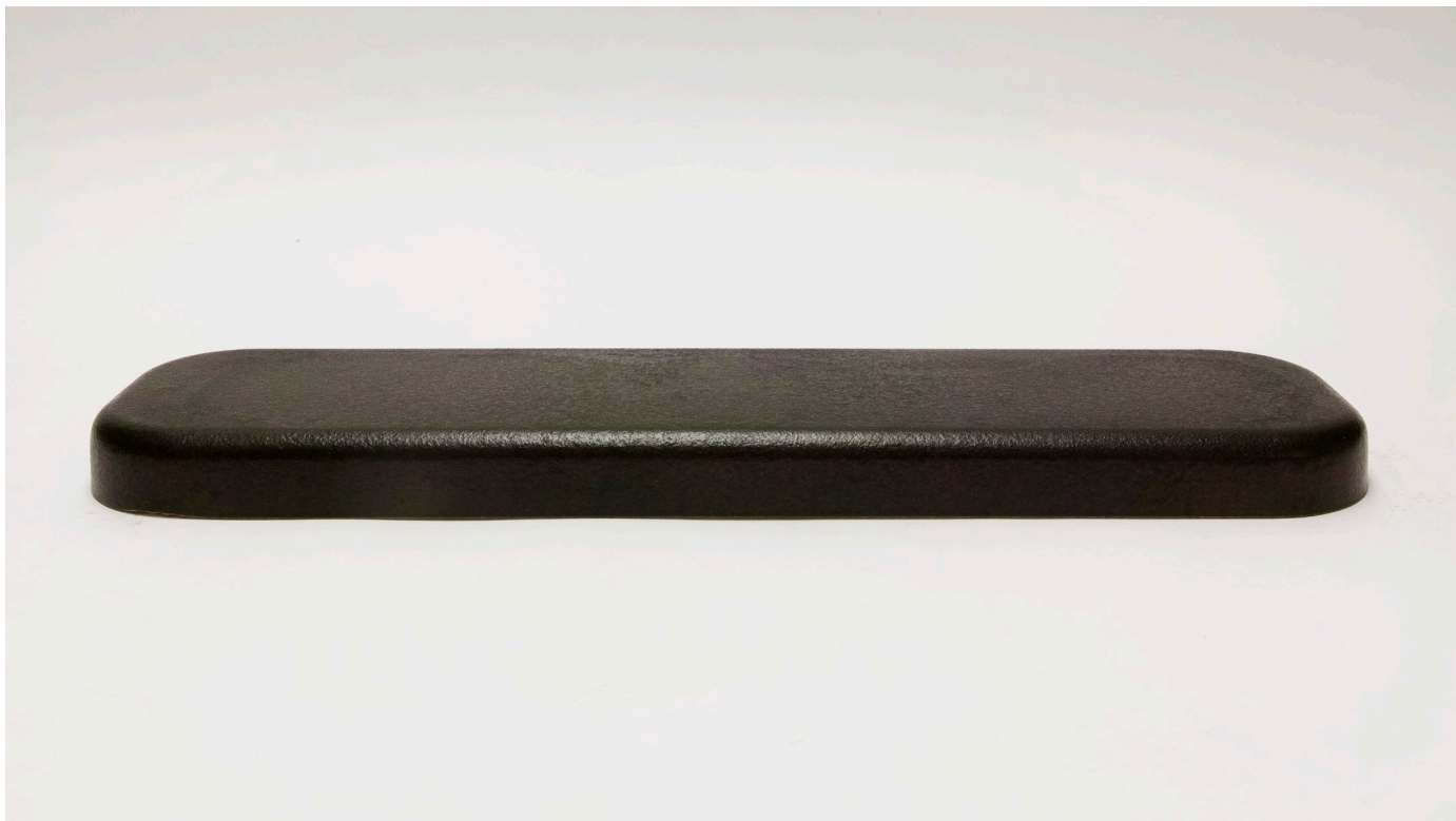
THE SHAPE OF CONTENT Hydrocal, Walnut ink, Egg yolk 1.5 × 20 × 5 in.