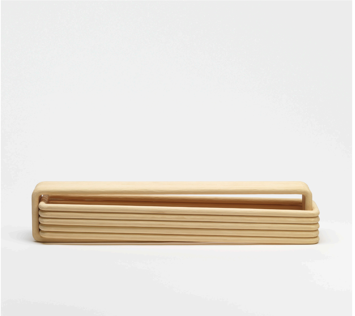
UNTITLED, 2017–ongoing Carved Alaskan yellow cedar Collapsed view: 3.75 × 3.75 × 18 in.