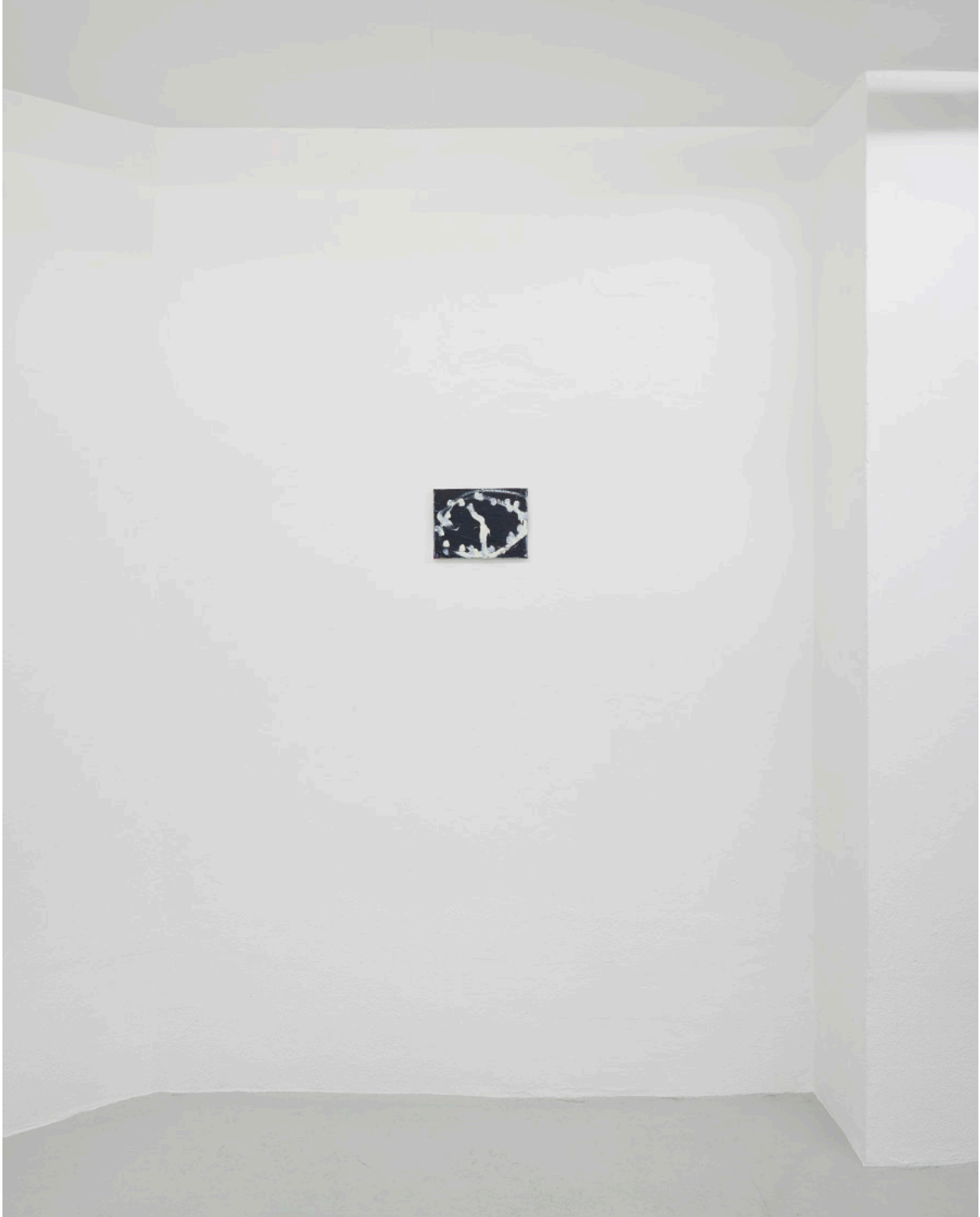
Magnus Frederik Clausen. Work . 2022. (Installation view)