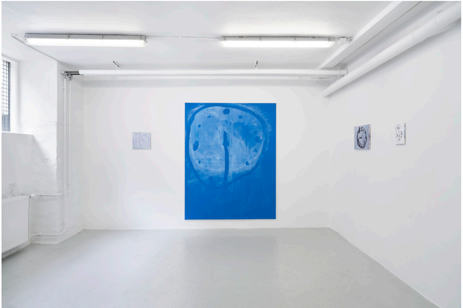
Magnus Frederik Clausen. Work . 2022. (Installation view)