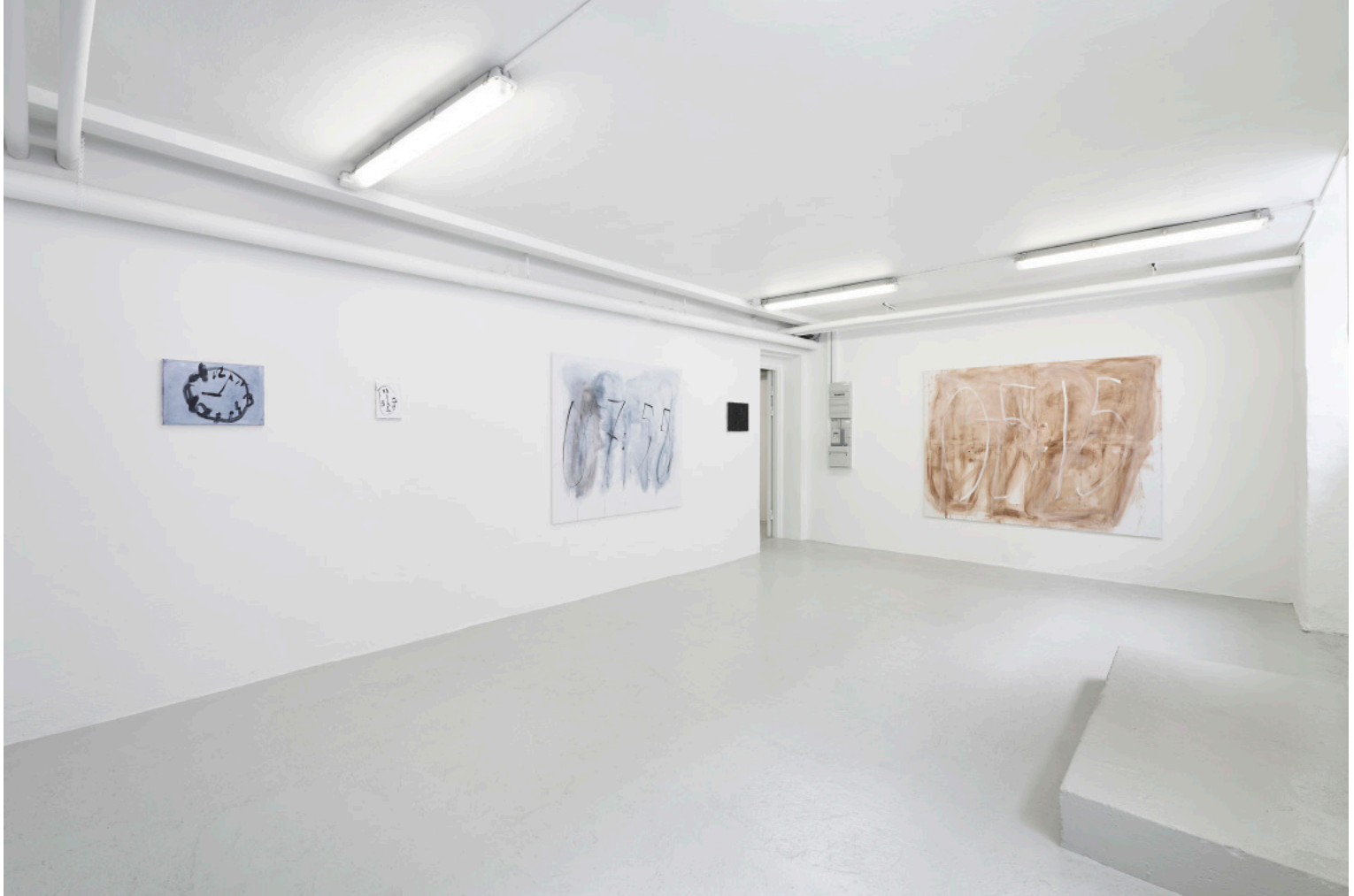
Magnus Frederik Clausen. Work . 2022. (Installation view)