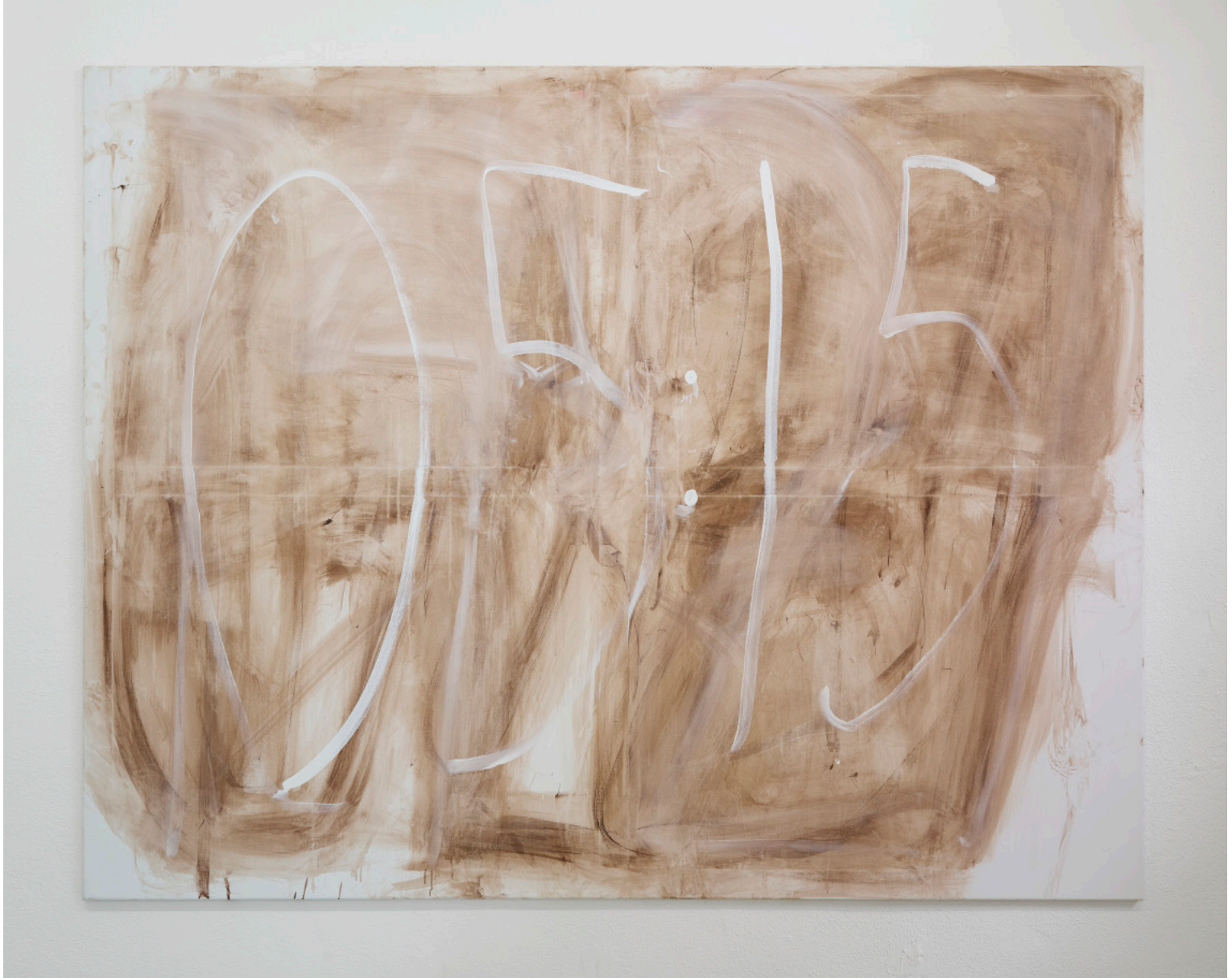
Magnus Frederik Clausen. Fivefifteen (Nina) , 2021. Acrylic on primed polyester. 150 × 191 cm