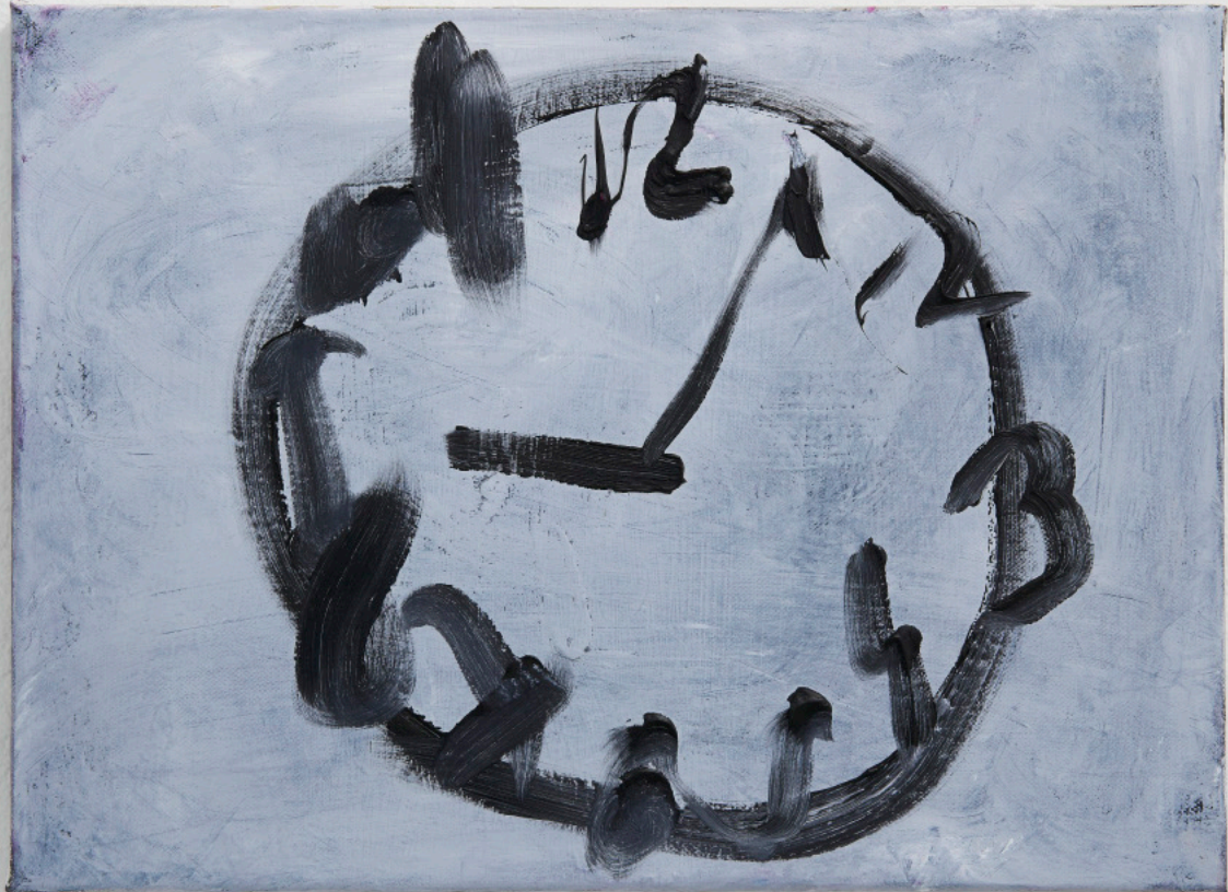
Magnus Frederik Clausen. Fiveminutespastnine (Nina) , 2021. Acrylic and oil on primed linen. 30 × 41 cm