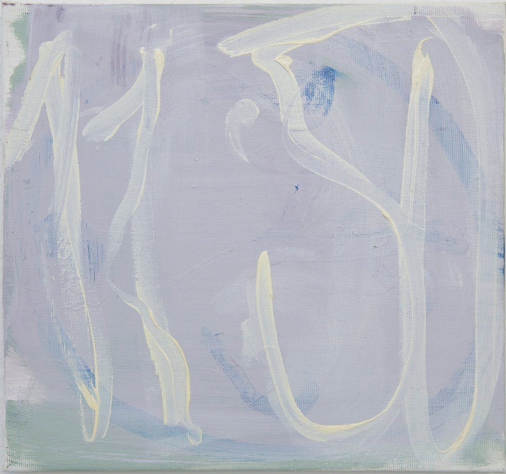
Magnus Frederik Clausen. Tentotwelve (Noah) , 2021. Acrylic and oil on primed linen. 27 × 29 cm