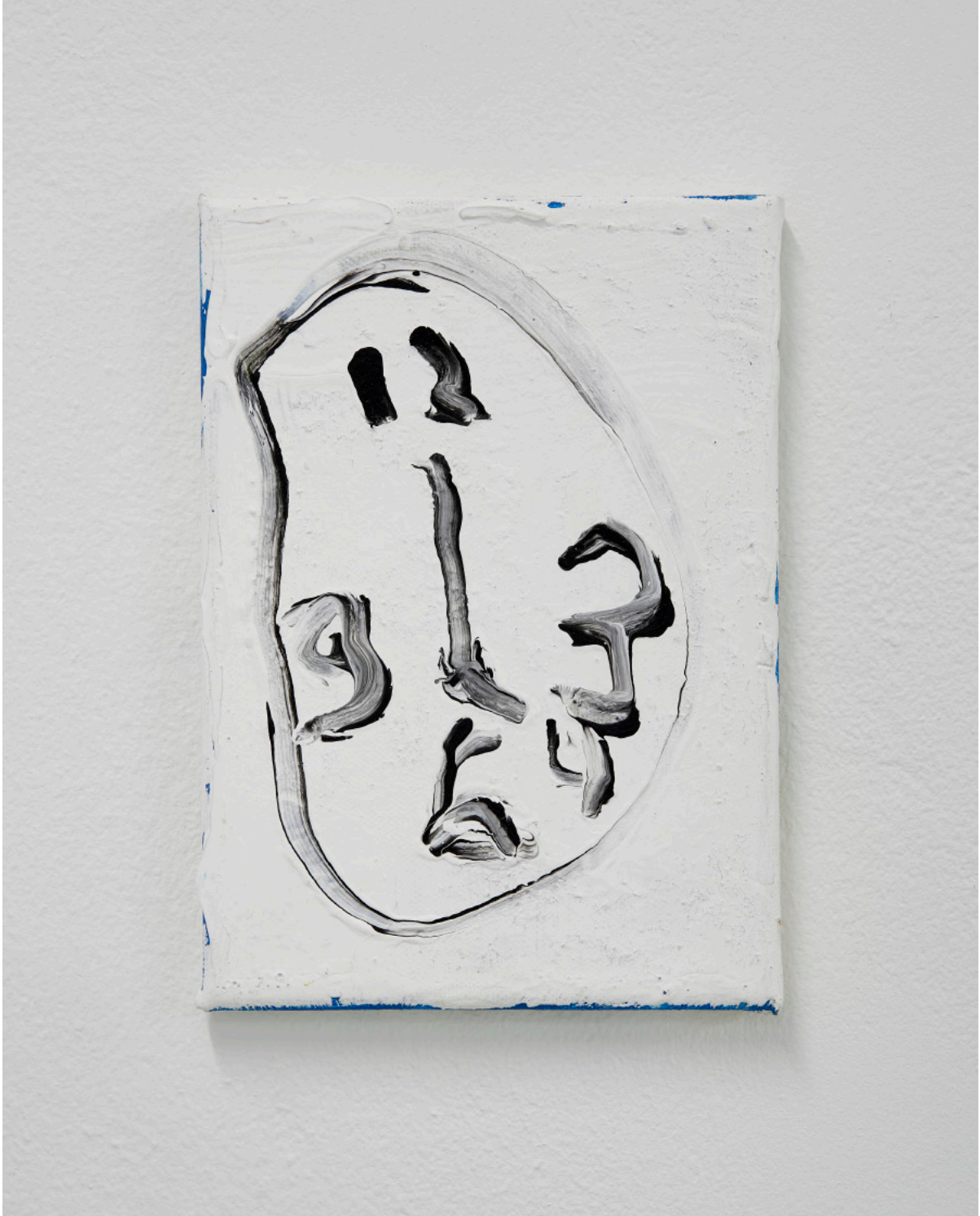
Magnus Frederik Clausen. It's four (Benny) , 2021. Acrylic on primed canvas. 21×15 cm