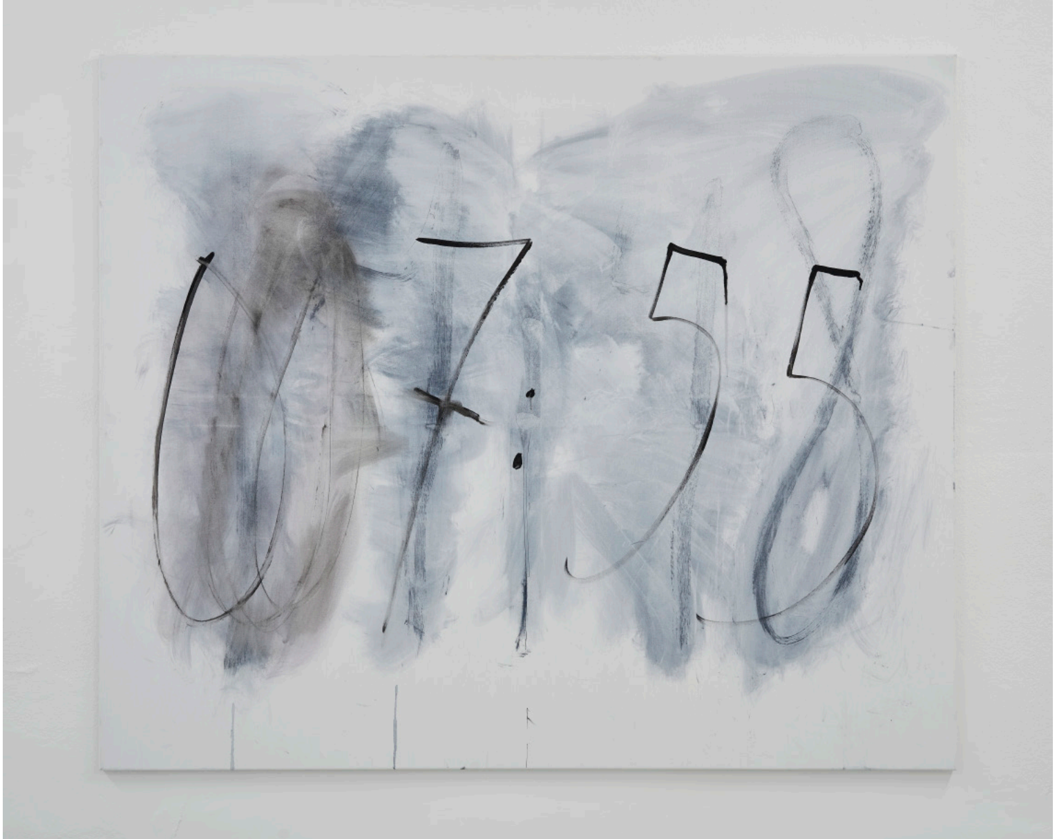
Magnus Frederik Clausen. Sevenfiftyeight (Nina) , 2021. Acrylic on primed polyester. 125 × 150 cm