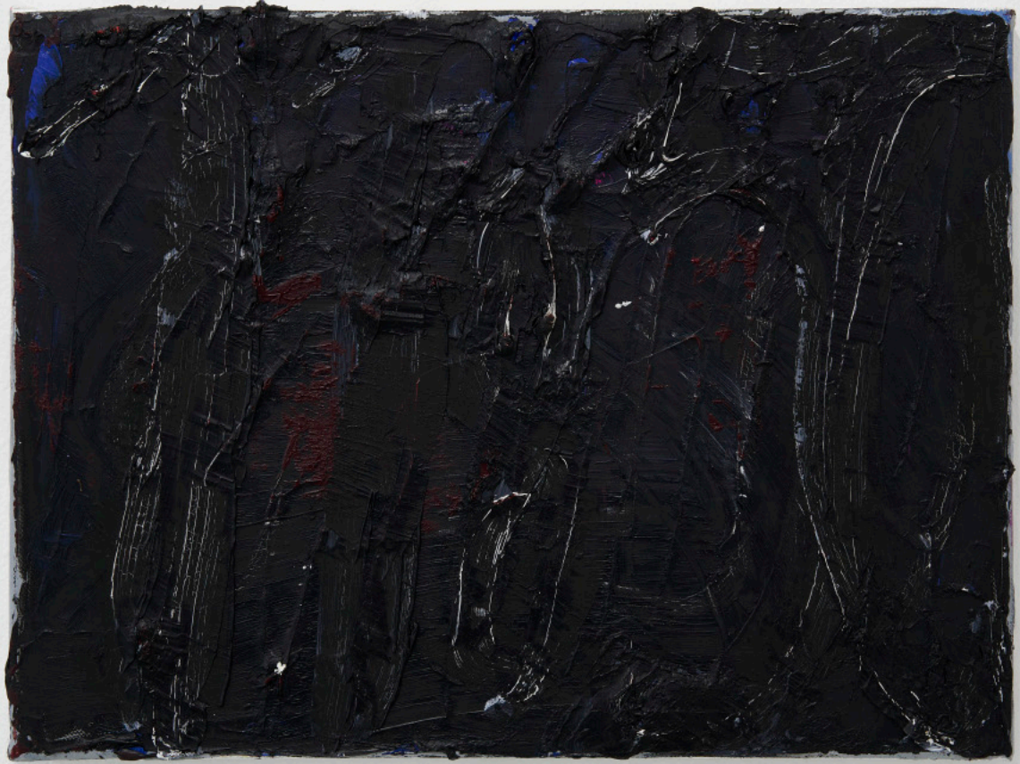
Magnus Frederik Clausen. Tentotwelve (Nina after Noah) , 2021. Acrylic and oil on primed linen. 29 × 39 cm