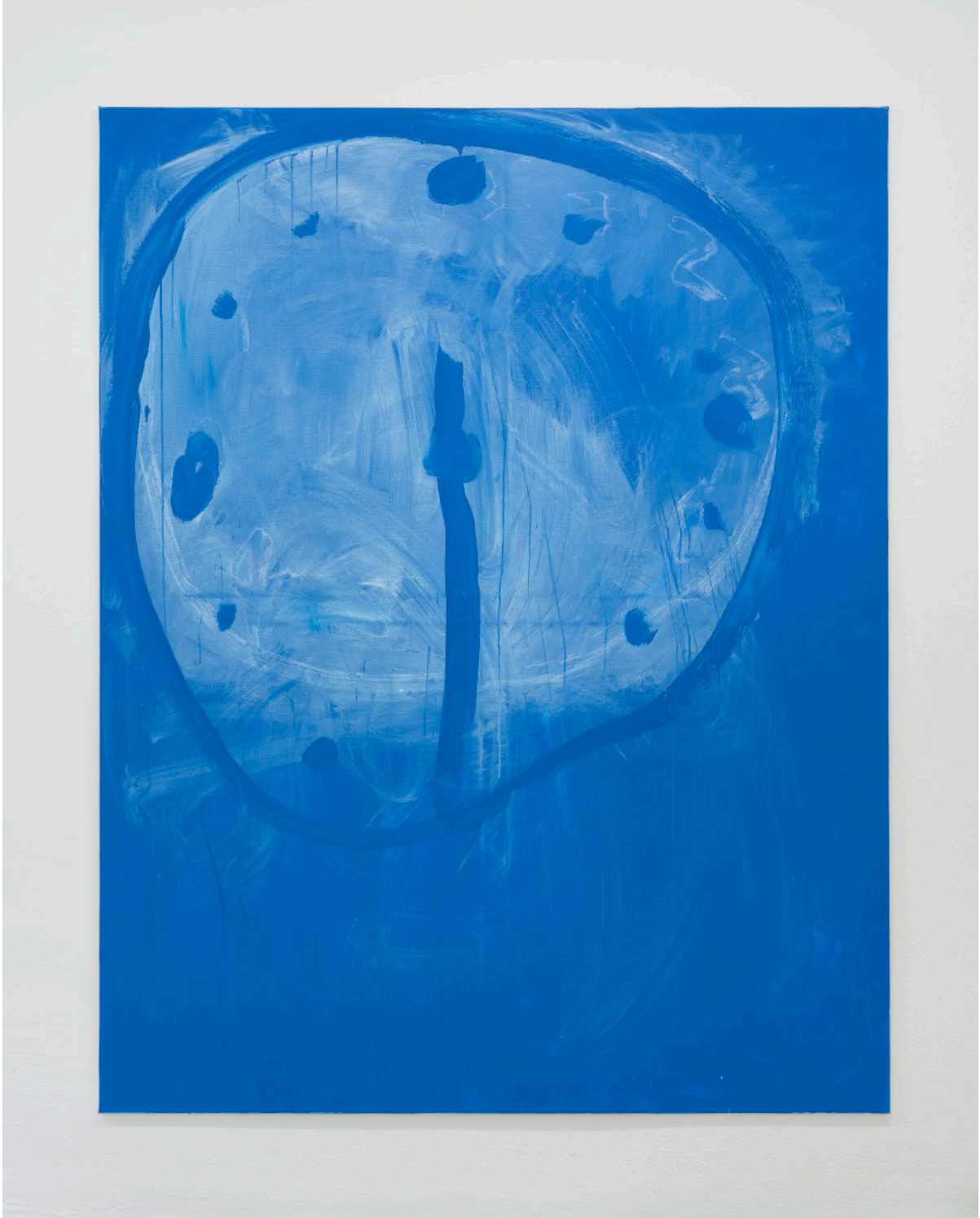
Magnus Frederik Clausen. Halfpasttwelve (Zoë) , 2021. Acrylic on primed linen. 191 × 150 cm