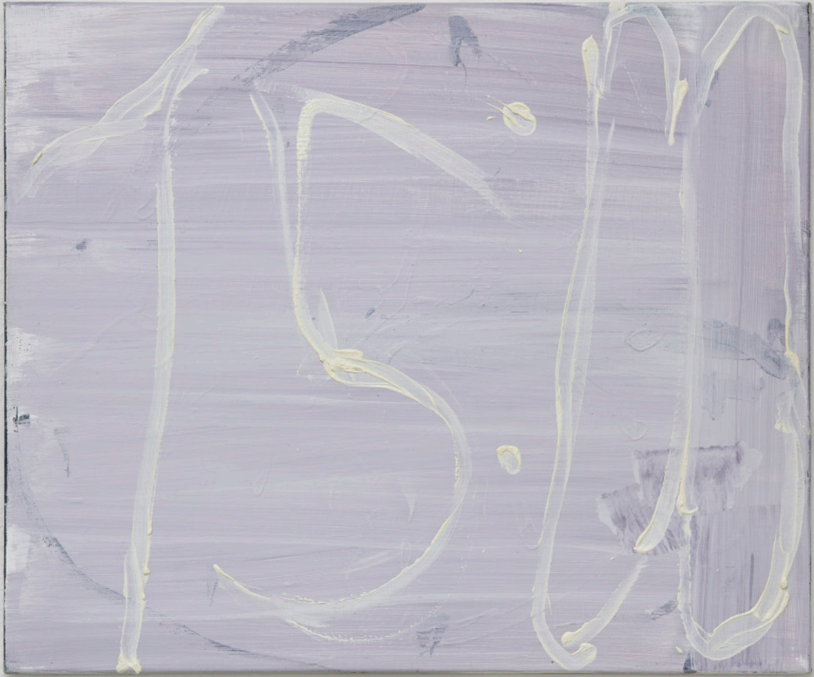
Magnus Frederik Clausen. Threeo'clock (Noah) , 2021. Acrylic and oil on primed linen. 50 × 60 cm