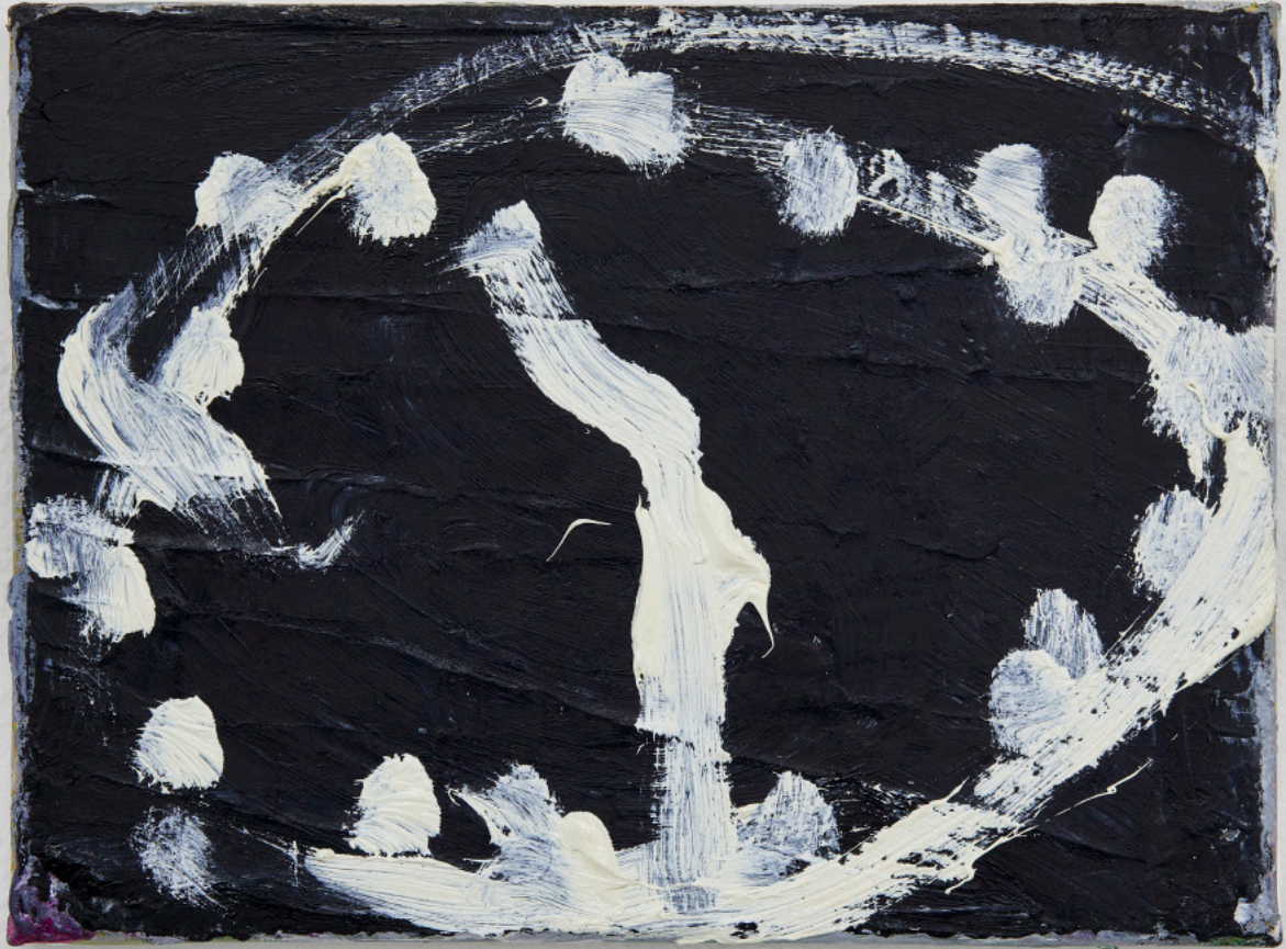
Magnus Frederik Clausen. Twotofive (Noah) , 2021. Acrylic and oil on primed canvas. 18×24 cm