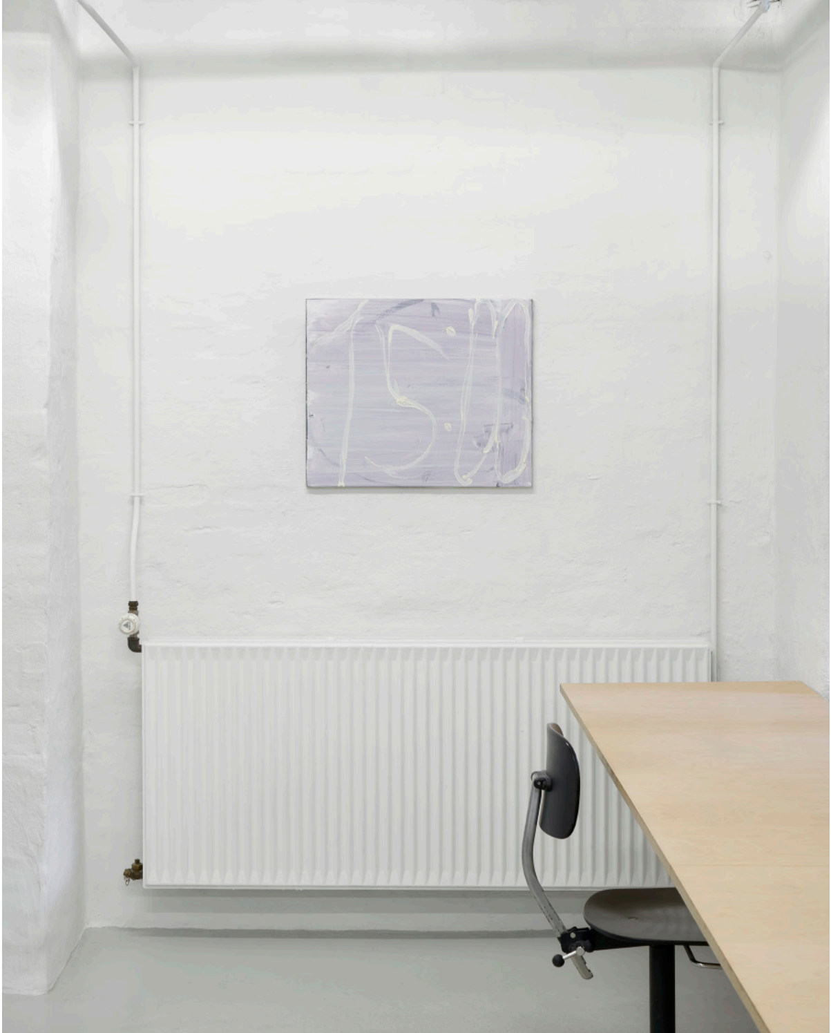
Magnus Frederik Clausen. Work . 2022. (Installation view)