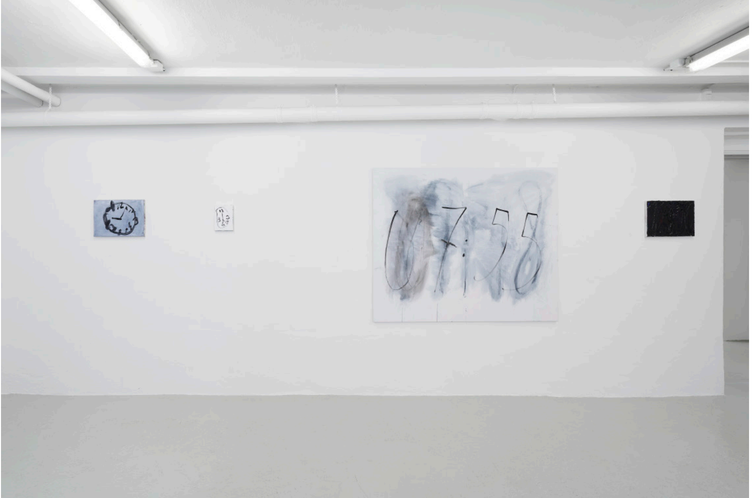
Magnus Frederik Clausen. Work . 2022. (Installation view)