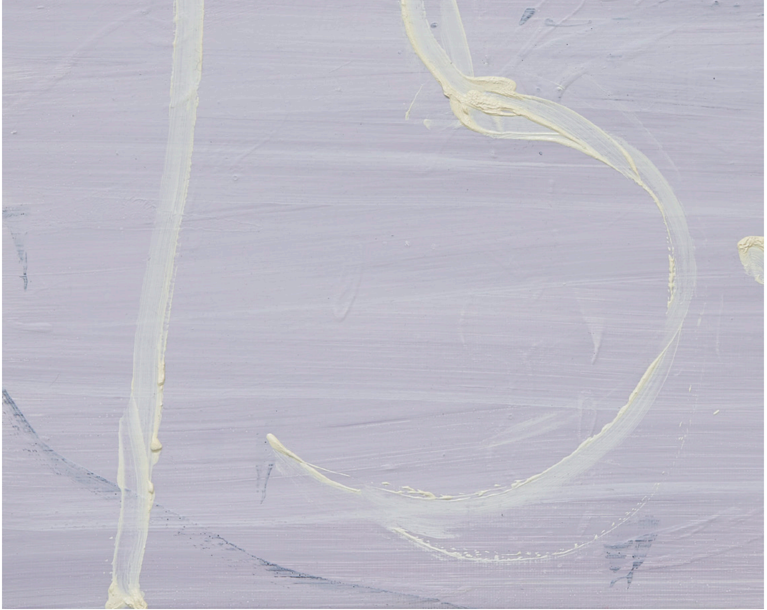
Magnus Frederik Clausen. Threeo'clock (Noah) , 2021. (Detail)