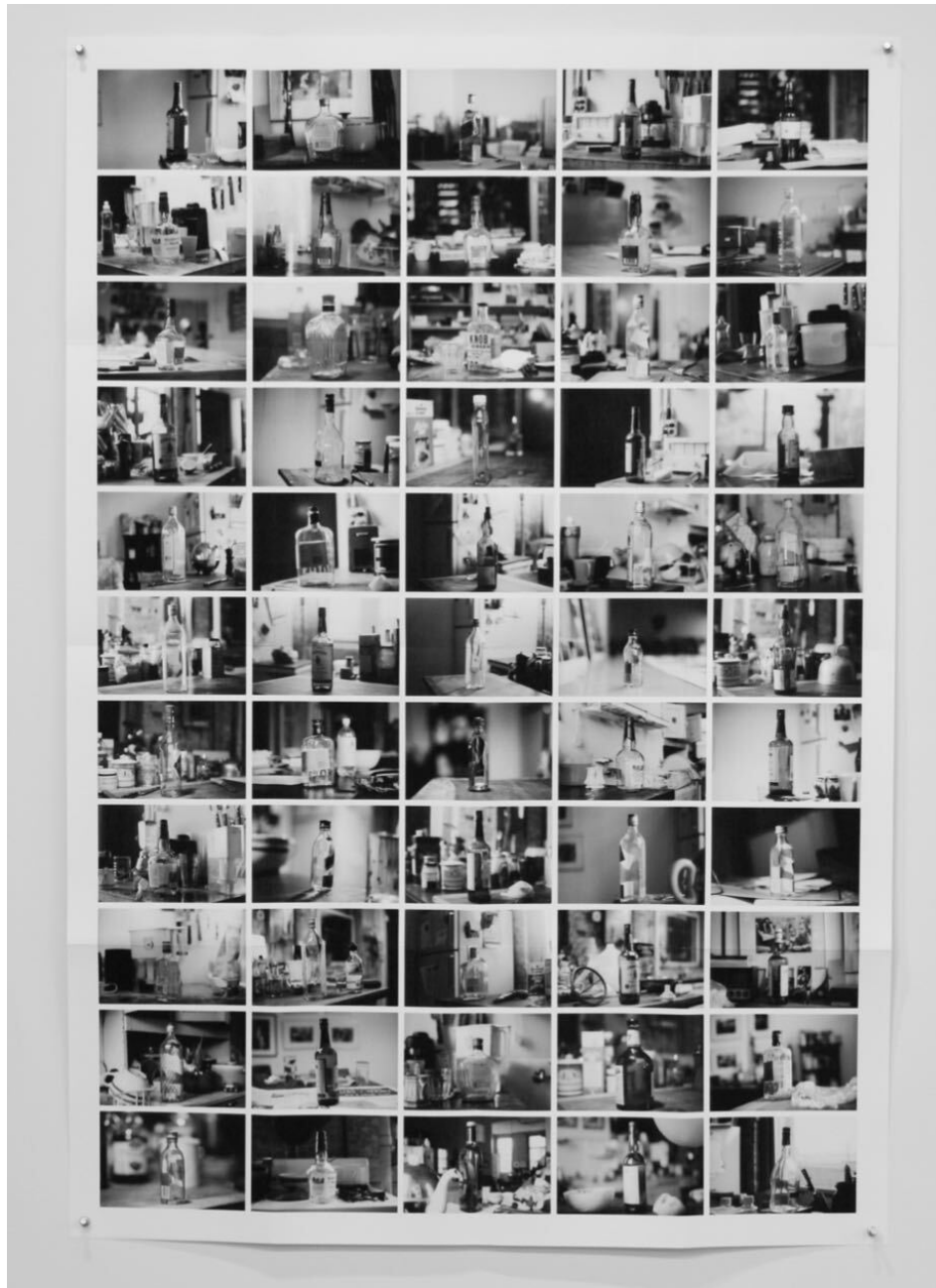
Moyra Davey Bottles, Complete Set , 2013 Edition 12 + 2AP Inkjet Print on Hahnemuhle Paper, folded 46.75 x 32 in (118.7 x 81.3 cm) M.D0001