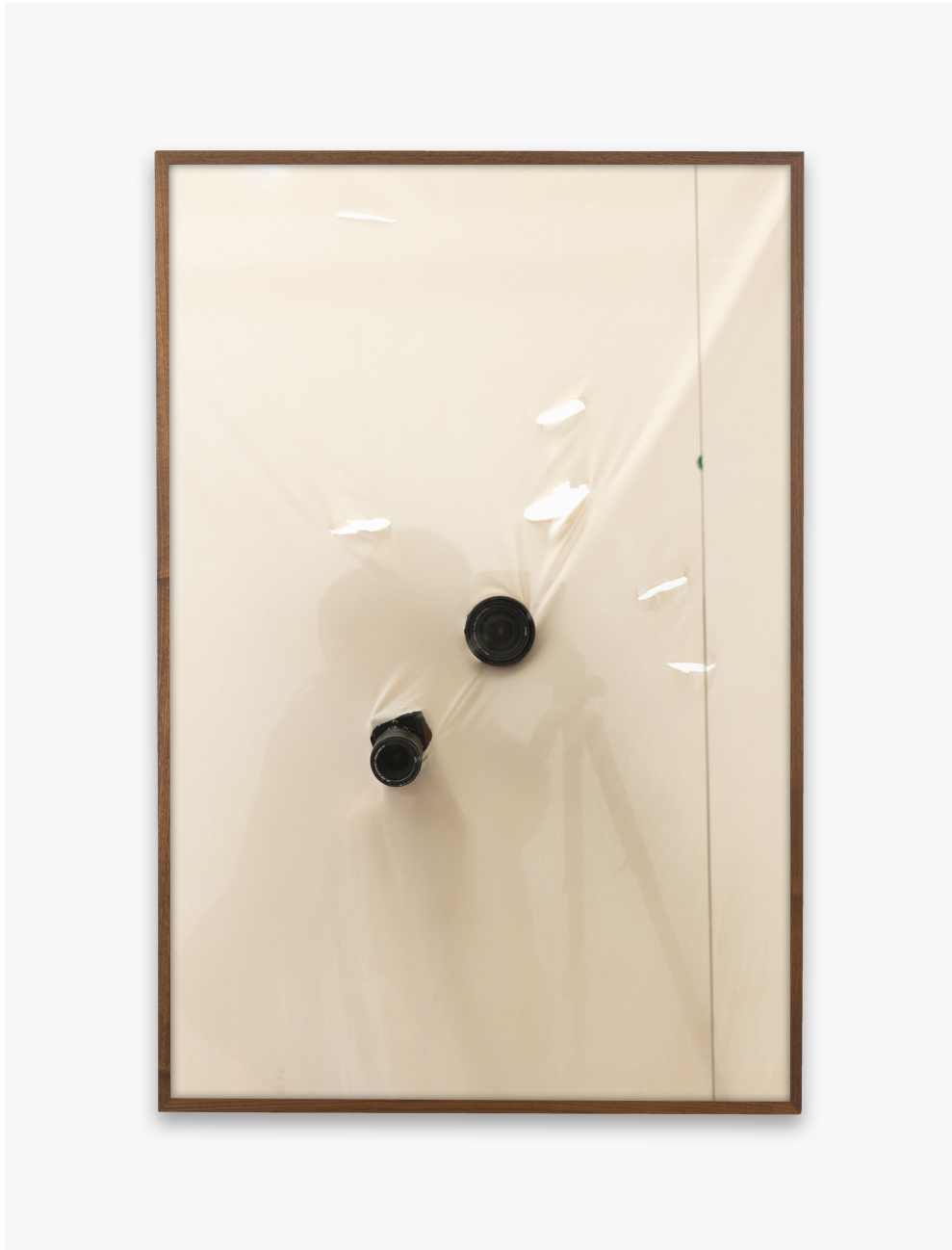
Paul Mpagi Sepuya Screen (OX5A4359) , 2019 Edition 2 of 5 Archival Pigment Print 60 x 40 in (152.4 x 101.6 cm) P.MS0001