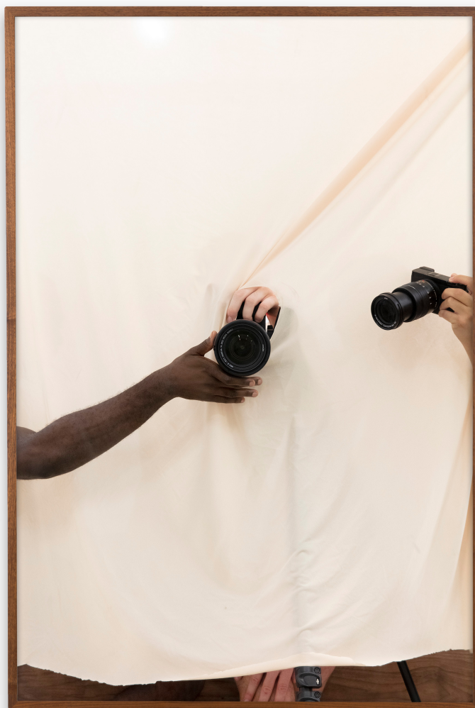
Paul Mpagi Sepuya Screen (0X5A2669), 2019 Edition 4 of 5 Archival Pigment Print 60 x 40 in (152.4 x 101.6 cm) P.MS0002