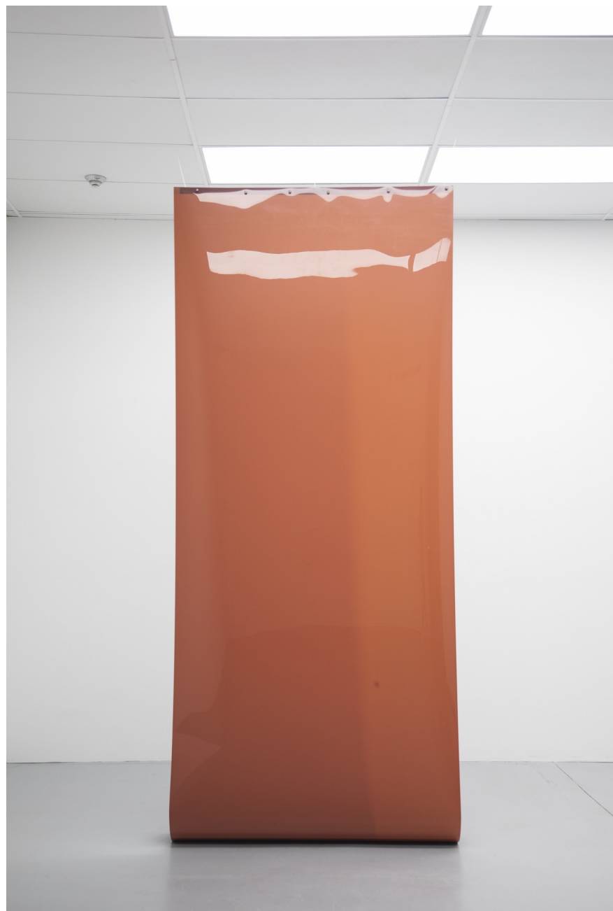
Laurie Kang Molt (Los Angeles-Toronto-), 2022 Tanned and unfixed film (continually sensitive), spherical magnets, steel Dimensions variable L.K0006