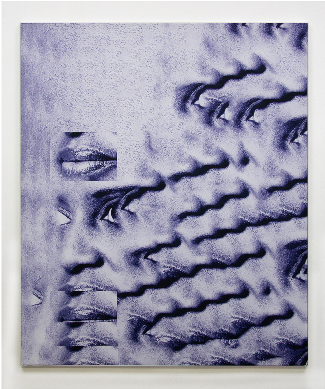
Timothy Y. Hunter Untitled (Shimmering) , 2022 Dye sublimation fabric SEG print in Non lit 17mm SEG Frame 55 x 46 x .5 in (139.7 x 116.8 x 1.3 cm) T.YH0016