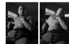
Corazón mio (Brit), 2022