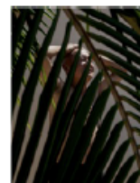
Sunday (Papá), 2022