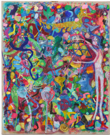
Untitled, 2022 (MB_2022_02) Oil paint, acrylic paint, chalk, crayon, ink, marker, water color on canvas 220 x 180 cm; 86.6 x 70.8 in