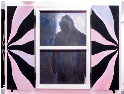
Adam Cruces Guest, 2022 Wood, paint, hardware, canvas 90 x 120 cm open; 90 x 60 cm closed