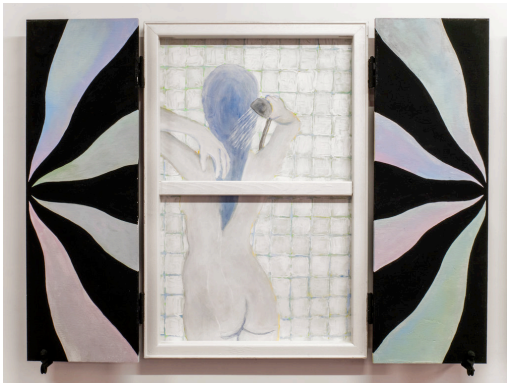
Adam Cruces Bather, 2022 Wood, paint, hardware, canvas 90 x 120 cm open; 90 x 60 cm closed

Adam Cruces – Eavesdropping 11.06 – 03.09.2022