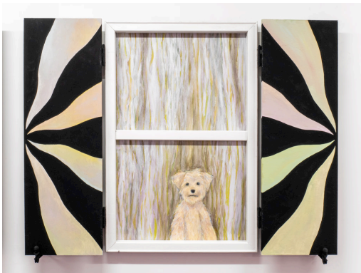
Adam Cruces Waiting, 2022 Wood, paint, hardware, canvas 90 x 120 cm open; 90 x 60 cm closed