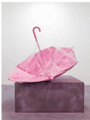
Adam Cruces Souvenir , 2022 Faux ostrich skin, umbrella parts, cobwebs 110 x 110 Ø 80 cm