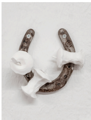
Adam Cruces Lucky to the Core(s) , 2022 Nylon 12 SLS 3D prints, horseshoe 15 x 15 x 8 cm