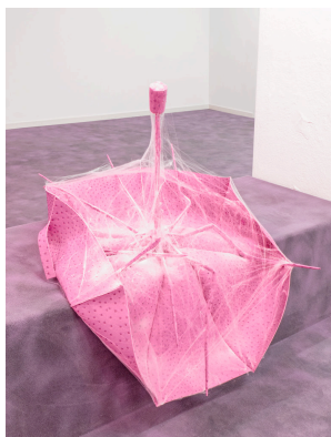
Adam Cruces Remnant , 2022 Faux ostrich skin, umbrella parts, cobwebs 100 x 90 Ø 55 cm