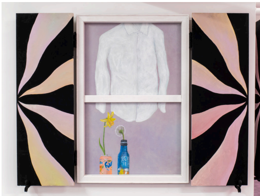
Adam Cruces Flowers and Fruits, 2022 Wood, paint, hardware, canvas 90 x 120 cm open; 90 x 60 cm closed