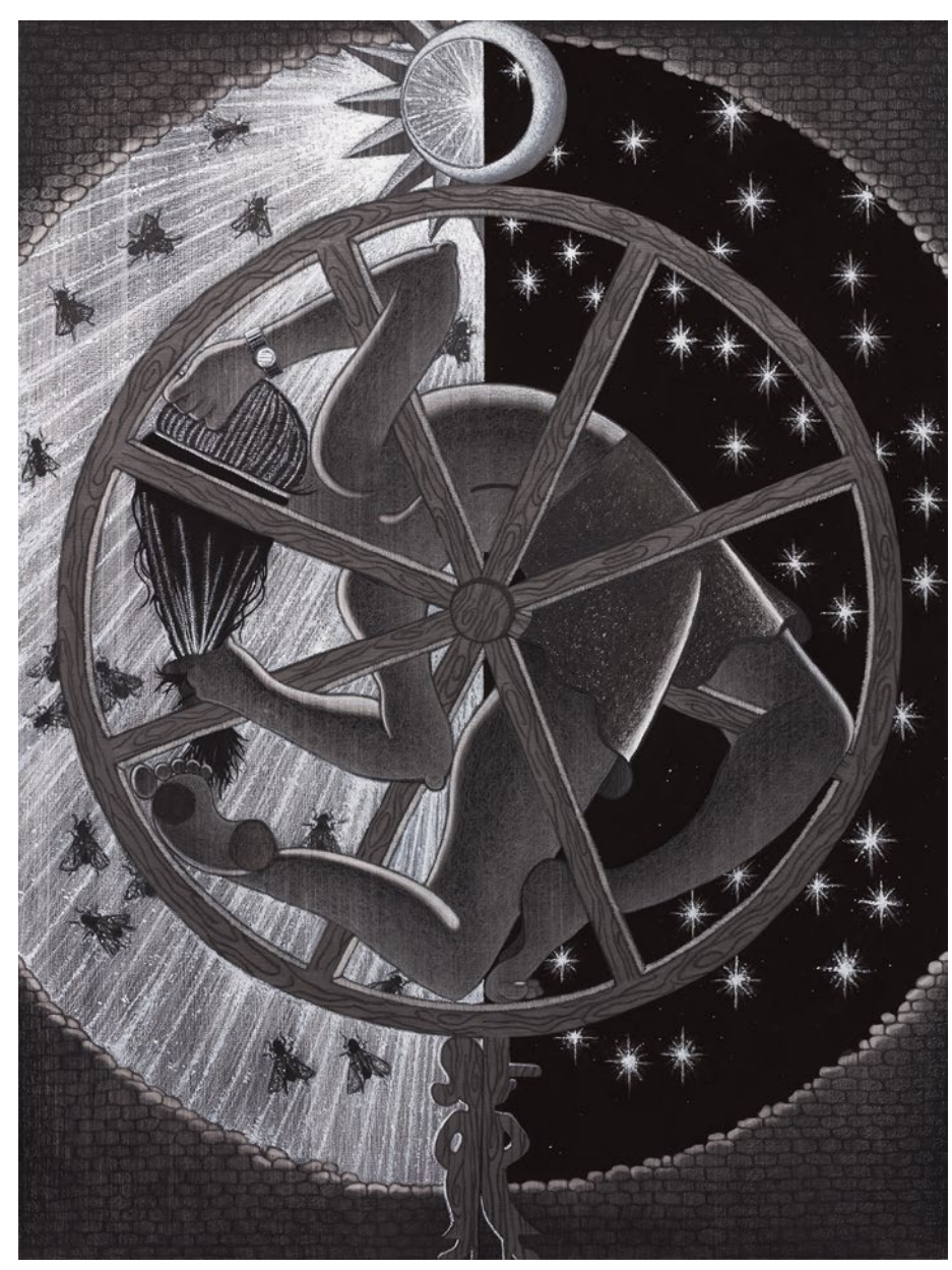
8 Hours of Slumber, Labor & Leisure, 2020 Oil, acrylic, ink, graphite, charcoal on canvas and birch 64 × 48 in. (213.3 × 162.6 cm), double sided