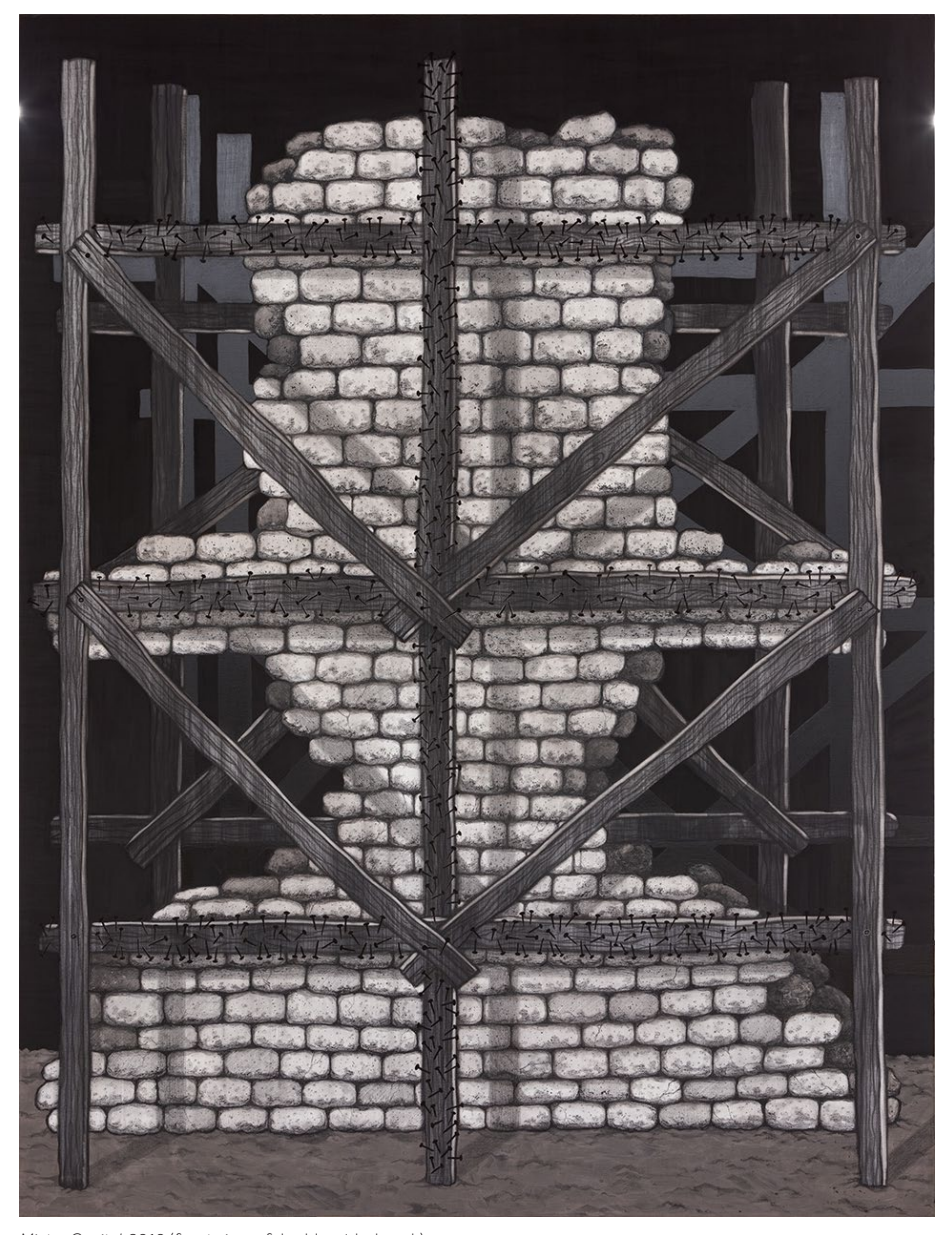
\label{eq:mister} \textit{Mister Capital, 2019 (front view of double-sided work)} \\ \text{Oil, acrylic, ink, pastel, graphite, charcoal on canvas and birch } \\ 84 \times 64 \text{ in. (213.3} \times 162.6 \text{ cm)}

source materials for additional meanings. Circles and wheels, for instance, are found throughout Kim's recent work and integrate references to illusory vision and to fate. Reign of the Idle Hands #1 (2019) [cover image] belongs to a series of round paintings informed by the phénakistoscope, an early animation disc that when rotated around a central axis gives the illusion of movement to the images drawn on its surface. In these works, Kim disables the kinetic apparatus central to its concept. Instead, the painting is stable, and bears the repeated form of Madame Farth in frustrated attempts to scale a rope—each illustration a fragment of what, if activated, would be a cohesive motion. Echoing this design on a larger canvas, Yearnings of the Flesh (2019) features a circular procession of cloaked and rope-bound schoolgirls who spookily float, ouroboros-like, within an arbor formed by a theatrical lighting rig. Found in Medieval illuminated manuscripts like the Carmina