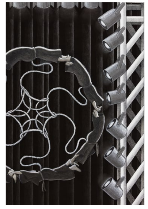
Yearnings of the Flesh, 2019 (detail) Graphite, charcoal, pastel, ink, acrylic, and oil on canvas 84 × 64 in. (213.3 × 162.6 cm)

source materials for additional meanings. Circles and wheels, for instance, are found throughout Kim's recent work and integrate references to illusory vision and to fate. Reign of the Idle Hands #1 (2019) [cover image] belongs to a series of round paintings informed by the phénakistoscope, an early animation disc that when rotated around a central axis gives the illusion of movement to the images drawn on its surface. In these works, Kim disables the kinetic apparatus central to its concept. Instead, the painting is stable, and bears the repeated form of Madame Farth in frustrated attempts to scale a rope—each illustration a fragment of what, if activated, would be a cohesive motion. Echoing this design on a larger canvas, Yearnings of the Flesh (2019) features a circular procession of cloaked and rope-bound schoolgirls who spookily float, ouroboros-like, within an arbor formed by a theatrical lighting rig. Found in Medieval illuminated manuscripts like the Carmina