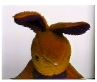
Stills from Negative Bunny