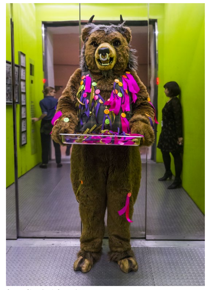
Crossing Object (Inside Gnomen), 2017 Mixed media