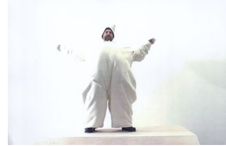
Stills from Starting Over