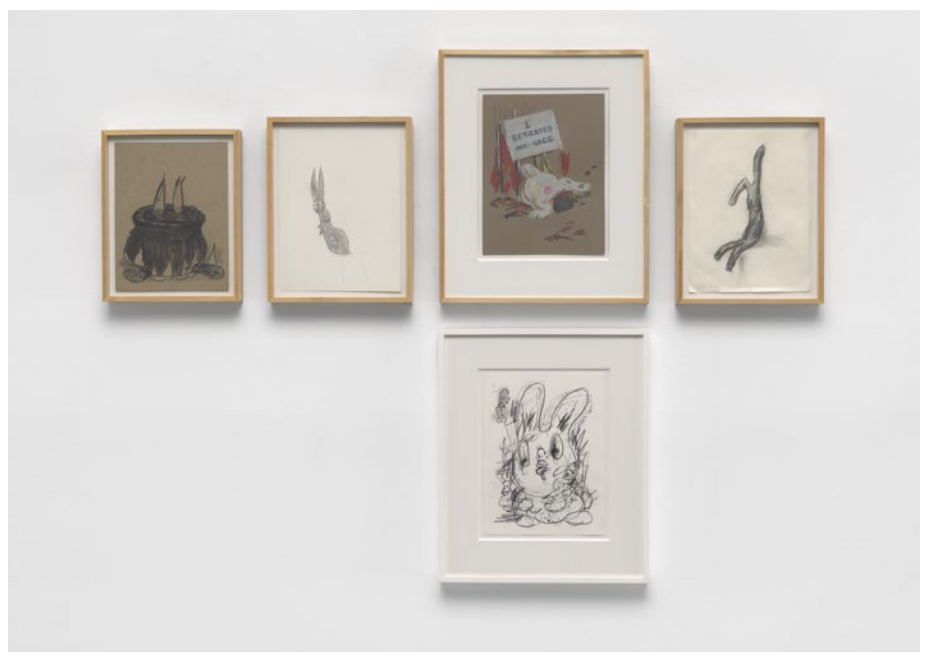
After the Turner Diaries (from the Bunny Group series), 1996–97.