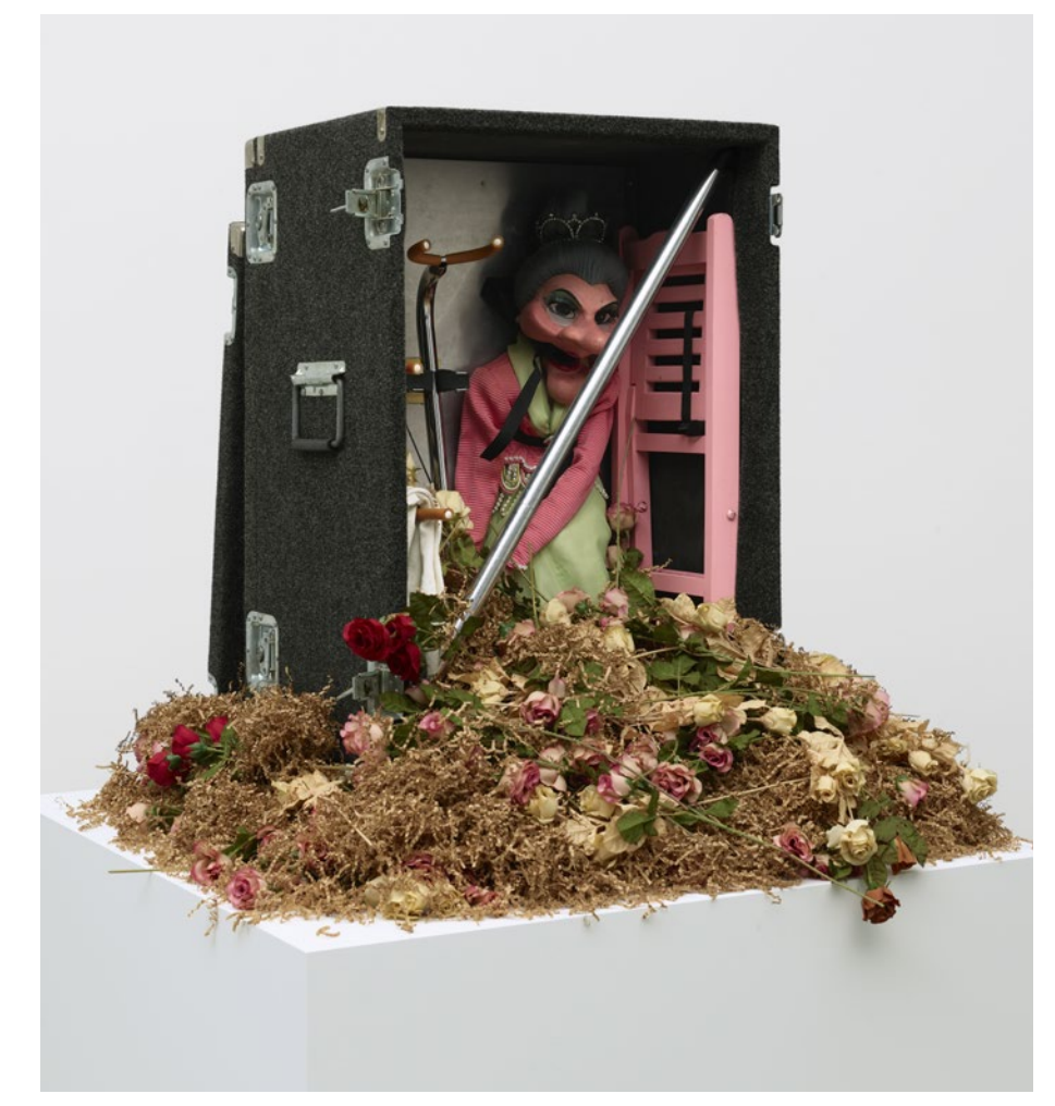
Magic, 1990.

Madame's Place. The title refers to the 1978 cult horror film Magic, in which Anthony Hopkins portrays a ventriloquist whose dummy appears to have a mind of its own. A glamorous and self-described "alcoholic sex fiend," Madame's ribald, quick-witted persona represented the decadence