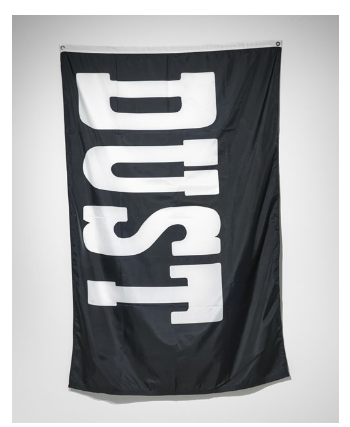
Dust, 2012.