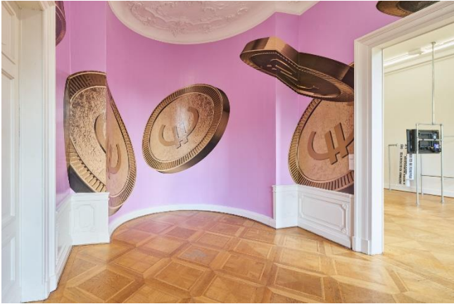
10_Eli Cortiñas_The Body is The House, The House is But Haunted

Eli Cortiñas, In Order For People to Feel It. That's Called „Soul“ , 2022, Installation View at Kunstverein Braunschweig 2022