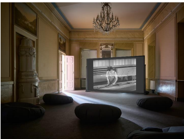
23_Eli Cortiñas_The Body is The House, The House is But Haunted_photo_Joe Clark

Eli Cortiñas, Walls Have Feelings , 2019, Installation View at Kunstverein Braunschweig 2022, Courtesy: the artist and Kunstverein Braunschweig, photo: Joe Clark