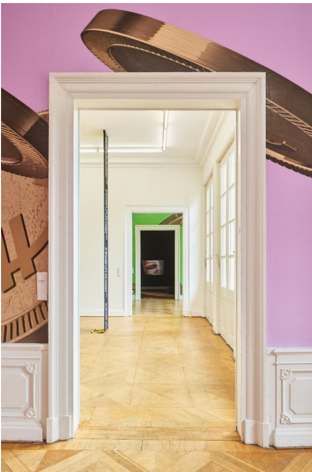
11_Eli Cortiñas_The Body is The House, The House is But Haunted

Eli Cortiñas, In Order For People to Feel It. That's Called „Soul“ , 2022, Installation View at Kunstverein Braunschweig 2022