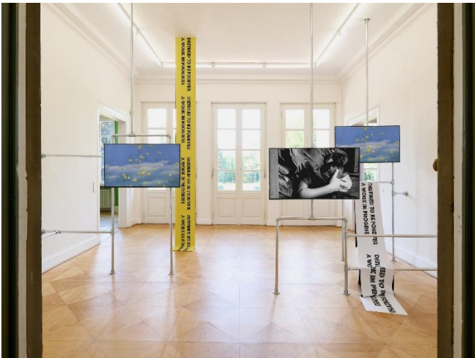
02_Eli Cortiñas_The Body is The House, The House is But Haunted_photo_Joe Clark

Eli Cortiñas, I've Always Demanded More From The Sunset , 2022, Installation View at Kunstverein Braunschweig 2022, Courtesy: the artist and Kunstverein Braunschweig, photo: Joe Clark