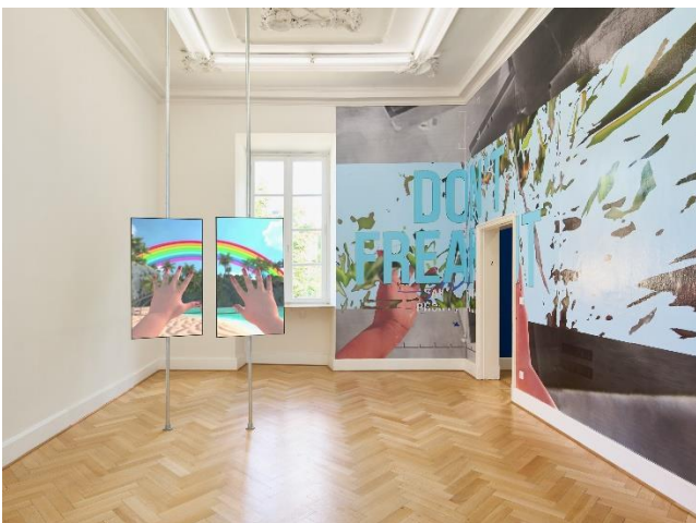
28_Eli Cortiñas_The Body is The House, The House is But Haunted

Eli Cortiñas, The Body is The House, The House is But Haunted , 2022, Installation View at Kunstverein Braunschweig 2022