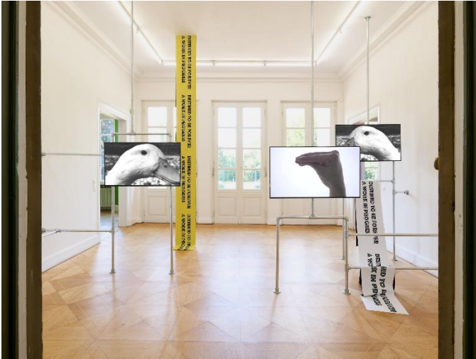
01_Eli Cortiñas_The Body is The House, The House is But Haunted_photo_Joe Clark

Eli Cortiñas, I've Always Demanded More From The Sunset , 2022, Installation View at Kunstverein Braunschweig 2022, Courtesy: the artist and Kunstverein Braunschweig, photo: Joe Clark