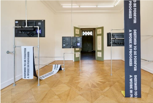
07_Eli Cortiñas_The Body is The House, The House is But Haunted_photo_Joe Clark

Eli Cortiñas, I've Always Demanded More From The Sunset , 2022, Installation View at Kunstverein Braunschweig 2022, Courtesy: the artist and Kunstverein Braunschweig, photo: Joe Clark