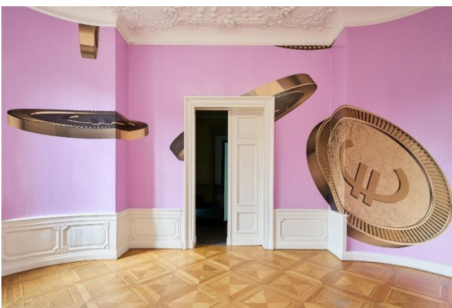
09_Eli Cortiñas_The Body is The House, The House is But Haunted_photo_Joe Clark

Eli Cortiñas, I've Always Demanded More From The Sunset , 2022, Installation View at Kunstverein Braunschweig 2022, Courtesy: the artist and Kunstverein Braunschweig, photo: Joe Clark