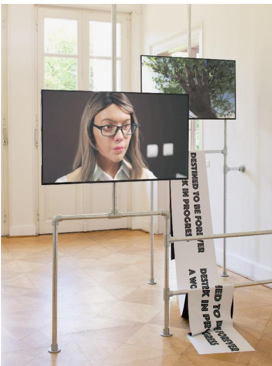
08_Eli Cortiñas_The Body is The House, The House is But Haunted

Eli Cortiñas, I've Always Demanded More From The Sunset , 2022, Installation View at Kunstverein Braunschweig 2022