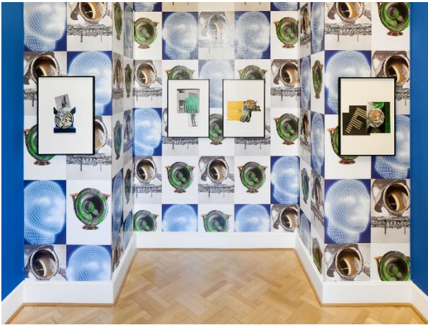
24_Eli Cortiñas_The Body is The House, The House is But Haunted

Eli Cortiñas, The Body is The House, The House is But Haunted , 2022, Installation View at Kunstverein Braunschweig 2022