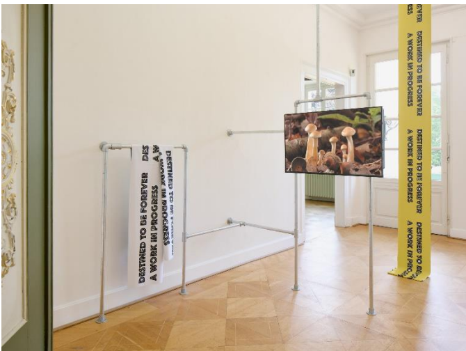
03_Eli Cortiñas_The Body is The House, The House is But Haunted_photo_Joe Clark

Eli Cortiñas, I've Always Demanded More From The Sunset , 2022, Installation View at Kunstverein Braunschweig 2022, Courtesy: the artist and Kunstverein Braunschweig, photo: Joe Clark