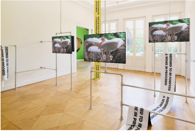
04_Eli Cortiñas_The Body is The House, The House is But Haunted_photo_Joe Clark

Eli Cortiñas, I've Always Demanded More From The Sunset , 2022, Installation View at Kunstverein Braunschweig 2022, Courtesy: the artist and Kunstverein Braunschweig, photo: Joe Clark