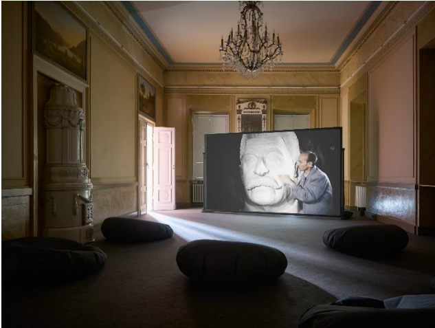
21_Eli Cortiñas_The Body is The House, The House is But Haunted_photo_Joe Clark

Eli Cortiñas, Walls Have Feelings , 2019, Installation View at Kunstverein Braunschweig 2022, Courtesy: the artist and Kunstverein Braunschweig, photo: Joe Clark