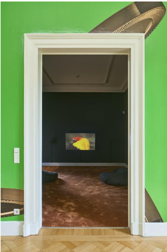
13_Eli Cortiñas_The Body is The House, The House is But Haunted_photo_Joe Clark

Eli Cortiñas, Not Gone With The Wind , 2020, Installation View at Kunstverein Braunschweig 2022, Courtesy: the artist and Kunstverein Braunschweig, photo: Joe Clark