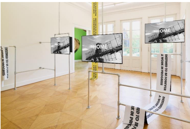
05_Eli Cortiñas_The Body is The House, The House is But Haunted_photo_Joe Clark

Eli Cortiñas, I've Always Demanded More From The Sunset , 2022, Installation View at Kunstverein Braunschweig 2022, Courtesy: the artist and Kunstverein Braunschweig, photo: Joe Clark