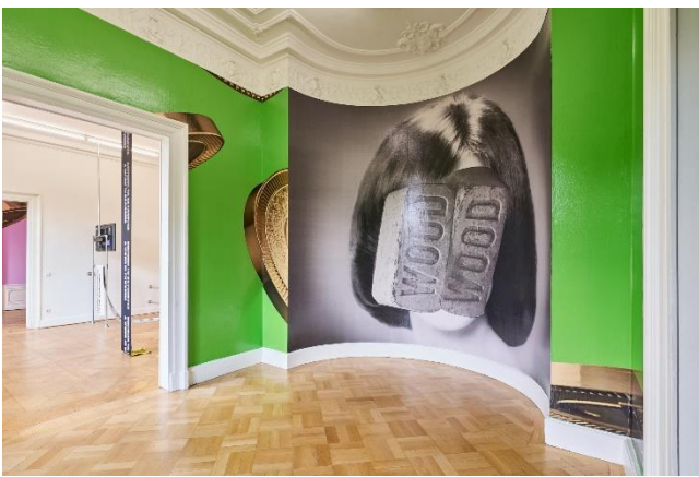
17_Eli Cortiñas_The Body is The House, The House is But Haunted_photo_Joe Clark

Eli Cortiñas, Your Bitcoin Will Not Save You , 2022, Installation View at Kunstverein Braunschweig 2022, Courtesy: the artist and Kunstverein Braunschweig, photo: Joe Clark