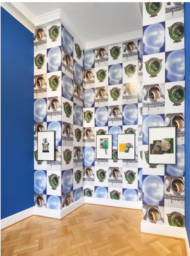
25_Eli Cortiñas_The Body is The House, The House is But Haunted_photo_Joe Clark

Eli Cortiñas, The Body is The House, The House is But Haunted , 2022, Installation View at Kunstverein Braunschweig 2022, Courtesy: the artist and Kunstverein Braunschweig, photo: Joe Clark