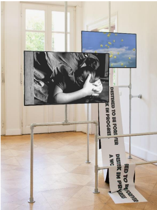
06_Eli Cortiñas_The Body is The House, The House is But Haunted

Eli Cortiñas, I've Always Demanded More From The Sunset , 2022, Installation View at Kunstverein Braunschweig 2022