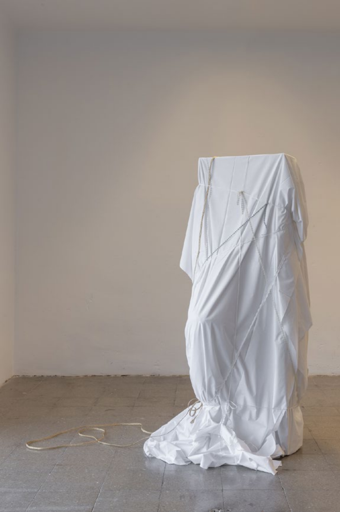
Cristina Spinelli, secreto azul (nosotras con tus geranios) (2022)