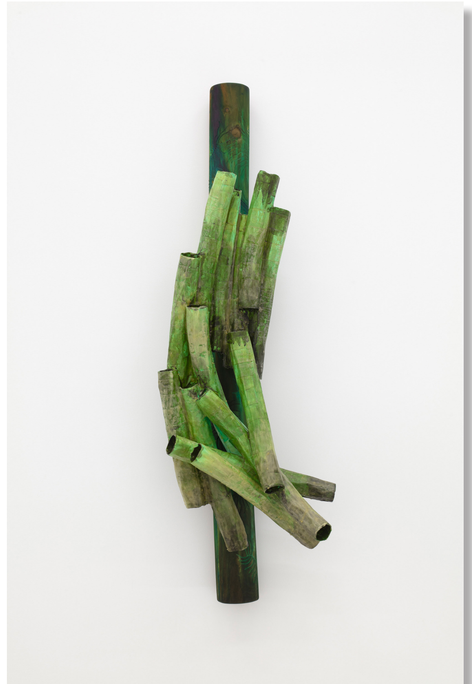
Aleph Escobedo Xilófaga 13 , 2022 Pinewood, papier-mâché, beeswax, ink and watercolor. 130 x 45 x 32 cm (51.1 x 17.7 x 12.5 in) Unique