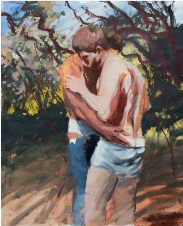
Untitled, 2022, oil on canvas, 200 x 160 cm

OPENING AND SUMMER PARTY: Friday, 01 July 2022, 7 PM