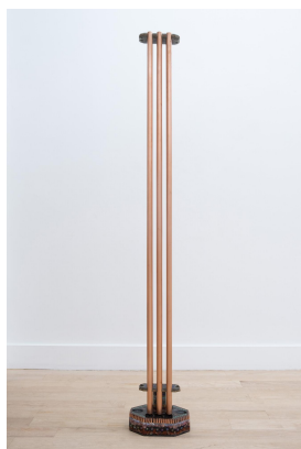
Clare Koury Cloudbuster 2 , 2022 Copper pipes, organite (resin-bonded crystal and metal shavings) 62.5 x 9.5 x 6 inches