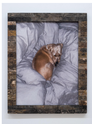
Clare Koury Companion for the End of the World , 2022 Framed inkjet print on matte paper 19 x 15 inches Edition of 3