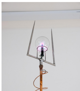
Rachel Rosheger Stop Funking with Our Frequencies, 2022 Plasma ball, copper, steel, 19th century lightning rod stand, power supply 95.5 x 24 x 24 inches