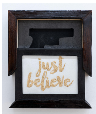
Clare Koury Just Believe , 2022 Diversion safe picture frame, straw on paper 10 x 11 x 3.5 inches