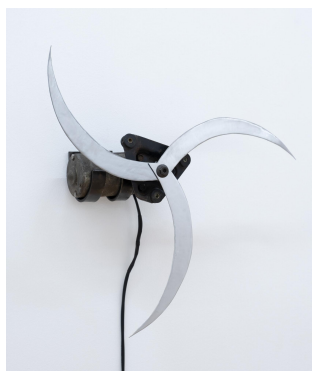
Rachel Rosheger Ford , 2022 Steel, windshield wiper motor, power supply 19 x 19 x 4.5 inches