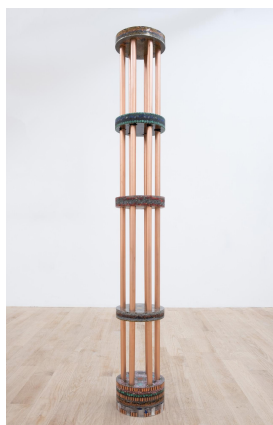
Clare Koury Cloudbuster 1 , 2022 Copper pipes, orgonite (resin-bonded crystal and metal shavings) 60 x 8 x 8 inches