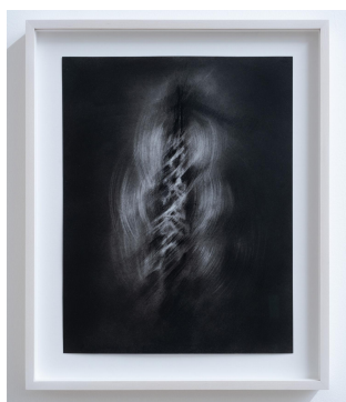
Rachel Rosheger EMP03 , 2022 Charcoal on paper 15 x 12 1/8 inches framed