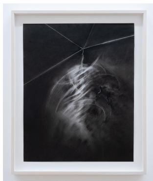
Rachel Rosheger EMP01, 2022 Charcoal on paper 16 x 13 inches 18 13/16 x 15 3/8 inches framed