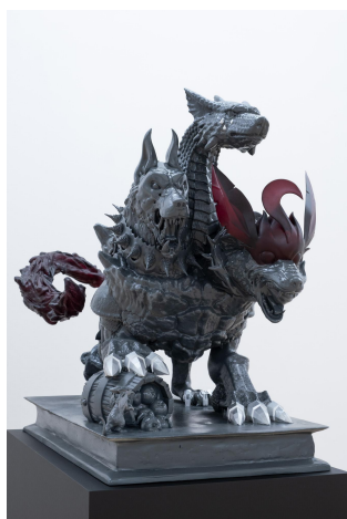
Genevieve Goffman The Dog, 2022 Resin, paint 35 x 18 x 28 inches