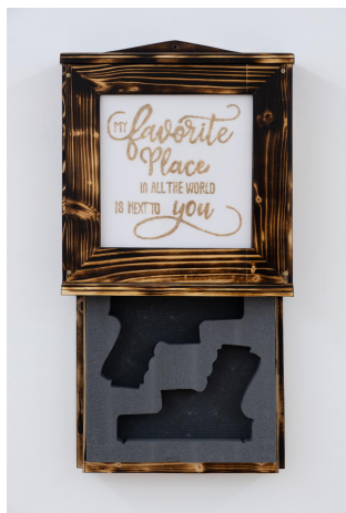
Clare Koury My Favorite Place in the Entire World is Next to You , 2022 Diversion safe picture frame, straw on paper 14.5 x 27 x 4 inches