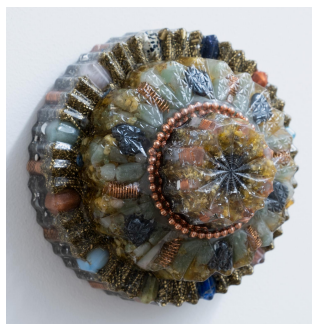
Clare Koury Untitled , 2022 Orgonite (resin-bonded crystal and metal shavings) 6 x 6 x 4 inches