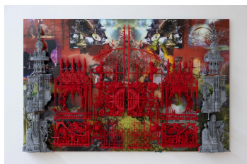
Genevieve Goffman The Gate , 2022 InkJet print, Diasec, PLA, nylon, paint 57 x 37 inches