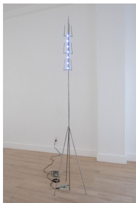
Rachel Rosheger Storm Light , 2022 Steel, LEDs, microcontroller, barometric pressure sensor, power supply 91 x 17 x 19 inches