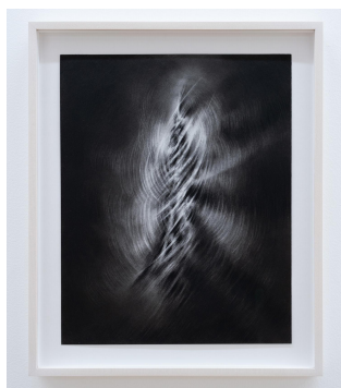
Rachel Rosheger EMP02, 2022 Charcoal on paper 13.5 x 11 inches 16 5/16 x 13 3/8 inches framed