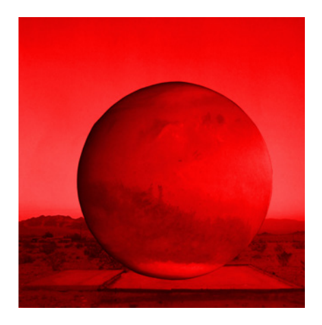
Mars, 2014-15 Archival pigment print 47.5 × 47.5 inches