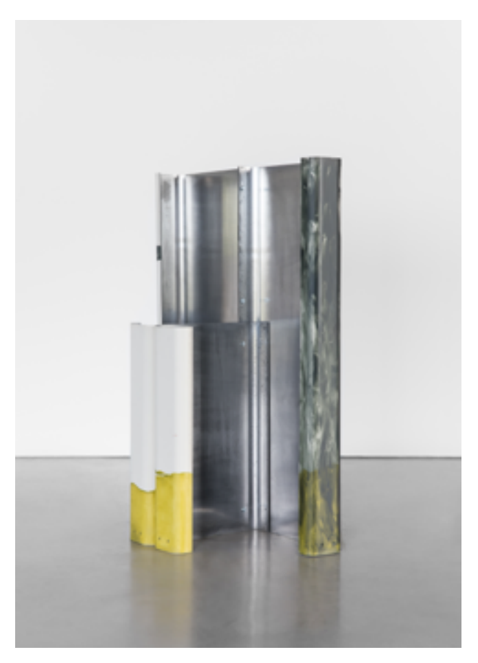
Charlotte vander Borght MASS II, 2020 Painted aluminium, metal 169.5 × 119 × 55 cm