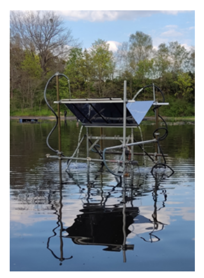
Ana Alenso Oil Intervention # 7 , 2019 Scaffolding parts, hoses, steel, nickel, diesel nozzle and glass water bottle Variable Dimensions