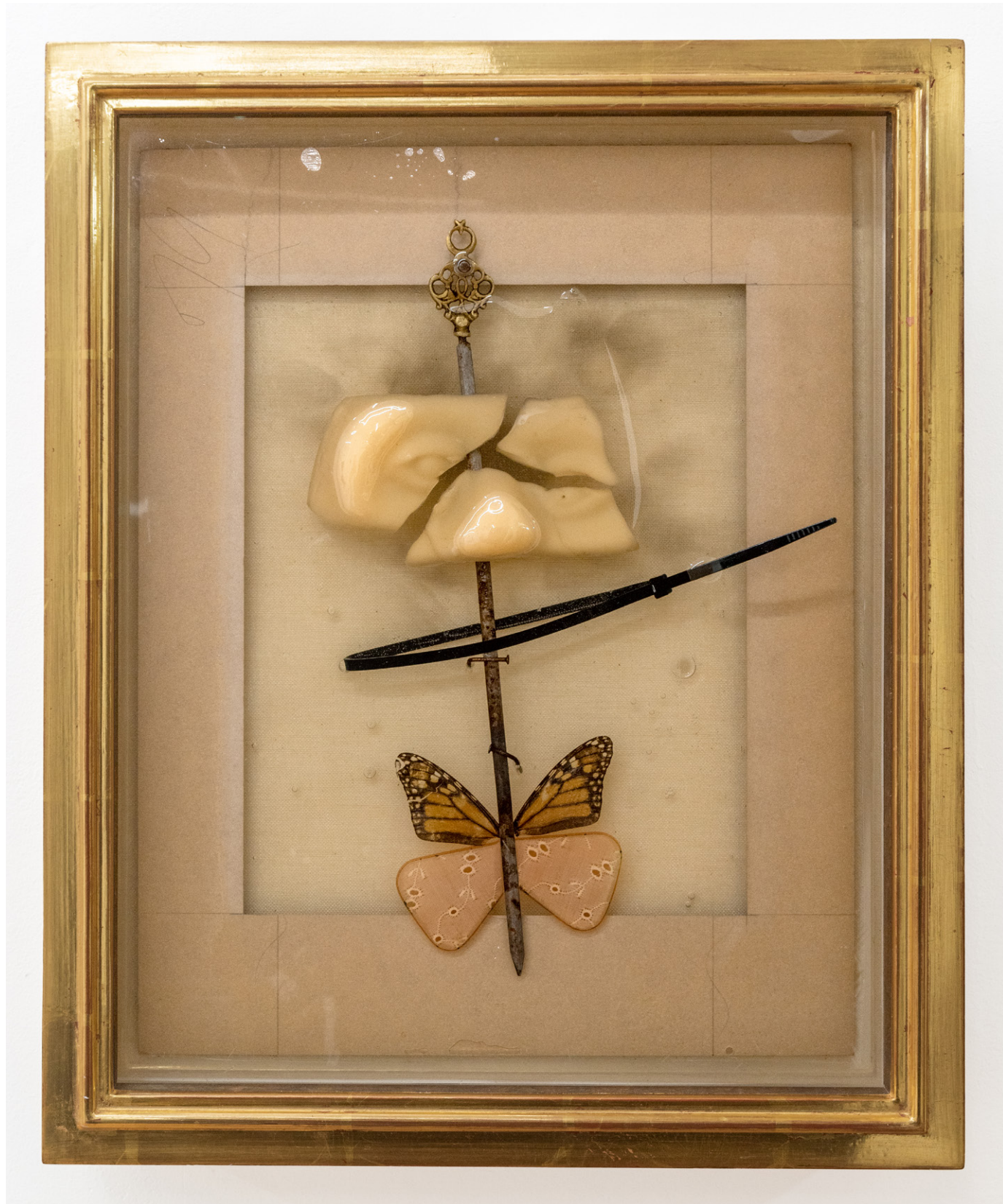
Henry Belden Dramaturge , 2022 Framed collage 16 1/2 x 13 x 2 1/2 in