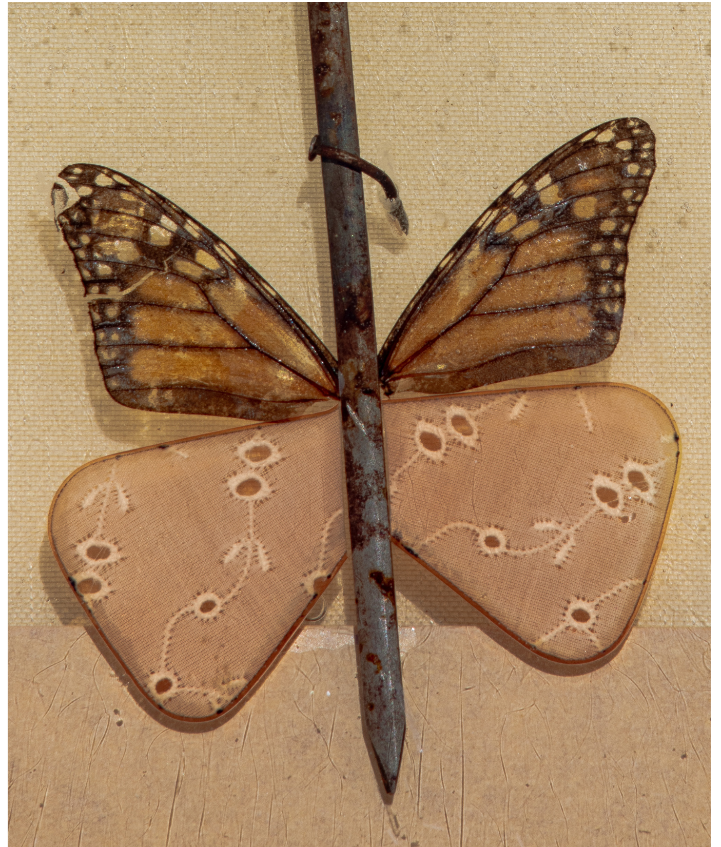
Henry Belden Dramaturge (detail), 2022 Framed collage 16 1/2 x 13 x 2 1/2 in