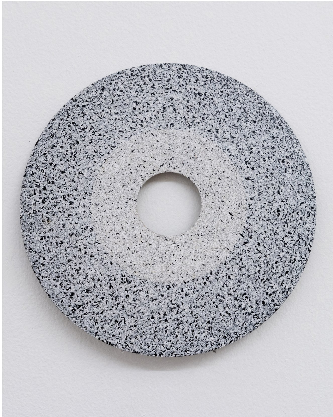
Doris Guo Without title , 2022 lacquer paint, PVC 7" ø