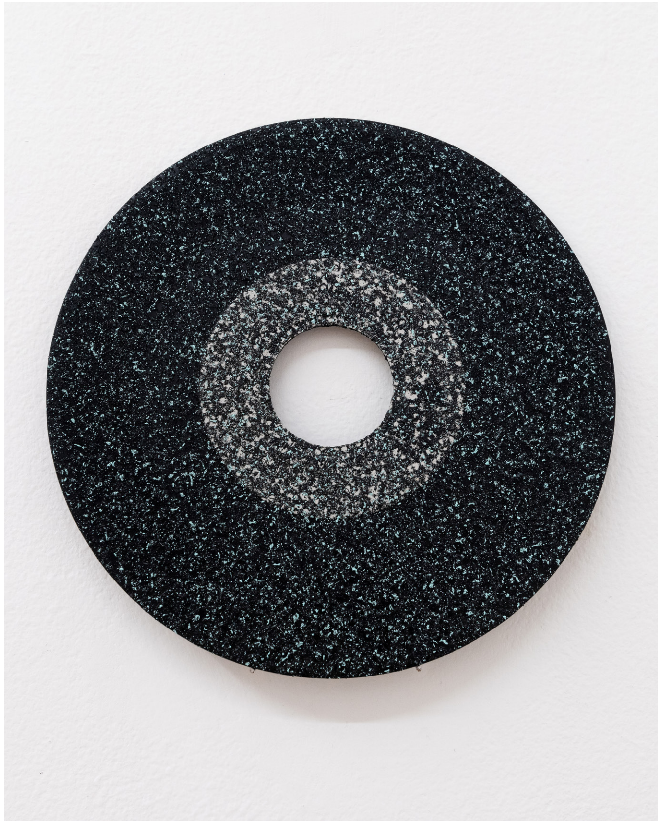
Doris Guo Without title , 2022 lacquer paint, PVC 7" ø