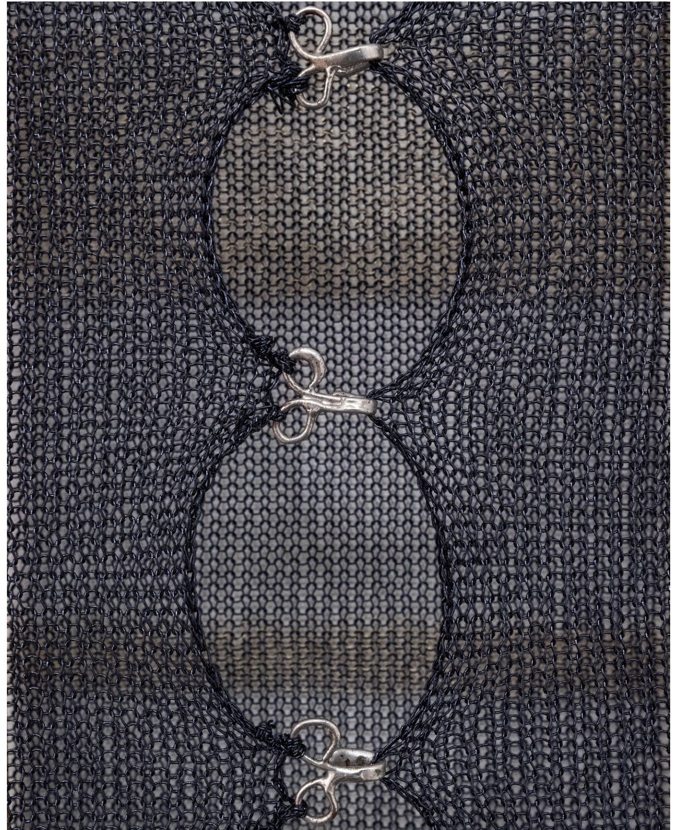
Covey Gong Untitled (detail), 2022 Bronze, brass, tin, polyester 11 1/4 x 5 7/8 x 2 in