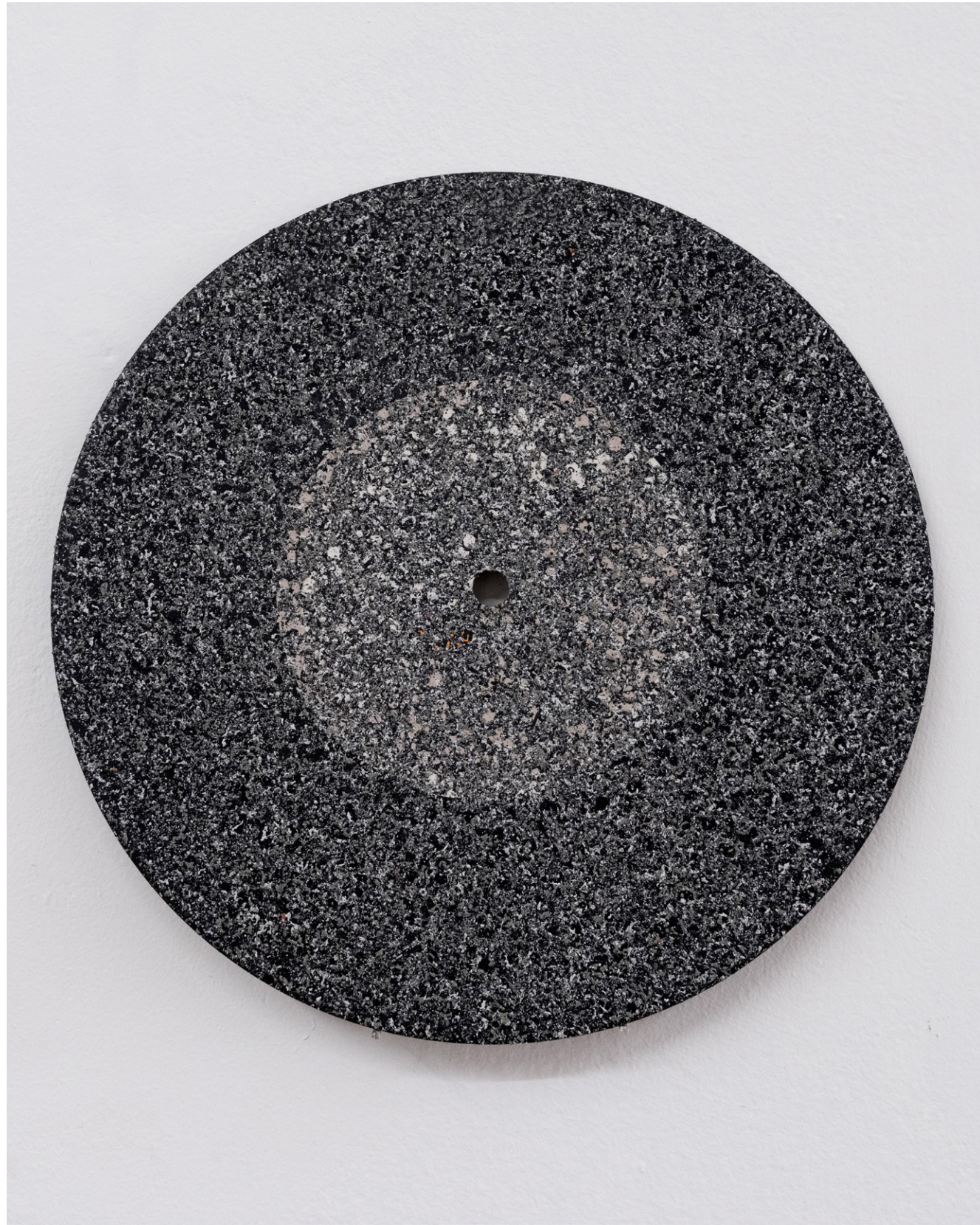
Doris Guo Without title , 2022 lacquer paint, PVC 7" ø