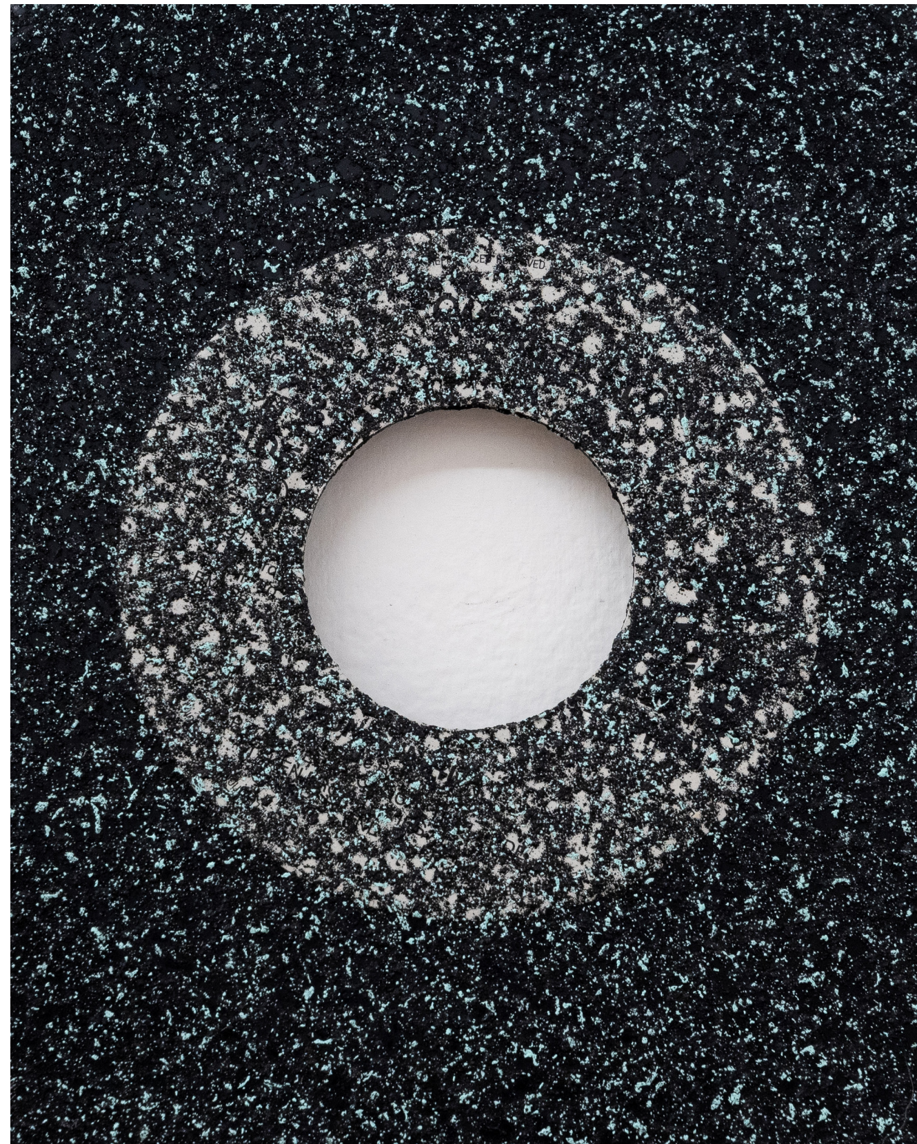
Doris Guo Without title (detail) , 2022 lacquer paint, PVC 7" ø