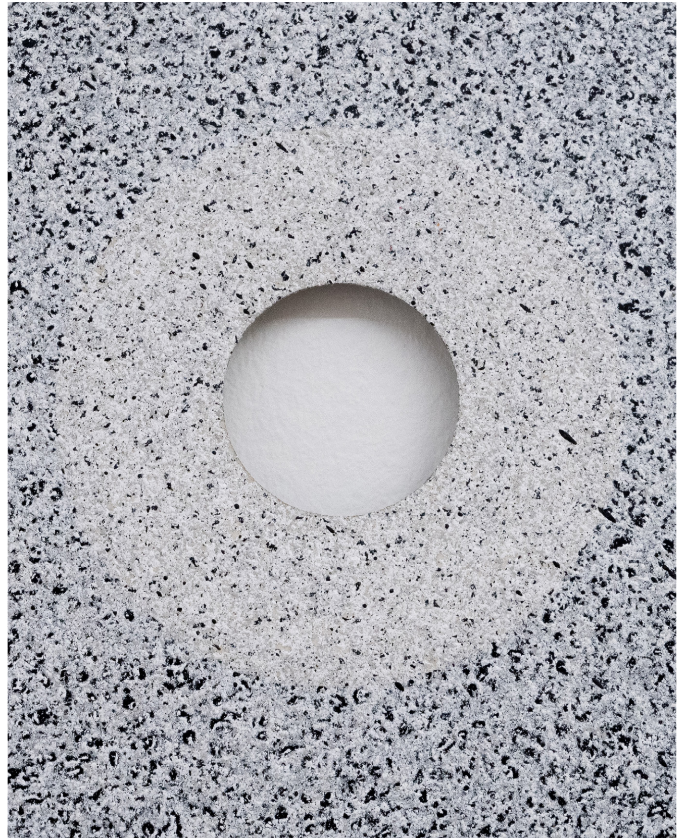
Doris Guo Without title (detail) , 2022 lacquer paint, PVC 7" ø