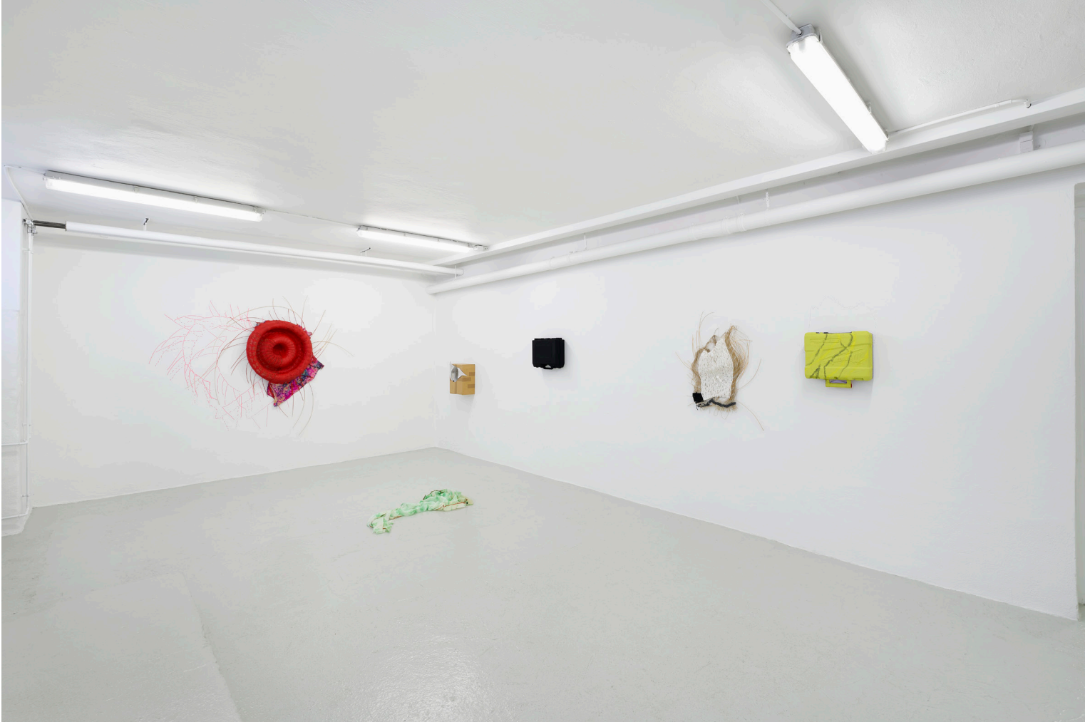
Anne-Mette Schultz. Feria . 2022. (Installation view)