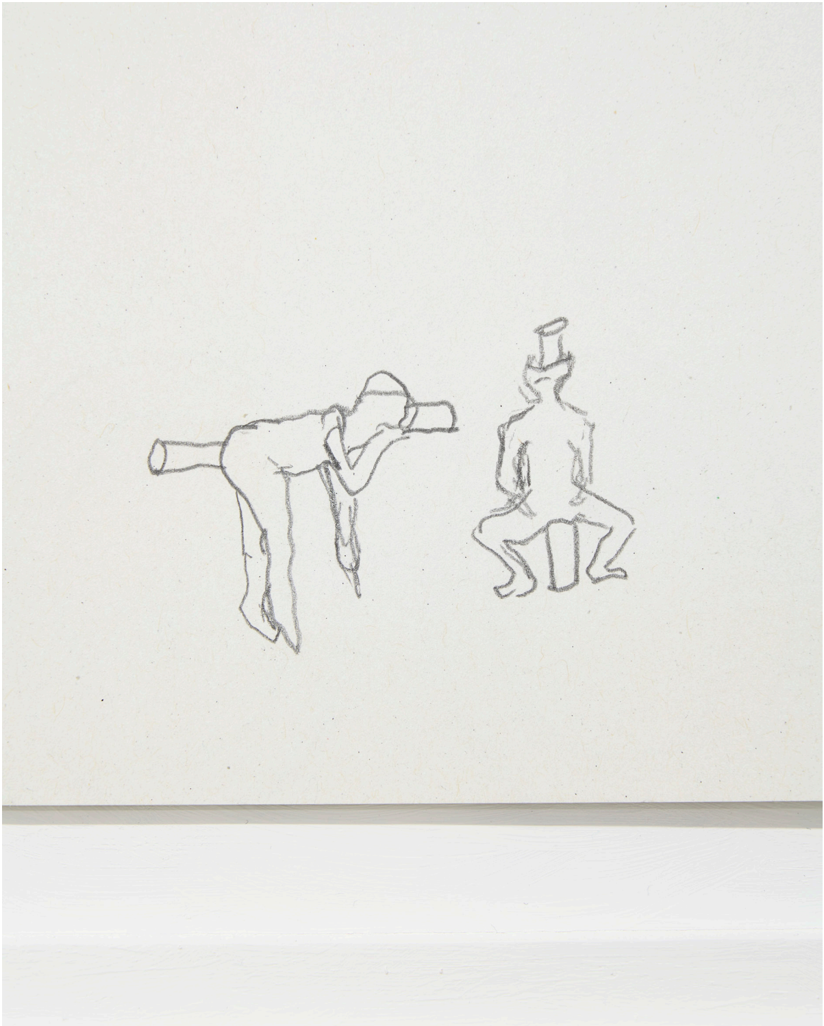
Anne-Mette Schultz. Untitled , 2017. (Detail)