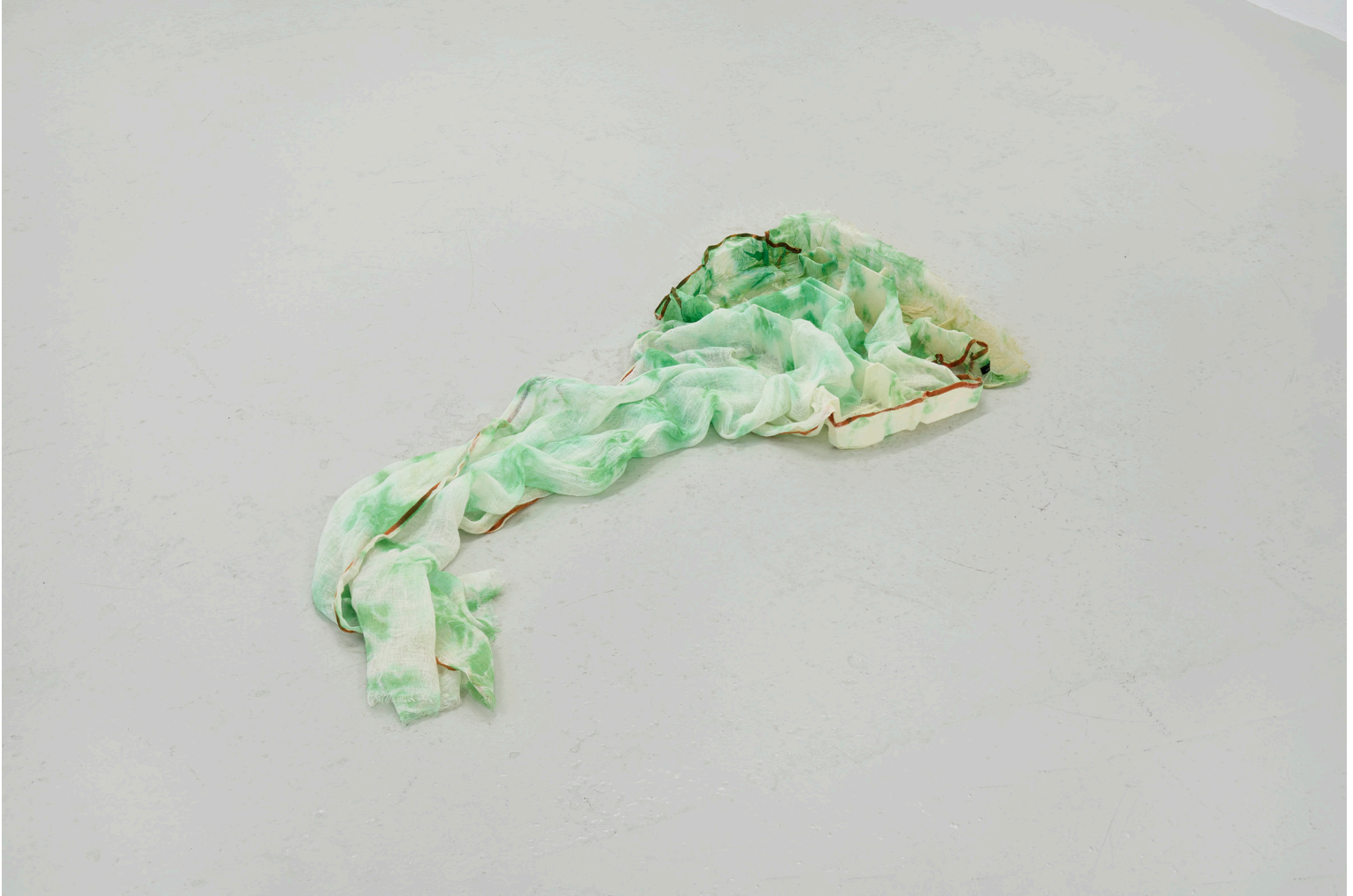
Anne-Mette Schultz. Textitecture , 2019. Fabric, glue. 95 × 45 × 8 cm