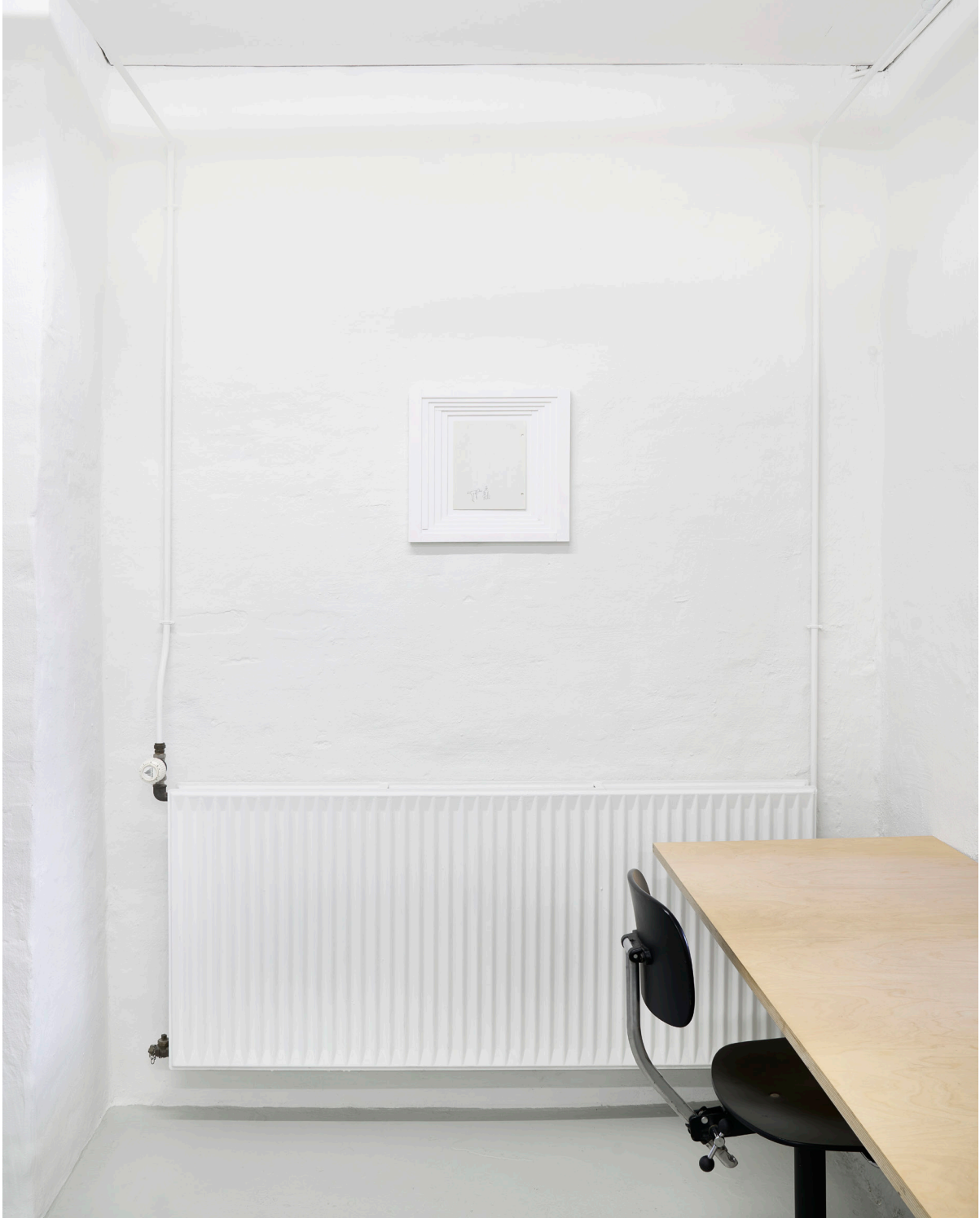
Anne-Mette Schultz. Feria . 2022. (Installation view)