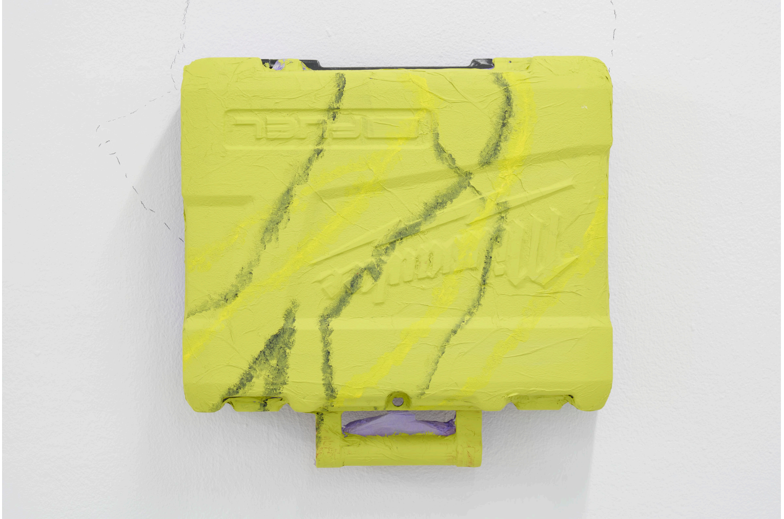
Anne-Mette Schultz. Untitled , 2021. Power tool case, silk paper, paint. 35 × 37 × 11,5 cm