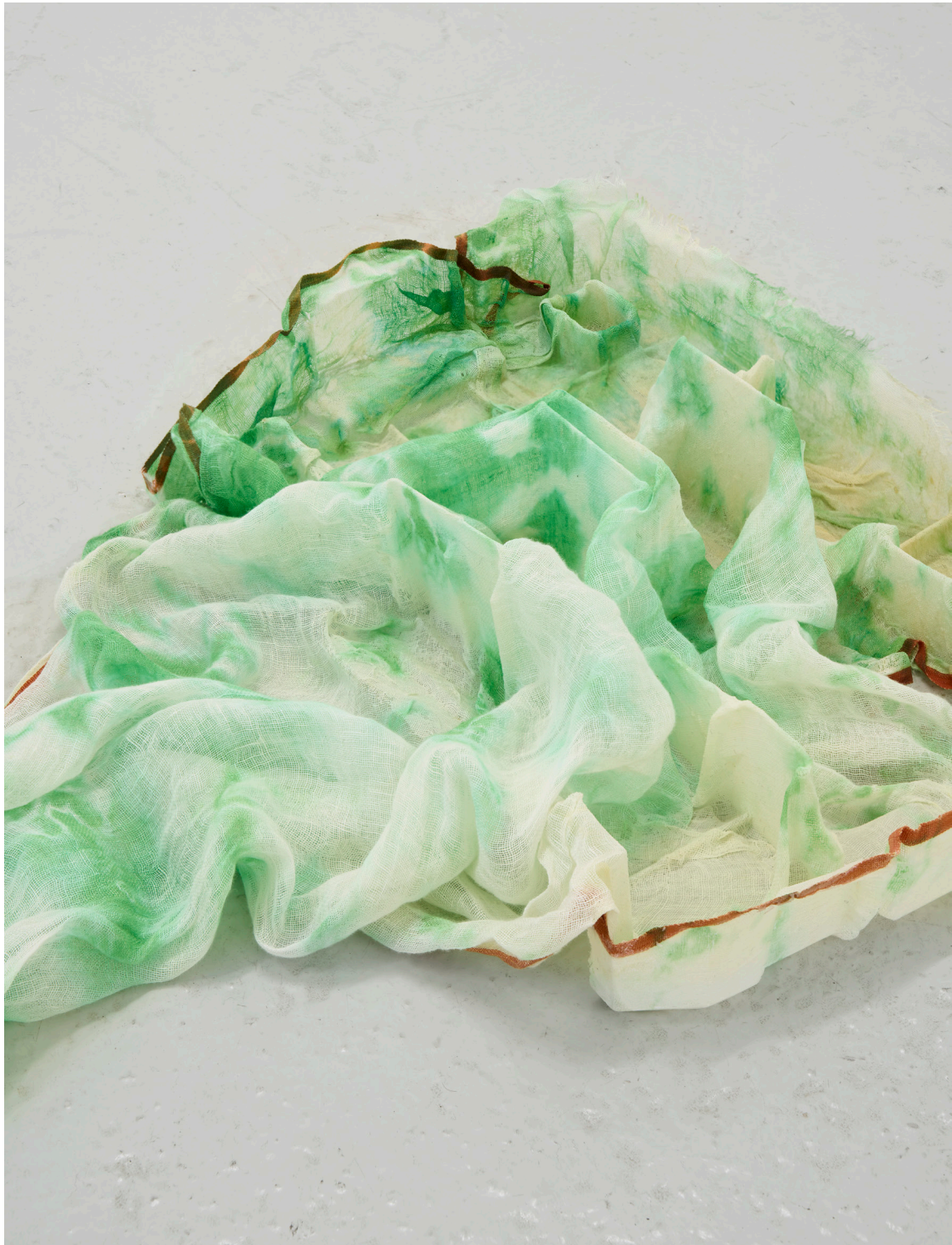
Anne-Mette Schultz. Textitecture , 2019. (Detail)