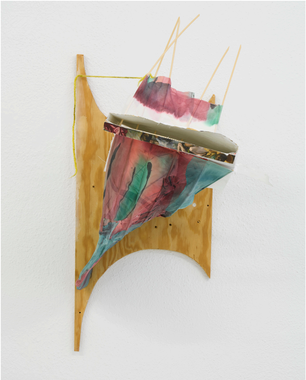
Anne-Mette Schultz. Rejsebrille , 2020. Rattan, wood, silk, newspaper, print. 57 × 43 × 45 cm