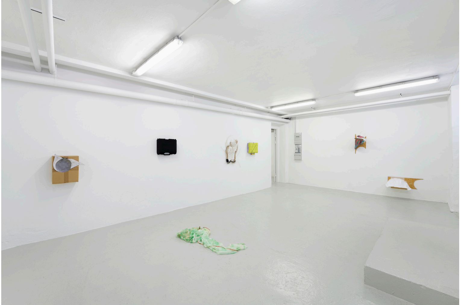
Anne-Mette Schultz. Feria . 2022. (Installation view)