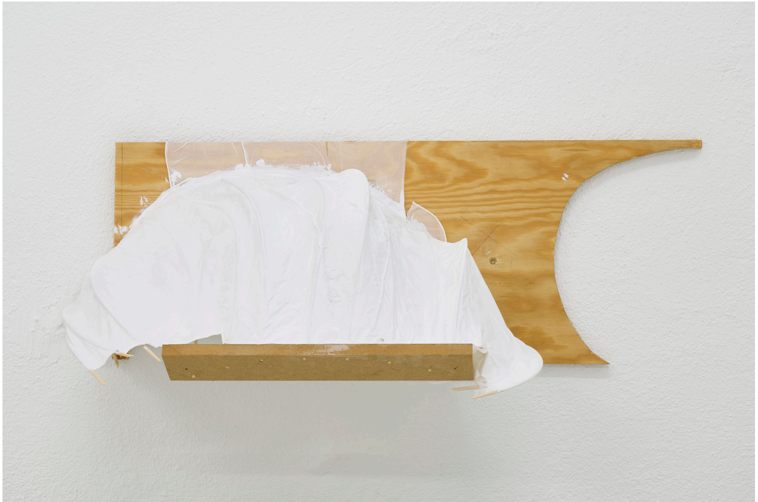
Anne-Mette Schultz. Skærm , 2020. Rattan, wood, fabric, paint. 26 × 73 × 42 cm