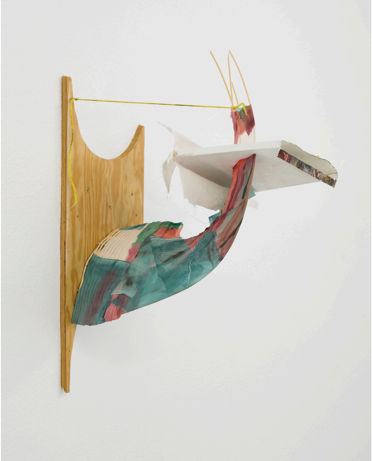
Anne-Mette Schultz. Rejsebrille , 2020. Rattan, wood, silk, newspaper, print. 57 × 43 × 45 cm