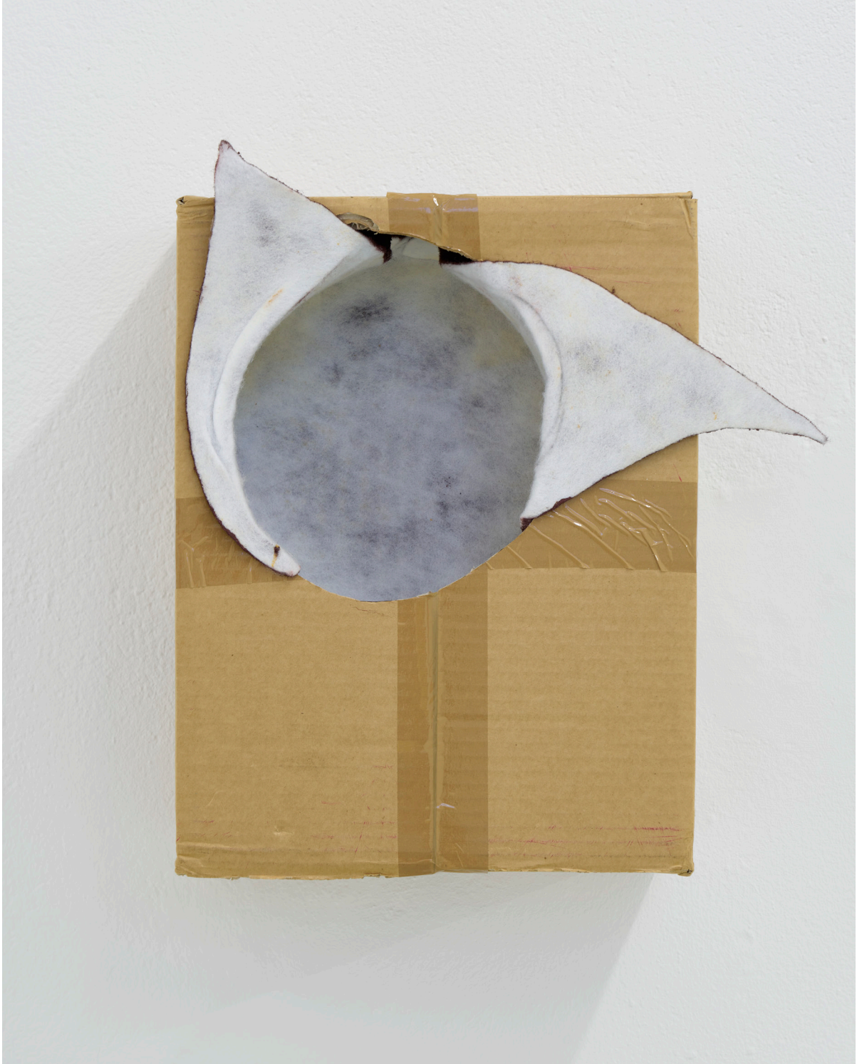
Anne-Mette Schultz. Hul , 2020. Cardboard box, hat shape. 40 × 36,5 × 20 cm