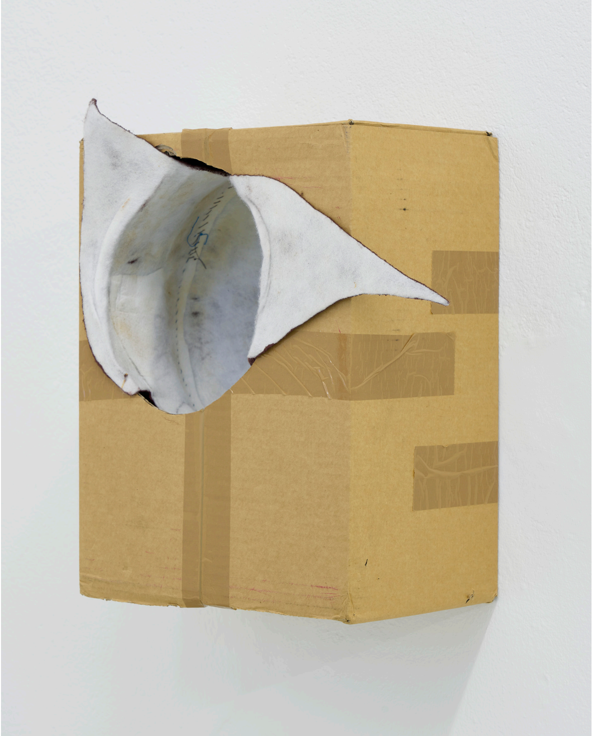
Anne-Mette Schultz. Hul , 2020. Cardboard box, hat shape. 40 × 36,5 × 20 cm