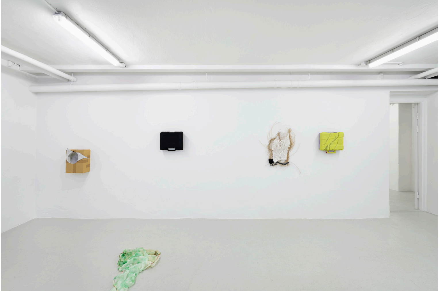
Anne-Mette Schultz. Feria . 2022. (Installation view)