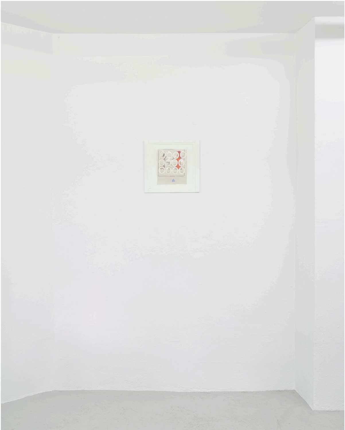
Anne-Mette Schultz. Feria . 2022. (Installation view)