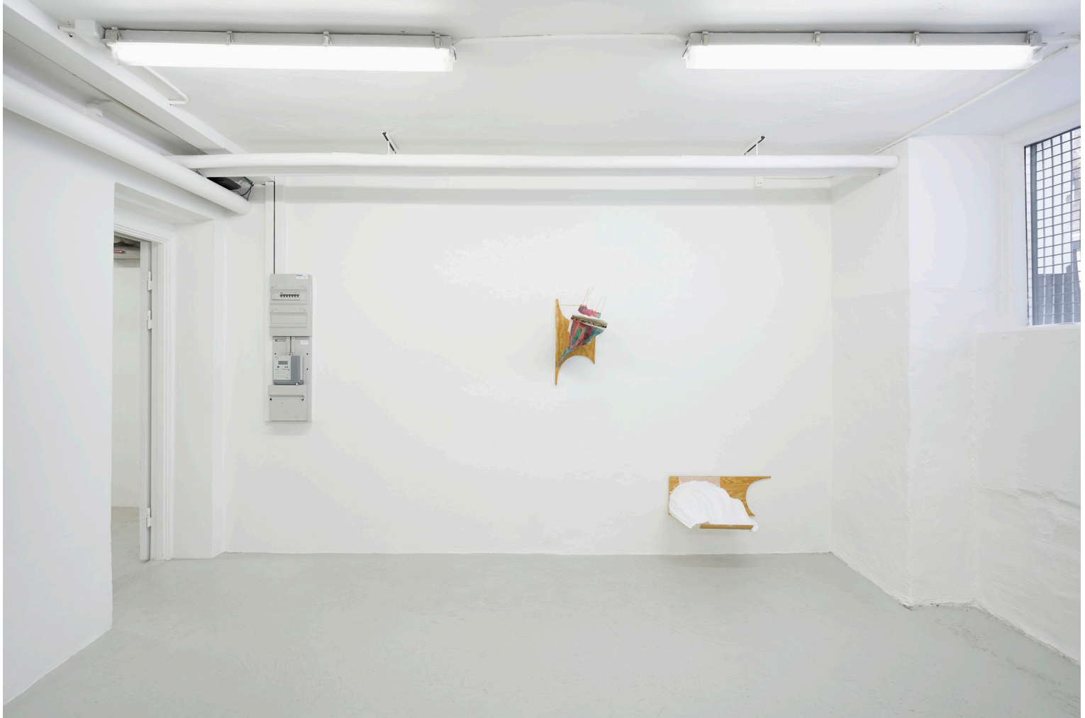
Anne-Mette Schultz. Feria . 2022. (Installation view)