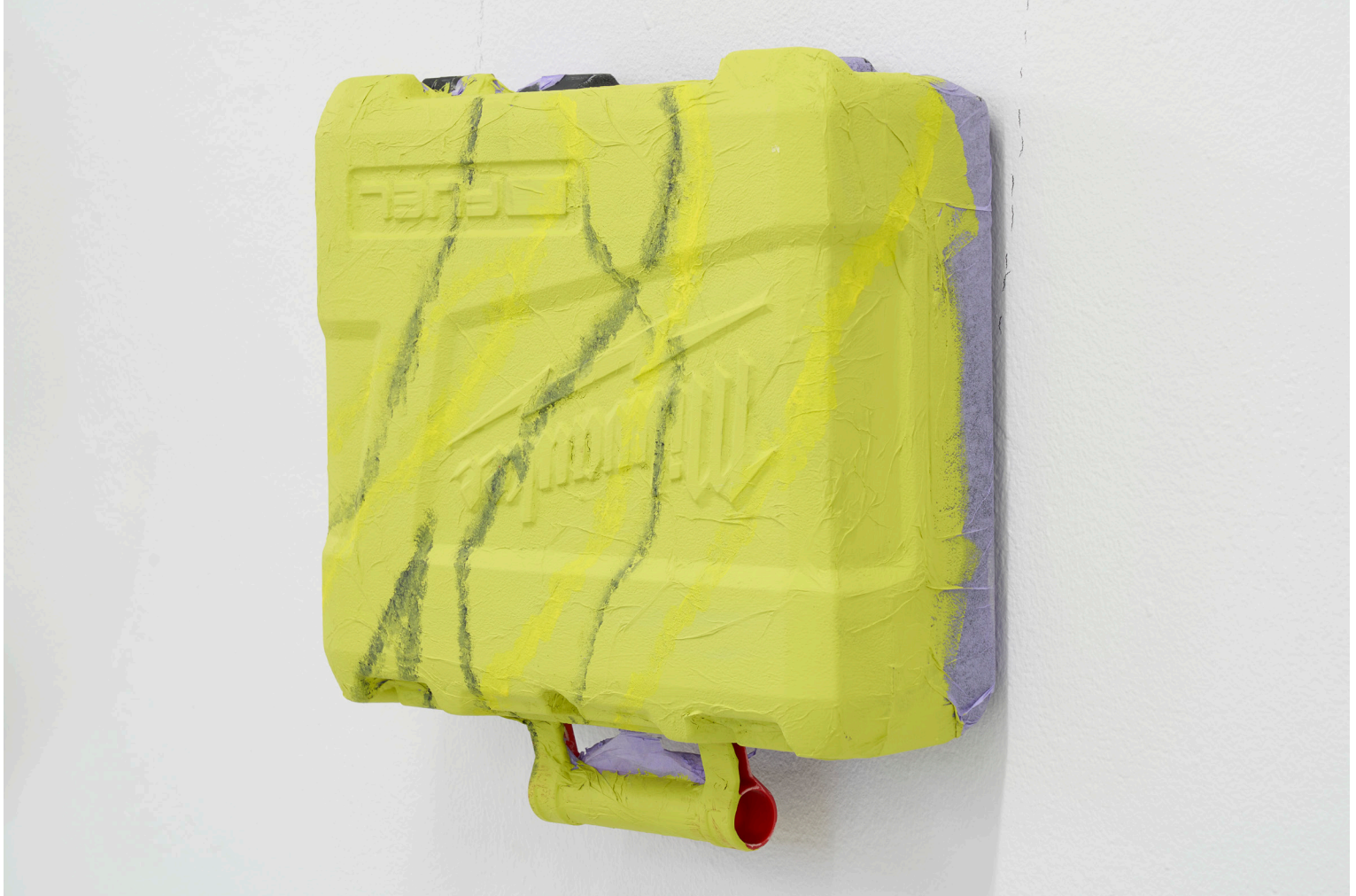
Anne-Mette Schultz. Untitled , 2021. Power tool case, silk paper, paint. 35 × 37 × 11,5 cm