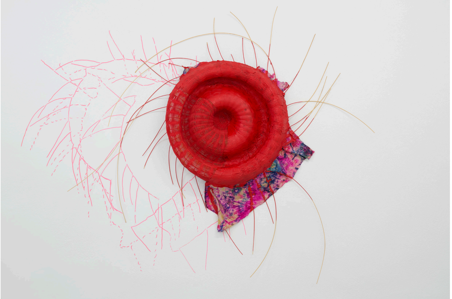
Anne-Mette Schultz. Solkrabbe , 2022. Rattan, fabric, paint. 165 × 175 × 15 cm