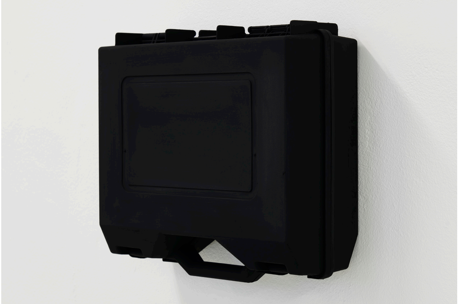
Anne-Mette Schultz. Niwri , 2021. Power tool case, paint. 33 × 38 × 13 cm