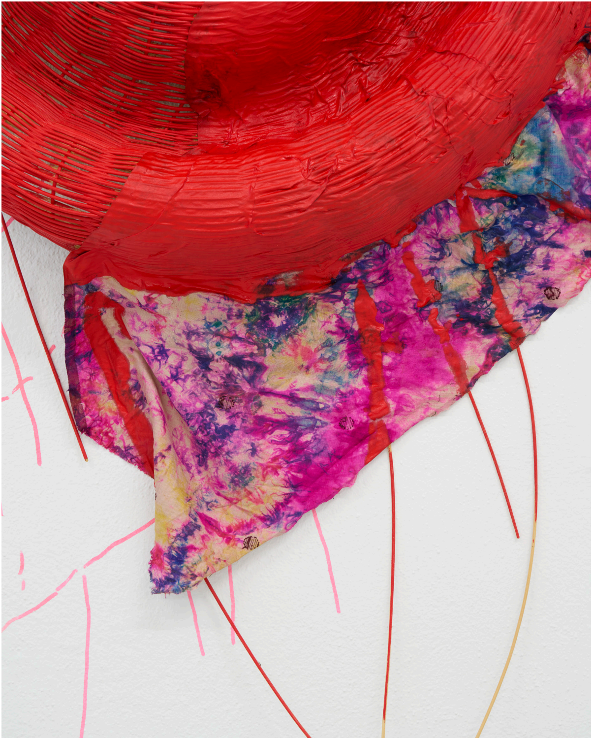
Anne-Mette Schultz. Solkrabbe , 2022. (Detail)