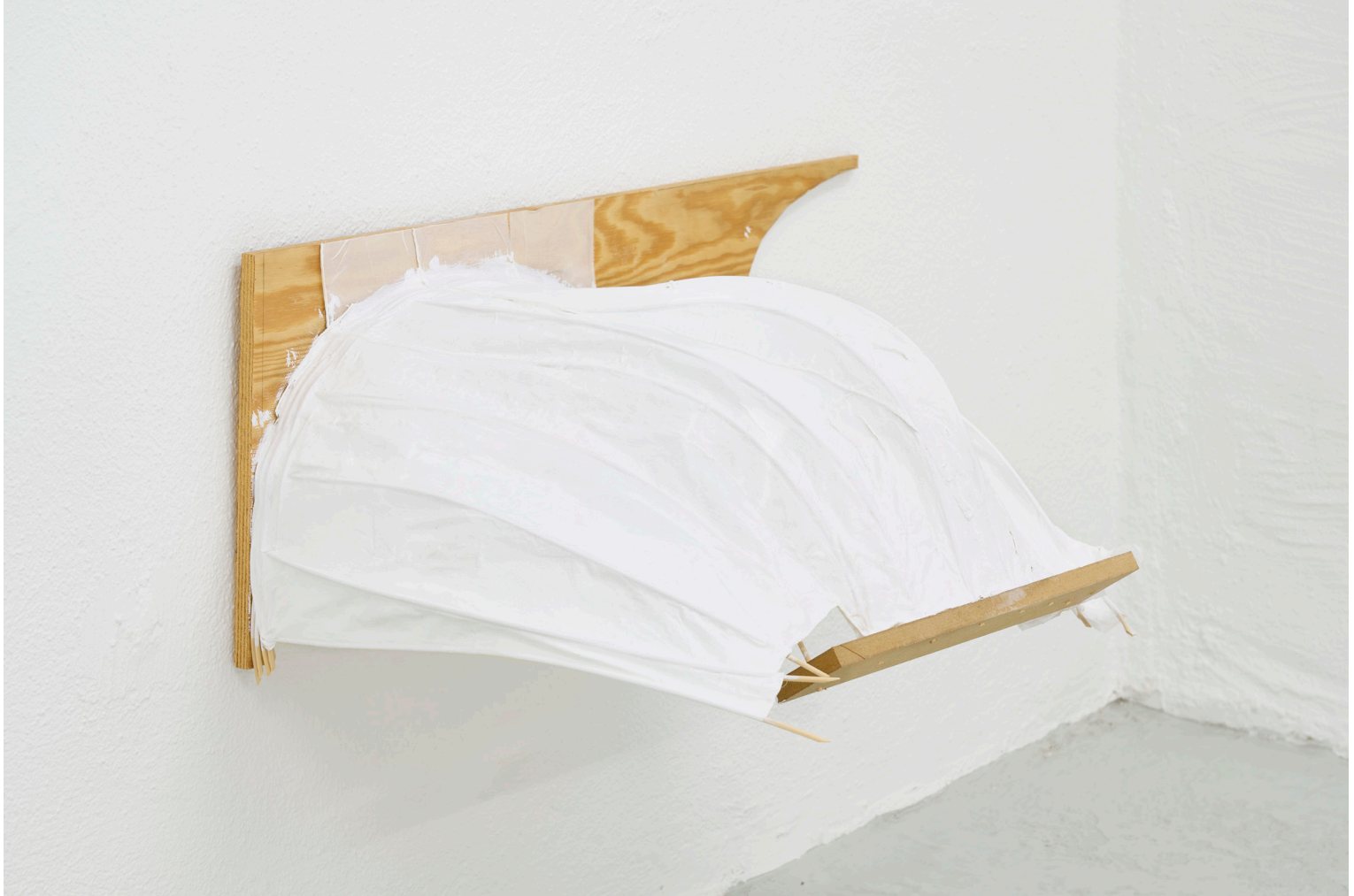
Anne-Mette Schultz. Skærm , 2020. Rattan, wood, fabric, paint. 26 × 73 × 42 cm