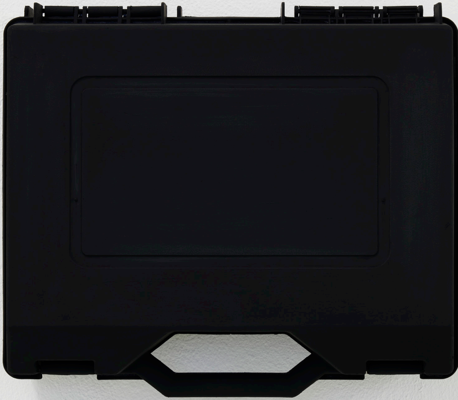
Anne-Mette Schultz. Niwri , 2021. Power tool case, paint. 33 × 38 × 13 cm