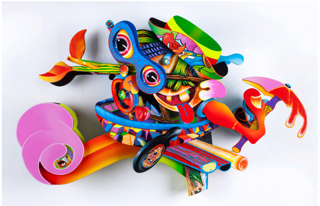
John Hernandez, Pinocoboot , 2015. Acrylic on wood and hardware, 32 x 23 x 7 inches. Image and work courtesy the artist.