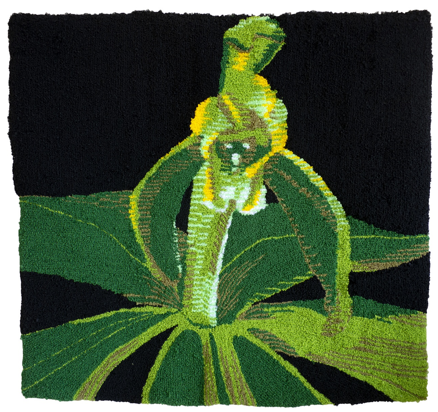
Kim Westfall Small Whorled Pogonia, 2022 Tufted organza ribbon 114.3 x 127 cm / 45 x 50 in