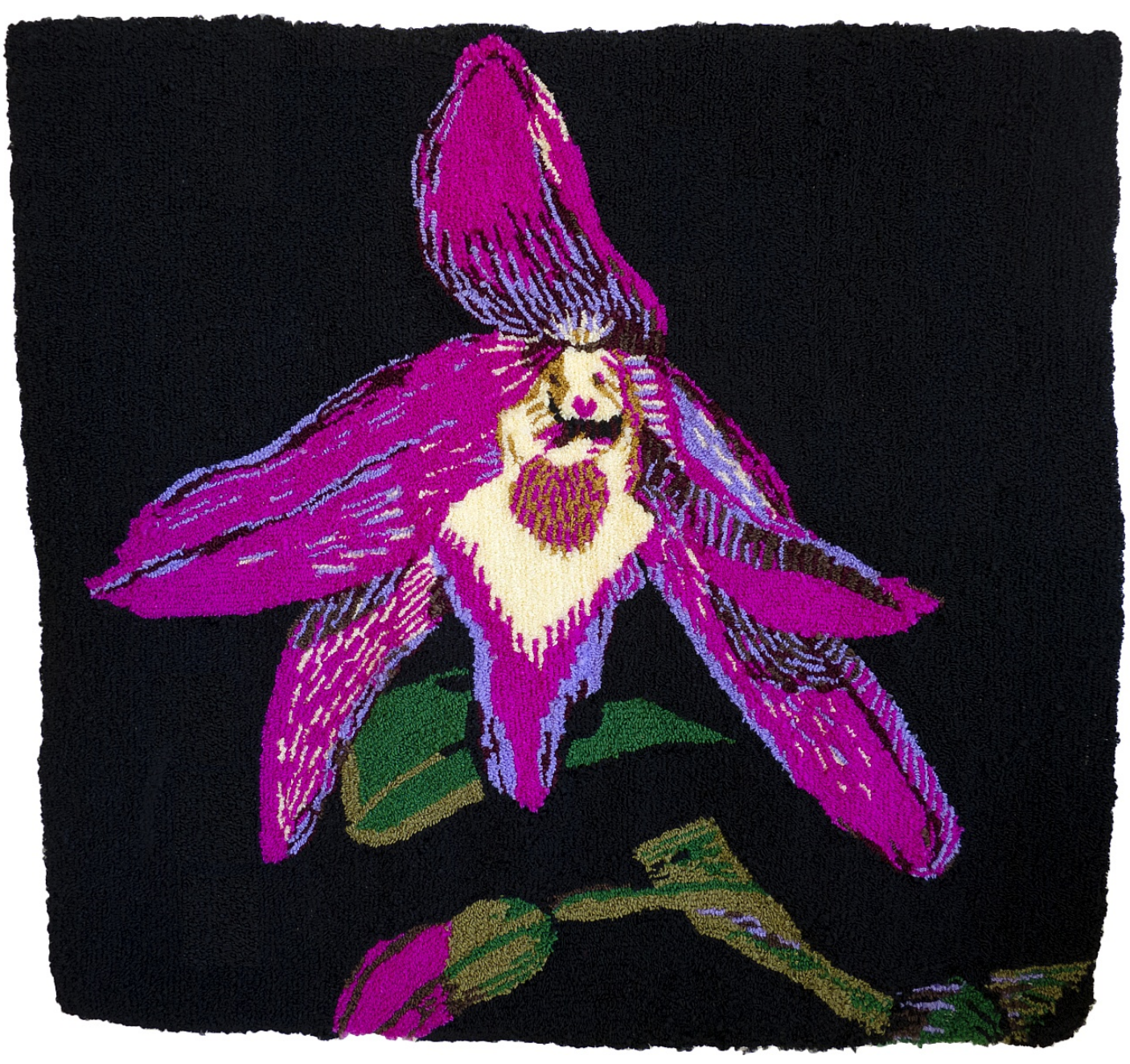
Kim Westfall Dendrobium Moniliforme, 2022 Tufted organza ribbon 119.3 x 134.6 cm / 47 x 53 in