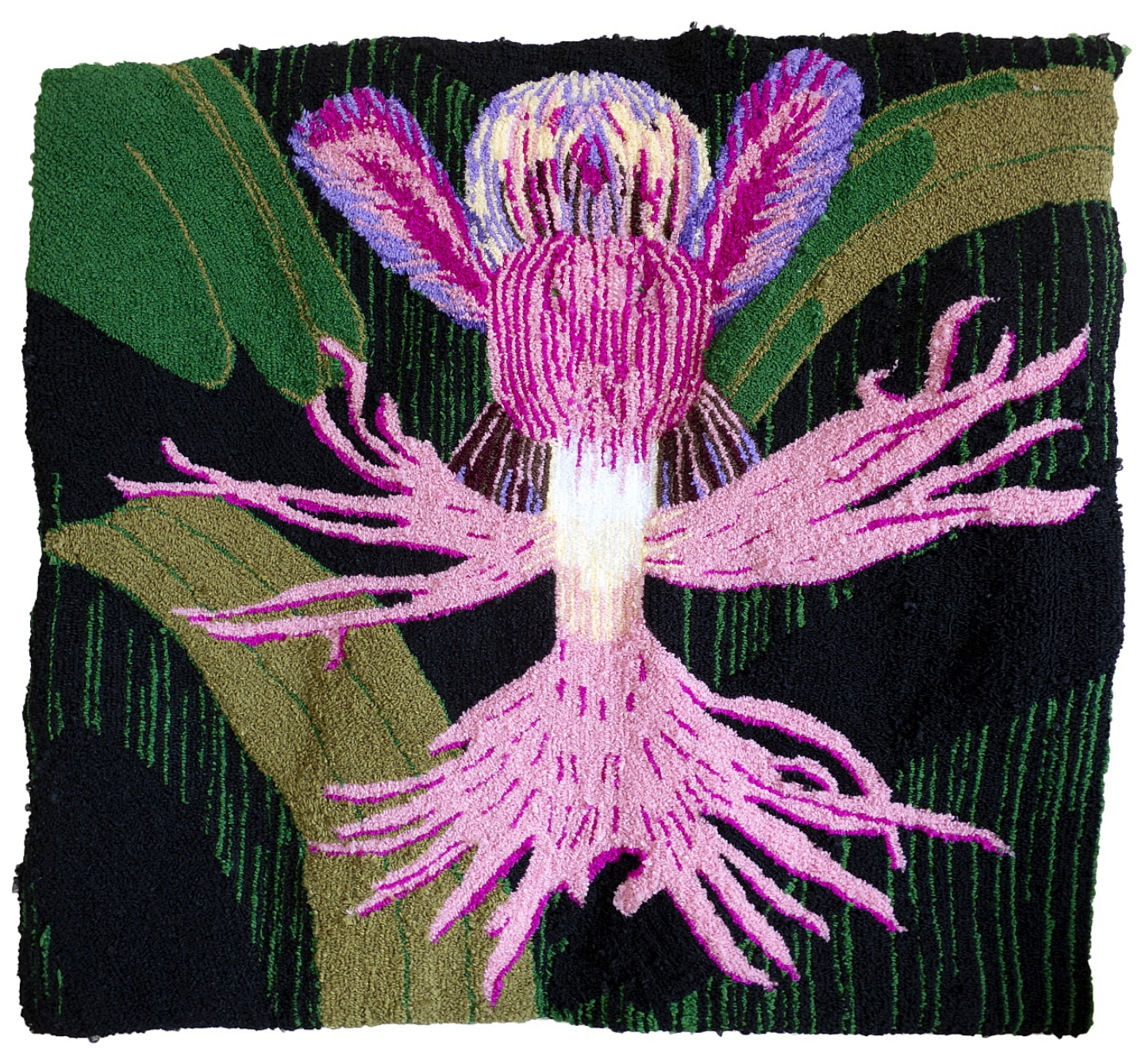
Kim Westfall Platanthera Grandiflora, 2022 Tufted organza ribbon 114.3 x 127 cm / 45 x 50 in