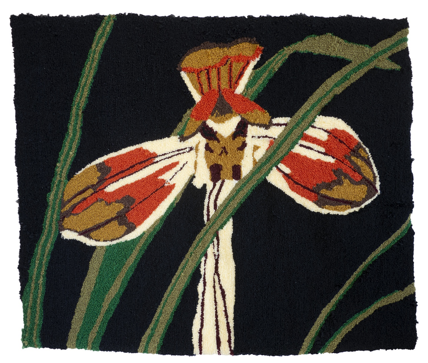
Kim Westfall Cymbidium Goeringii, 2022 Tufted organza ribbon 109.2 x 137.1 cm / 43 x 54 in