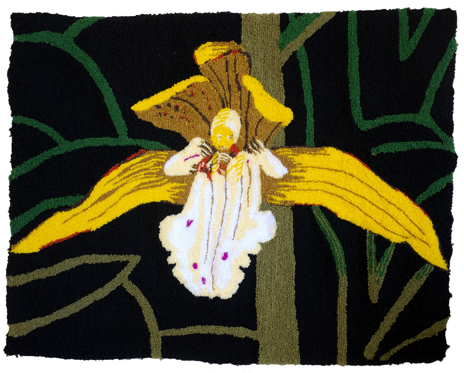
Kim Westfall Oreorchis Patens, 2022 Tufted organza ribbon 111.7 x 147.3 cm / 44 x 58 in