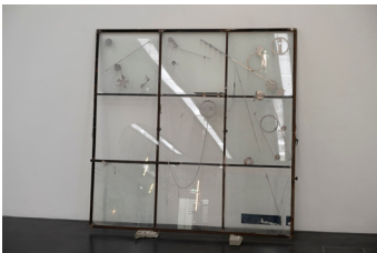
Collector (window drawing) 2022 Steel, glass, magnets, concrete 200 × 200 cm