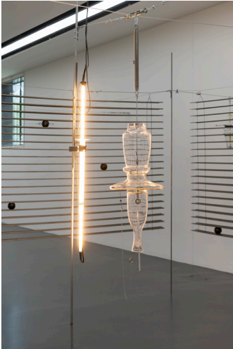
Collector II 2022 Glass, steel cable, found objects, aluminum, plastic Height approx. 80 cm