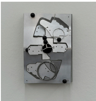
Switchboard I 2021

Wooden ball, aluminum, metal rings, steel balls, plastic Approx. 80 × 40 cm