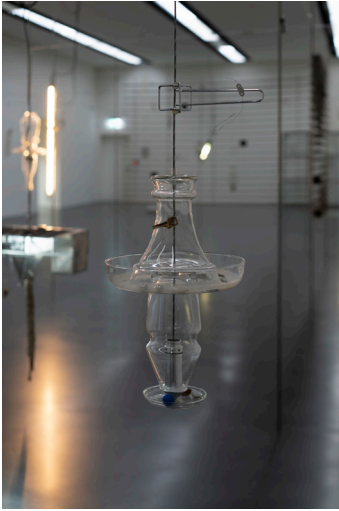
Collector V 2022 Glass, steel cable, found objects, Height approx. 60 cm