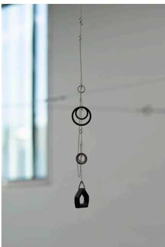
Hook II 2022

Wood, aluminum, metal rings, wooden beads 20 × 25 cm