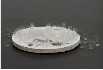
Table and Glasses (some of 250)