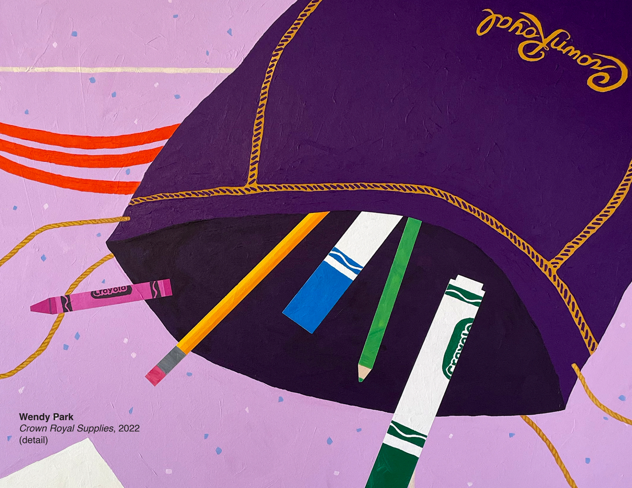
Wendy Park Crown Royal Supplies, 2022 (detail)