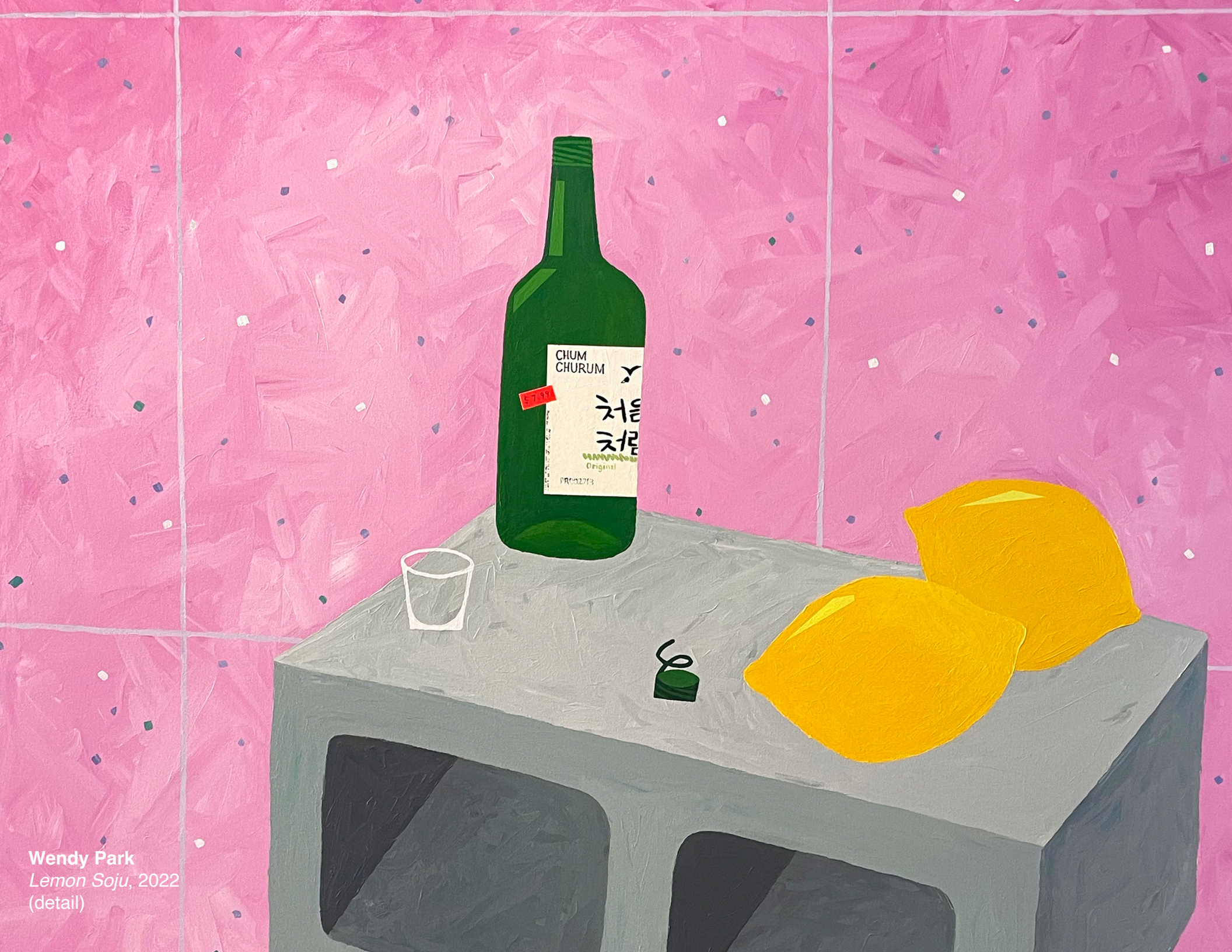
Wendy Park Lemon Soju , 2022 (detail)