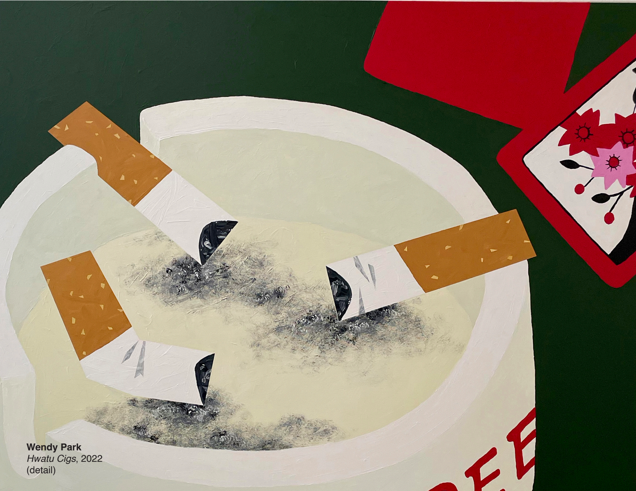
Wendy Park Hwatu Cigs , 2022 (detail)