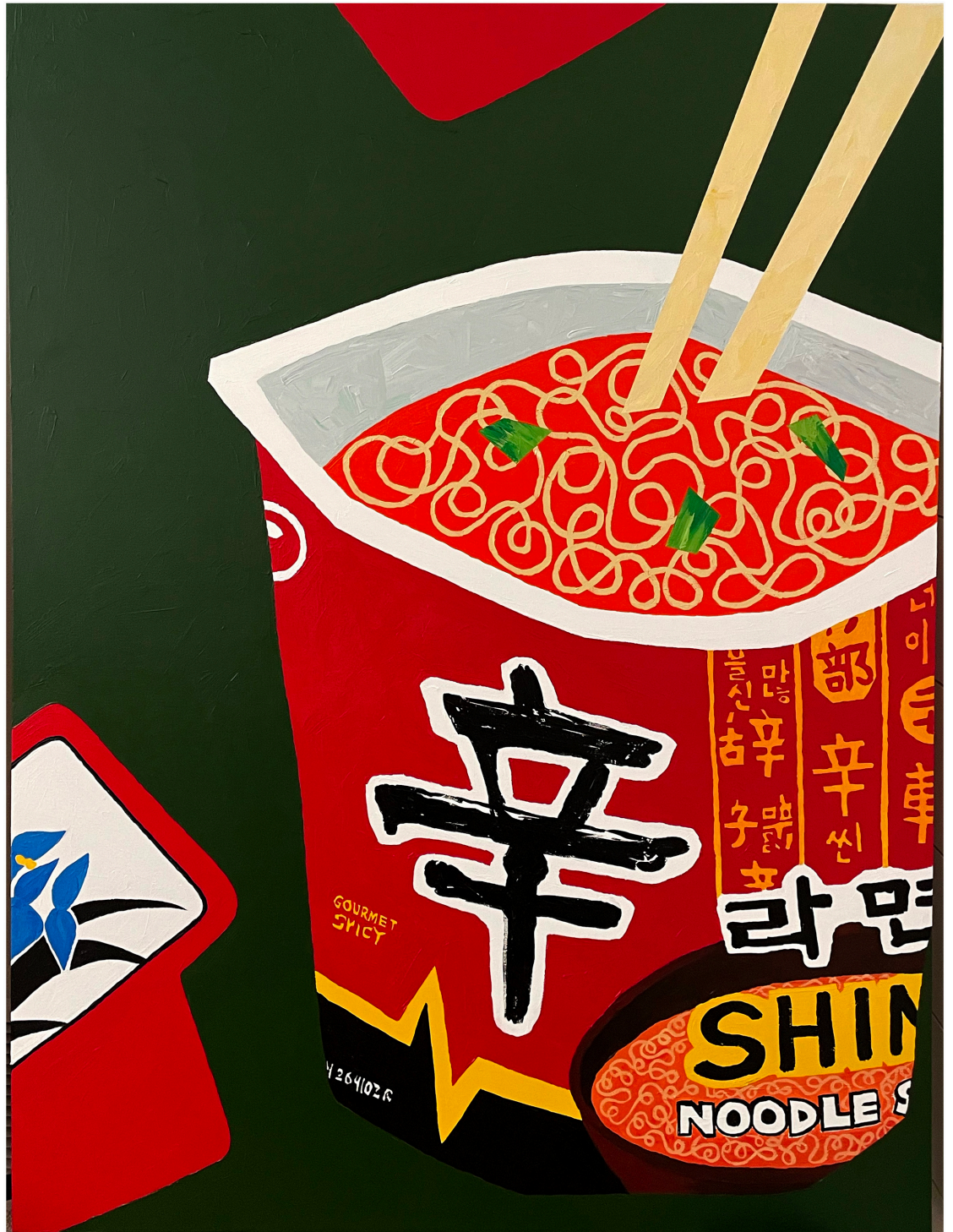
Wendy Park Hwatu Shin Ramyun , 2022 Acrylic on canvas 48 x 36 in 121.9 x 91.4 cm (WPK007)