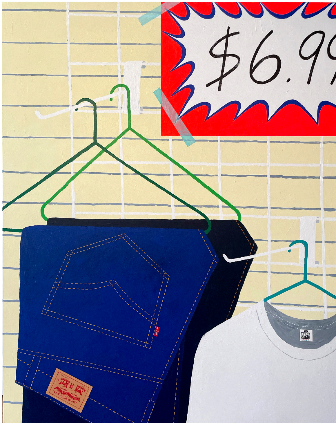
Wendy Park Levis Inventory , 2022 Acrylic on canvas 60 x 48 in 152.4 x 121.9 cm (WPK009)