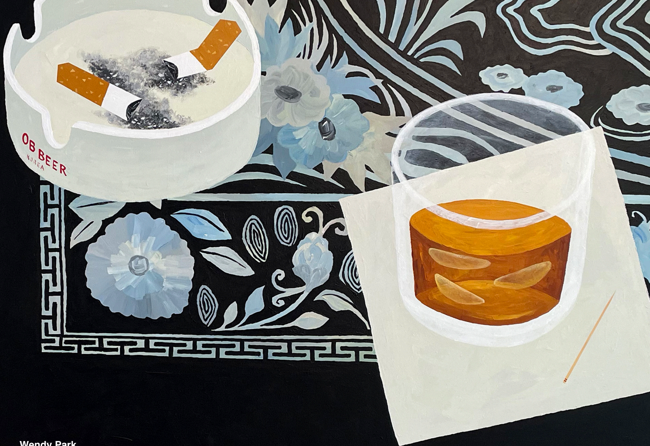
Wendy Park Off the Clock , 2022 (detail)