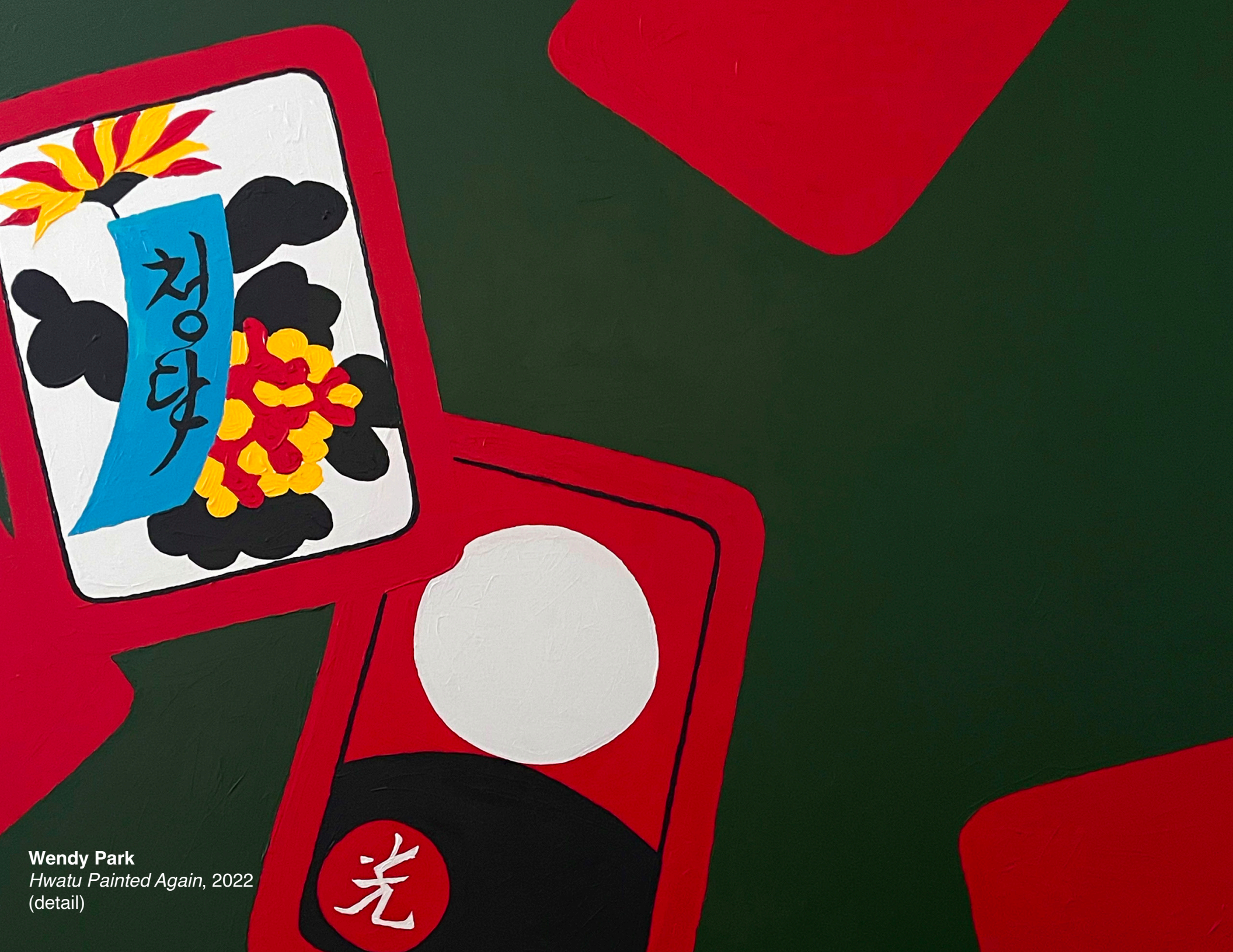
Wendy Park Hwatu Painted Again , 2022 (detail)