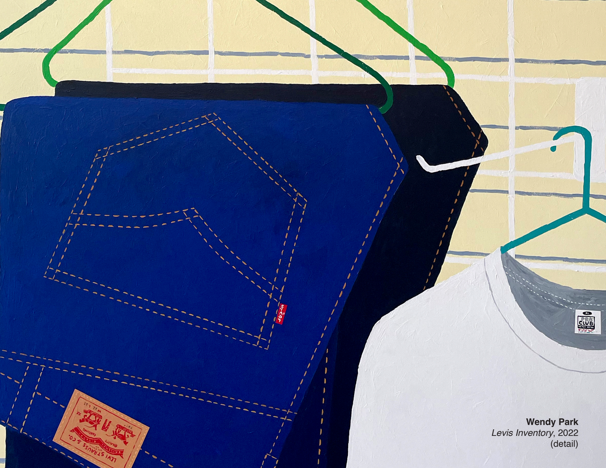
Wendy Park Levis Inventory, 2022 (detail)