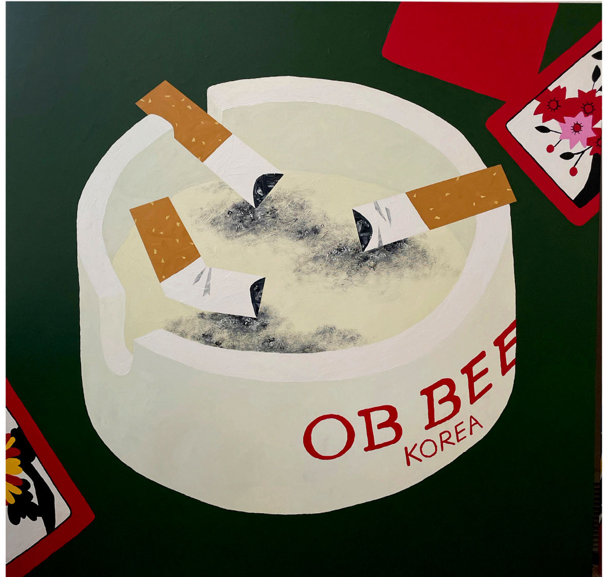
Wendy Park Hwatu Cigs , 2022 Acrylic on canvas 48 x 48 in 121.9 x 121.9 cm (WPK006)