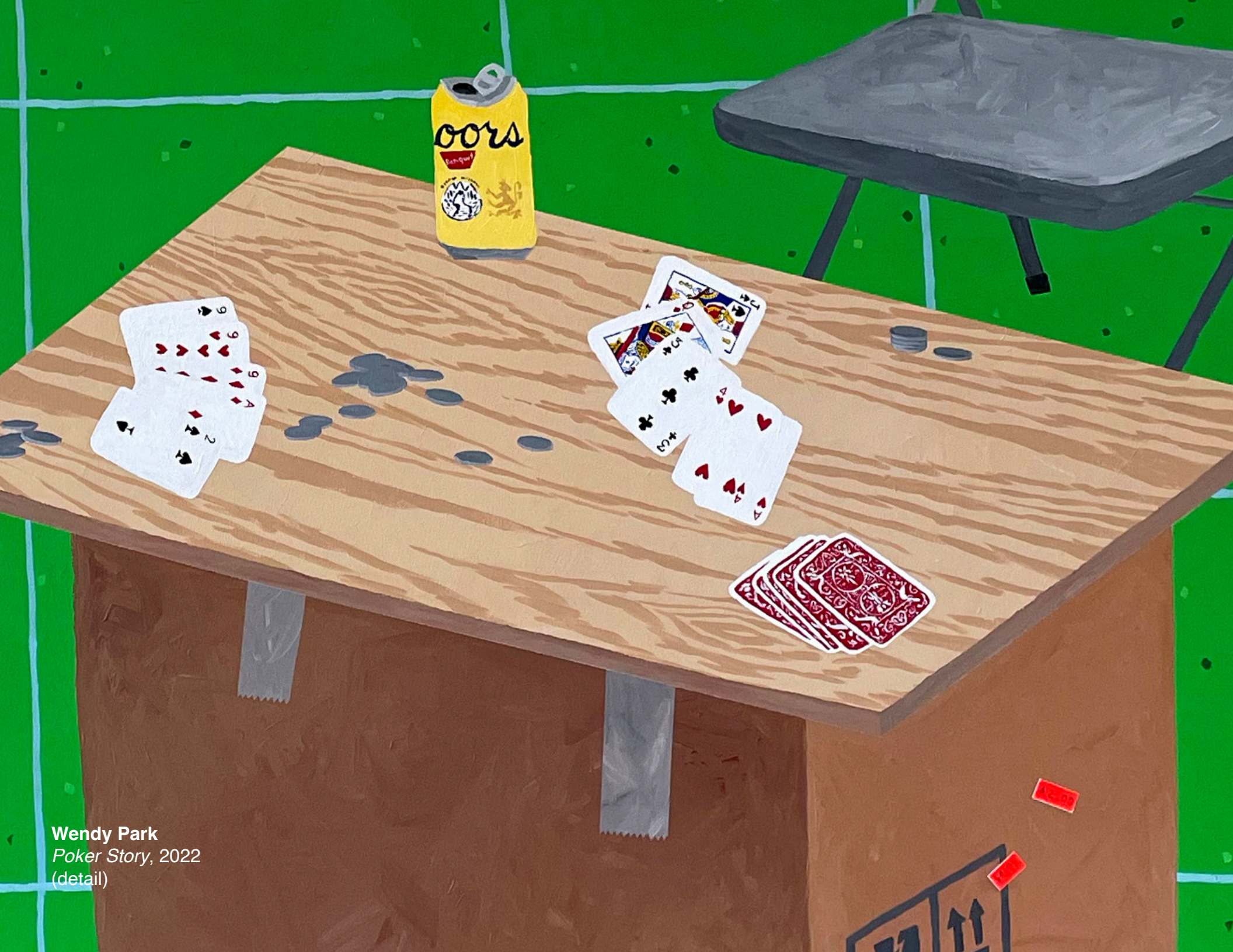
Wendy Park Poker Story , 2022 (detail)