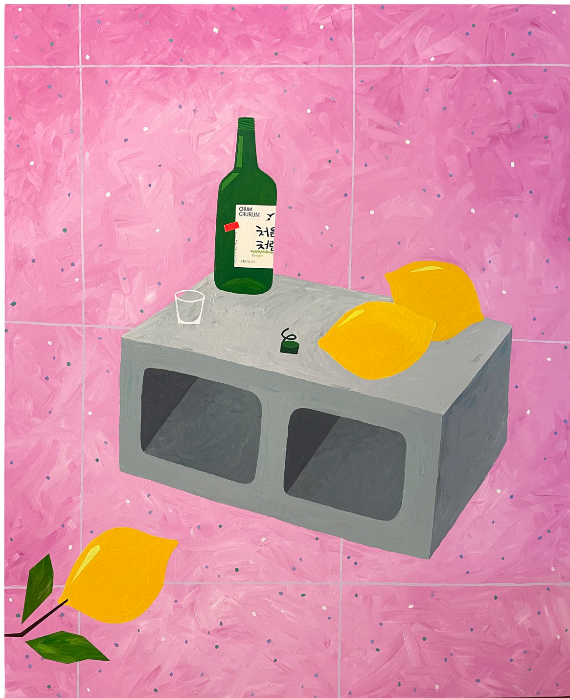
Wendy Park Lemon Soju , 2022 Acrylic on canvas 60 x 48 in 152.4 x 121.9 cm (WPK008)