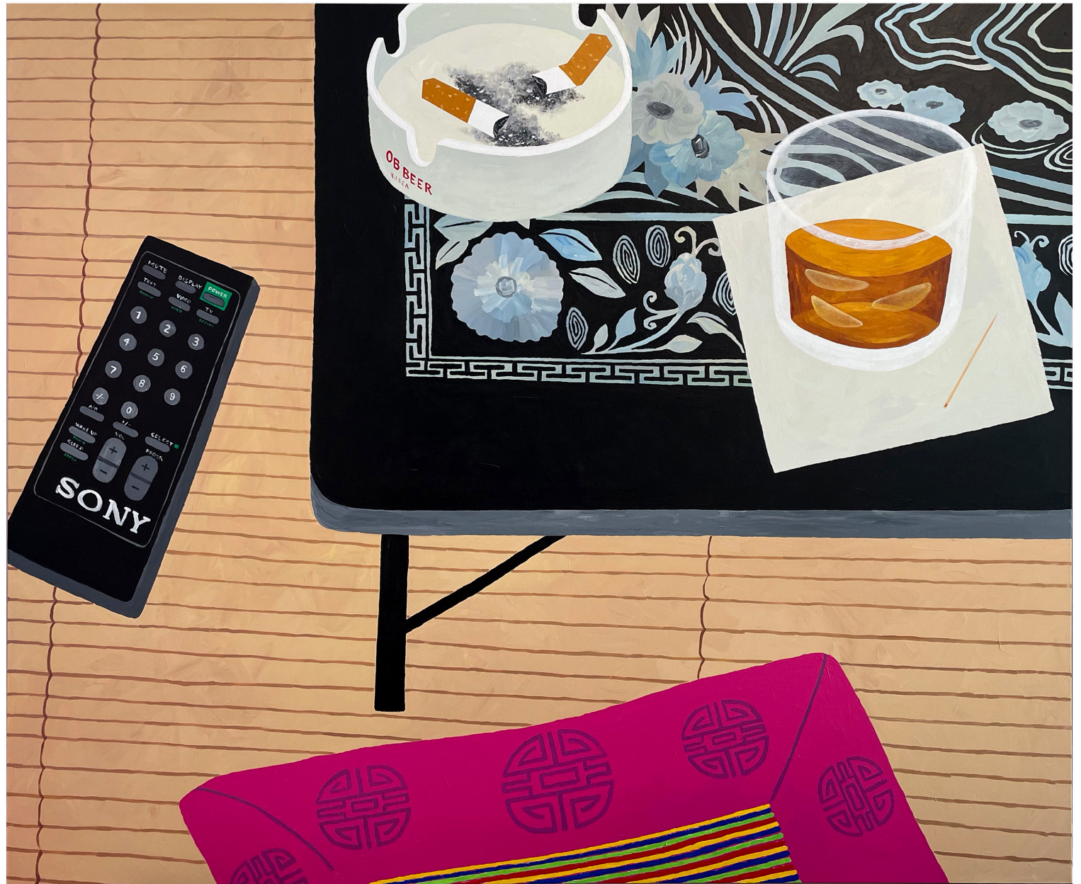
Wendy Park Off the Clock , 2022 Acrylic on canvas 60 x 72 in 152.4 x 182.9 cm (WPK010)