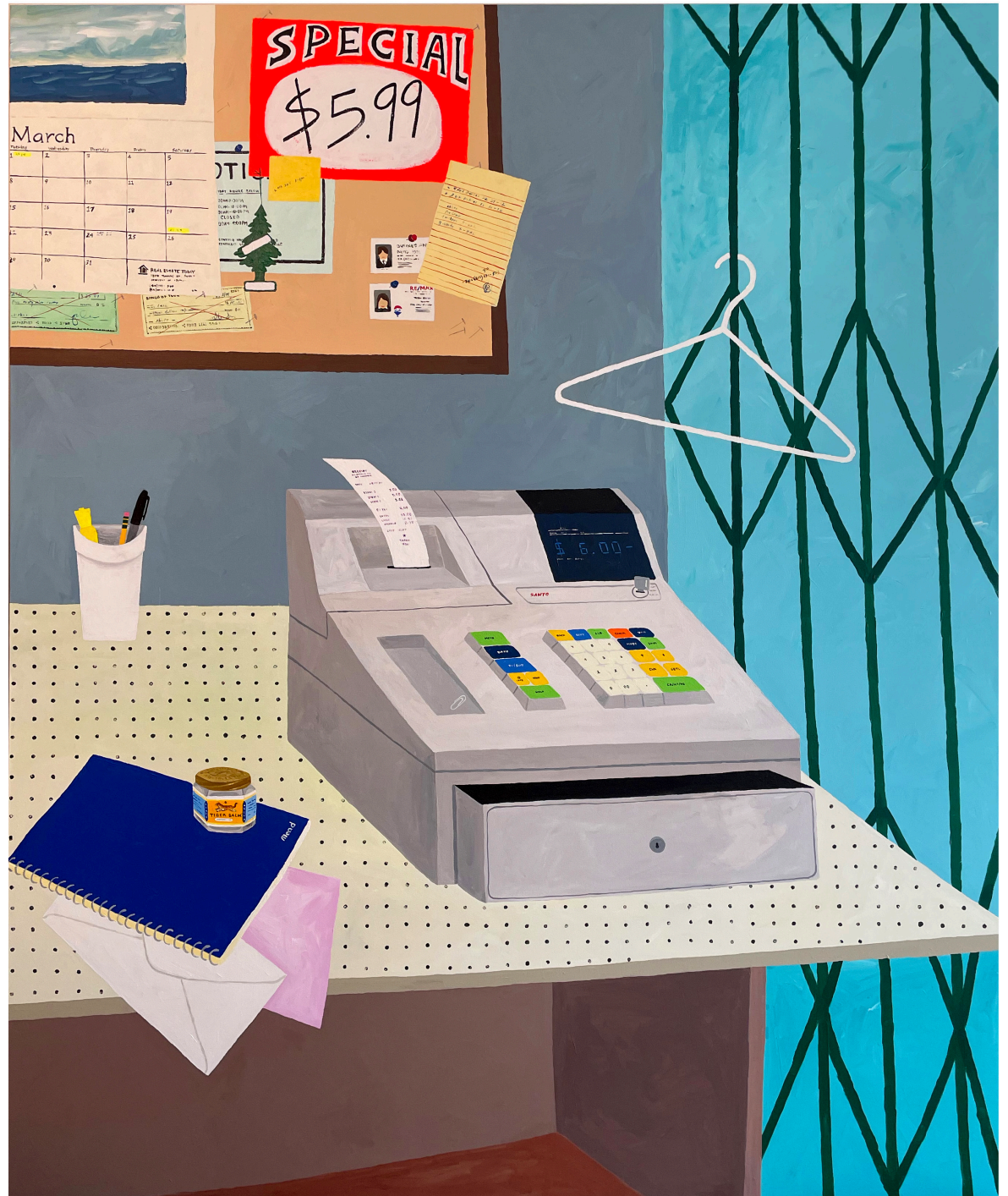
Wendy Park Tiger Balm Register, 2022 Acrylic on canvas 72 x 60 in 182.9 x 152.4 cm (WPK012)