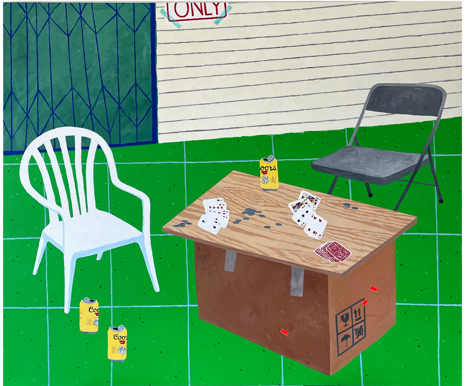
Wendy Park Poker Story , 2022 Acrylic on canvas 60 x 72 in 152.4 x 182.9 cm (WPK011)