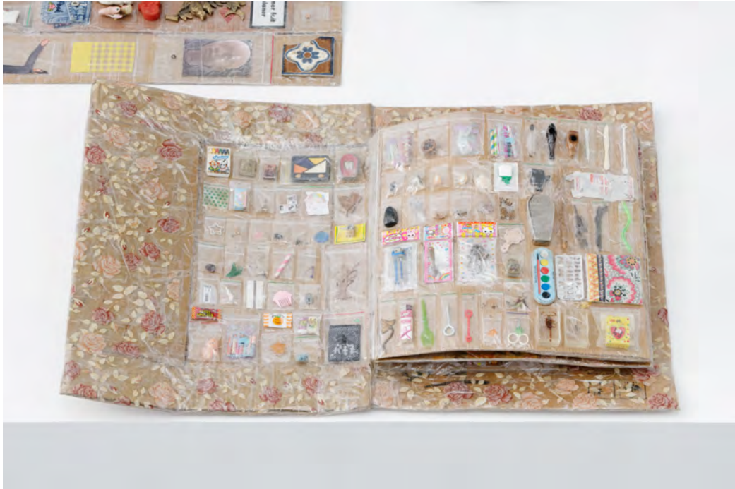
Thomas Cap de Ville Farewell Youth (detail)