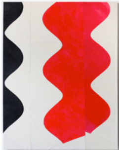
The Wave (Red and Black) , 2014 Acrylic on sewn canvas 78 x 60 inches