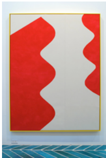
The Wave (Ruby) , 2014 Acrylic on sewn canvas with artist frame 78 x 60 inches