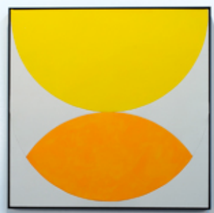
Lemon and Orange , 2014 Acrylic on sewn canvas with artist frame 48 x 48 inches