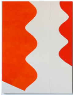
The Wave (Red and Orange) , 2014 Acrylic on sewn canvas 78 x 60 inches