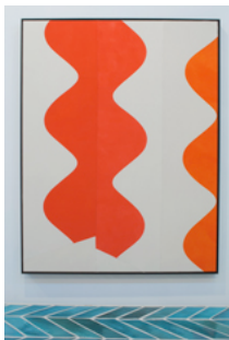
The Wave (Urszula) , 2014 Acrylic on sewn canvas with artist frame 78 x 60 inches