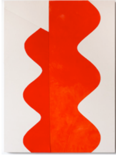
The Wave (Flame) , 2014 Acrylic on sewn canvas 68 x 50 inches