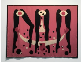
Tanzen , 2015 Hessian, felt, silk thread 86 ¼ x 117 ¼ inches