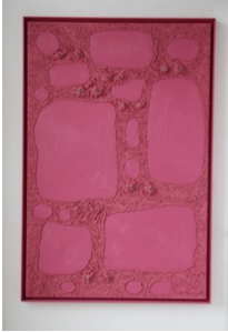
Was darunter liegt (II) , 2015 Oil painting with glass eyes 50 x 33 inches

Opening reception Friday, January 8, 6-8 pm