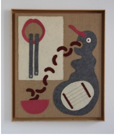
Verbrauch , 2015 Hessian, wood, felt, thread, acrylic paint, dolls eyes 25 ¼ x 21 ¼ x 2 inches