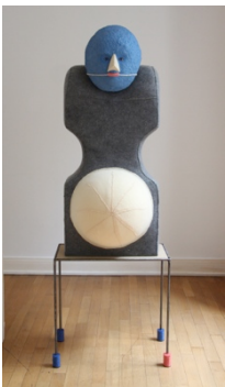
der schwangere Janus als Vogel , 2015 Steel, hessian, felt, thread, acrylic paint, polystyrene, dolls eyes, plaster 71 ¼ x 24 ½ x 29 inches