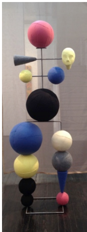
Der Enkel von Oskar, die Tochter von Klaus , 2015 Steel, hessian, felt, thread, acrylic paint, polystyrene 92 ½ x 31 ½ x 18 1/8 inches