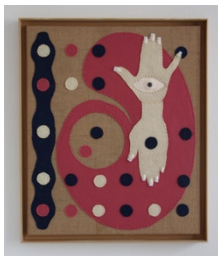
Klare Sicht , 2015 Hessian, wood, felt, thread, acrylic paint, dolls eyes 25 ¼ x 21 ¼ x 2 inches