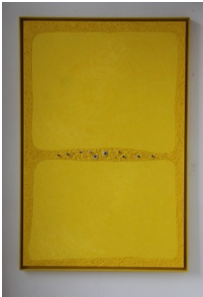
Was darunter liegt (III) , 2015 Oil painting with glass eyes 50 x 33 inches