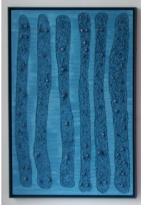
Was darunter liegt (I) , 2015 Oil painting with glass eyes 50 x 33 inches