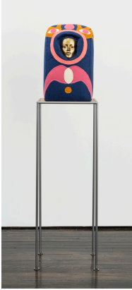
Mutter , 2015 Steel, hessian, felt, thread, polystyrene, dolls eyes, brass 65 ½ x 15 ¾ x 11 ½ inches