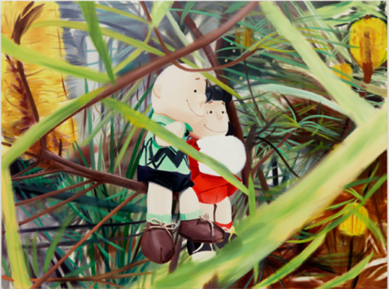
Ulala Imai Lovers , 2022 Oil on canvas 76 3/8 × 102 1/8 inches; 194.01 × 259.41 cm UI-22-018