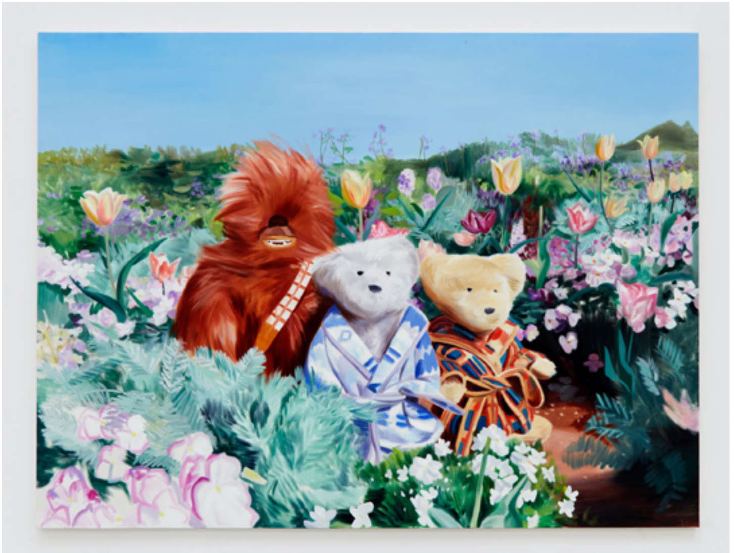
Ulala Imai Care , 2022 Oil on canvas 76 3/8 × 102 1/8 inches; 194.01 × 259.41 cm UI-22-013