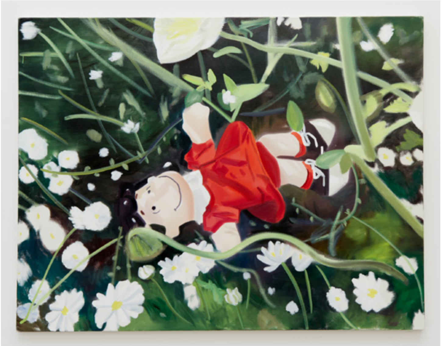
Ulala Imai Ophelia (Lucy) , 2022 Oil on canvas 44 1/8 × 57 1/4 inches; 112.1 × 145.5 cm UI-22-010