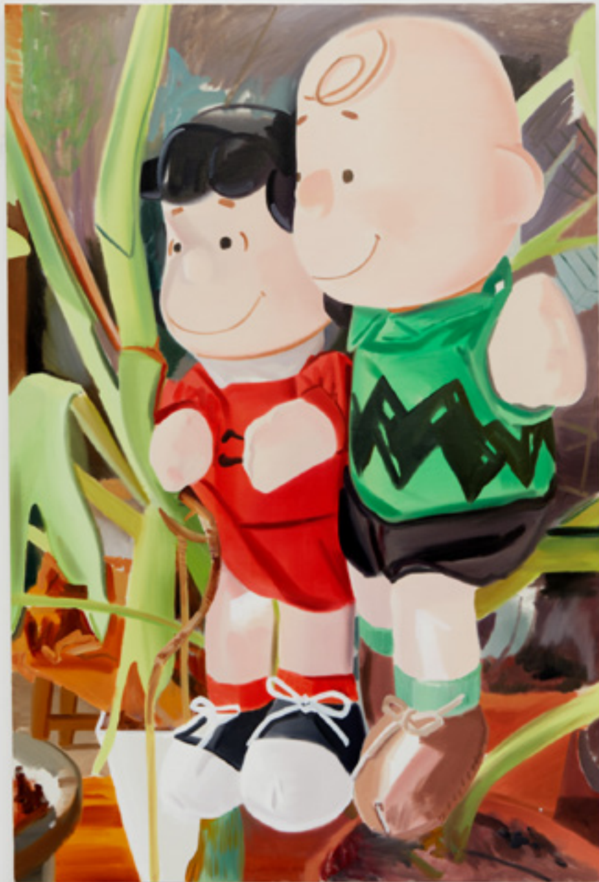
Ulala Imai Lovers , 2022 Oil on canvas 76 3/8 × 51 1/4 inches; 194.01 × 130.18 cm UI-22-017