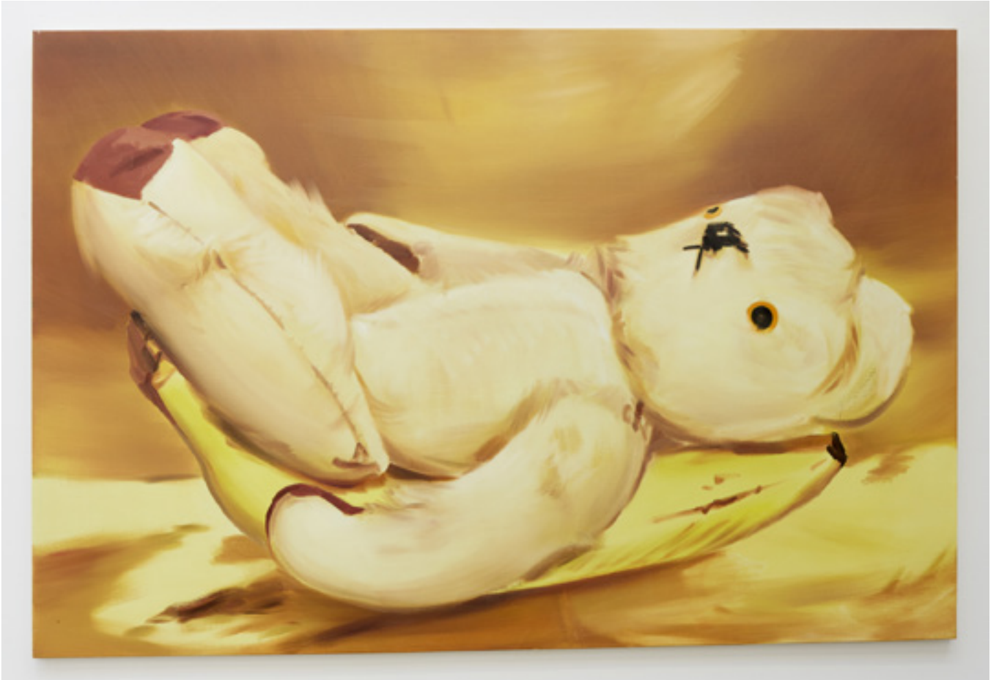
Ulala Imai Melody , 2022 Oil on canvas 51 1/4 × 76 3/8 inches; 130.18 × 194.01 cm UI-22-021