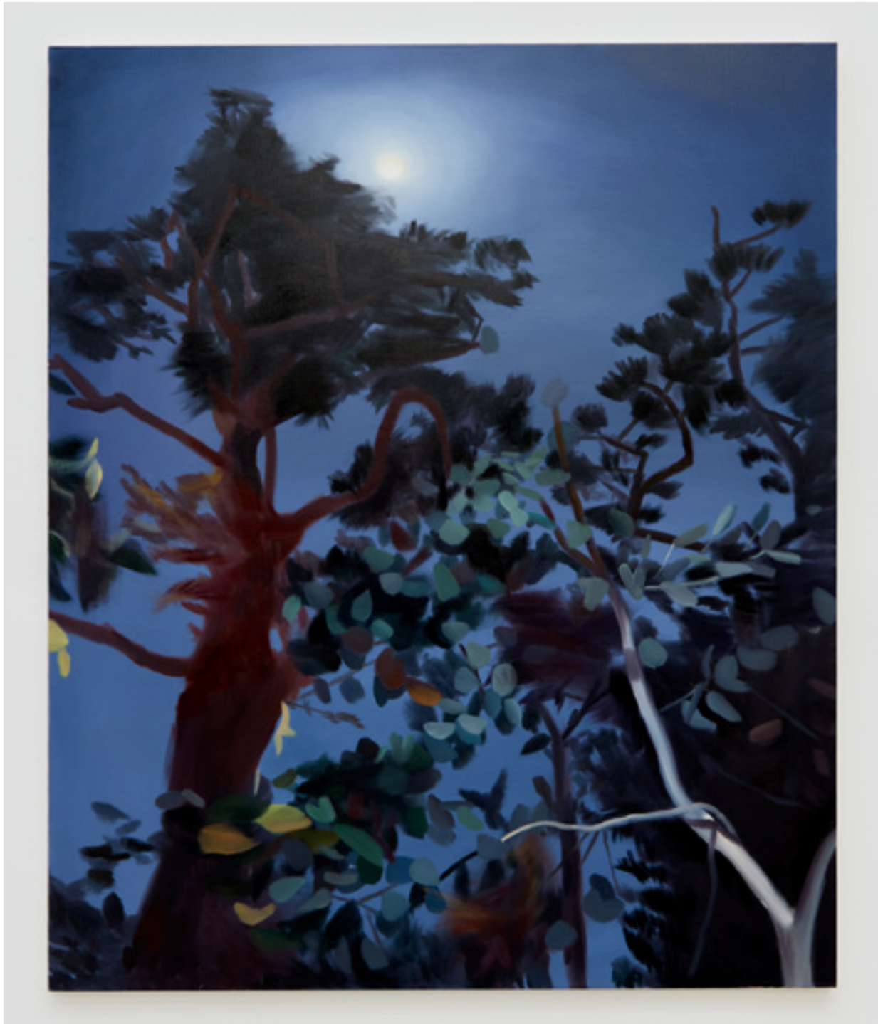
Ulala Imai Holy Night , 2022 Oil on canvas 76 3/8 x 63 3/4 inches; 194 x 162 cm UI-22-011