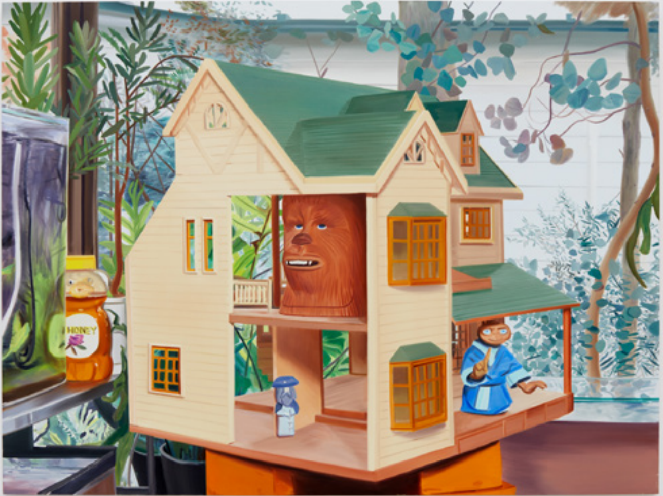
Ulala Imai Green Gables , 2022 Oil on canvas 76 1/4 × 102 1/8 inches; 193.68 × 259.41 cm UI-22-019