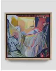
Sharon Madanes The Cover Up , 2022 Oil on panel 10 x 10 in (25.4 x 25.4 cm) JDJ-863