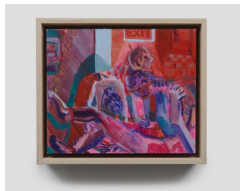
Sharon Madanes Takedown in pink and red , 2022 Acrylic and oil on panel 6.5 x 7.75 in (16.5 x 19.7 cm) JDJ-1036