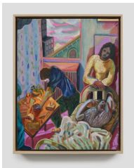
Sharon Madanes Room with a View , 2022 Oil on linen 18 x 14 in (45.7 x 35.6 cm) JDJ-868