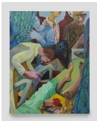
Sharon Madanes Bedside Histories , 2022 Acrylic and oil on linen 72 x 56 in (182.9 x 142.2 cm) JDJ-864