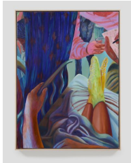
Sharon Madanes Privacy Screen , 2022 Oil on linen 40 x 30 in (101.6 x 76.2 cm) JDJ-865