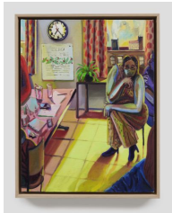
Sharon Madanes Zero Tolerance , 2022 Oil on linen 18 x 14 in (45.7 x 35.6 cm) JDJ-799