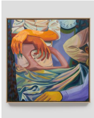
Sharon Madanes Waxing and Waning , 2022 Oil on linen 30 x 30 in (76.2 x 76.2 cm) JDJ-861