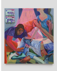
Sharon Madanes The Takedown , 2022 Acrylic on linen 60 x 54 in (152.4 x 137.2 cm) JDJ-869