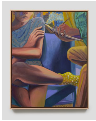
Sharon Madanes Taking History , 2022 Oil on linen 24 x 30 in (61 x 76.2 cm) JDJ-797