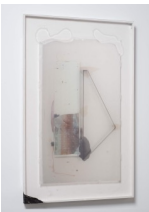
Josh Tonsfeldt Untitled 2015 pigment inks, epoxy resin, prism film, hydrocal, pigment inks on hydrographic film, 46 x 28.5 x 1.5 in. / 116.84 x 72.39 x 3.81 cm.