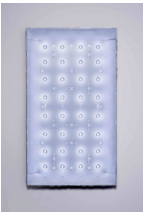
Josh Tonsfeldt Untitled 2015 LED television backlight 22.5 x 38 in. / 57.15 x 96.52 cm.