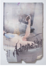
Josh Tonsfeldt Adrenaline Tattoo 2015 UV cured pigment print on hydrocal, spray paint, epoxy resin, pigment inks 32 x 48 in. / 81.28 x 121.92 cm.