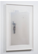
Josh Tonsfeldt Untitled 2015 pigment inks, epoxy resin, prism film, hydrocal, pigment inks on hydrographic film, 46 x 28.5 x 1.5 in. / 116.84 x 72.39 x 3.81 cm.