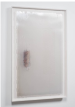
Josh Tonsfeldt Untitled 2015 pigment inks, epoxy resin, prism film, hydrocal, pigment inks on hydrographic film, CFL 46 x 28.5 x 1.5 in. / 116.84 x 72.39 x 3.81 cm.