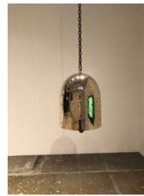
Davina Semo Hot Sun , 2021 Polished cast bronze bell, solid bronze clapper, hemp shibari rope, powder coated stainless steel hardware, etched steel chain 21 x 17 1/4 in.