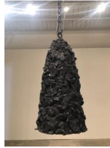
Davina Semo Receiver , 2019 Patinated cast bronze bell, whipped nylon line, wooden clapper, powder-coated chain, hardware 20 x 11 in.