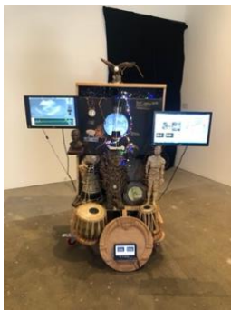
Milford Graves Bikongo-Ifá: Spirit of the Being , 2020 Wood, tabla, acupuncture model, bata drum, Nkondi figure, George Washington Carver bust, compass, glass, peanuts, LabVIEW animation, computer monitors, bells, plasma lamp, globe, eagle figurine, alarm clock, collaged paper printouts, copper wire, paint marker, metal fasteners, casters 69 x 38 ½ x 36 in. Courtesy of the Estate of Milford Graves