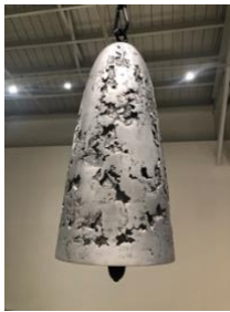
Davina Semo Erode , 2021 Cast aluminum, patinated solid bronze clapper, hemp shibari rope, leather cord, powder-coated galvanized steel chain, powder coated stainless steel hardware 20 x 9 1/2 in.