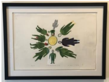
Luke Anguhadluq The Drummer Stopped the Drum Beat , 1982 Lithograph 27 ¼ x 40 in. Collection of the Perlman Teaching Museum, Carleton College, Northfield, MN