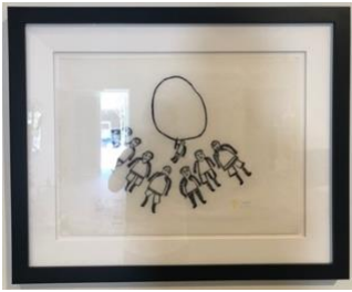
Luke Anguhadluq Drum Dance , 1970 Stonecut on Japanese paper 16 x 22 in. Collection of the Perlman Teaching Museum, Carleton College, Northfield, MN