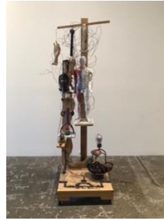
Milford Graves Pathways of Infinite Possibilities: Yara , 2017 Wood, metal brackets, copper wire, plastic medical figures, artifacts, medical heart specimen, wooden model hand, religious figurine, water element, printed labels, lights, stones, glue, amplifier, speaker, metal brackets, casters; 88 ½ x 38 ¼ x 33 ½ in. Courtesy of the Estate of Milford Graves