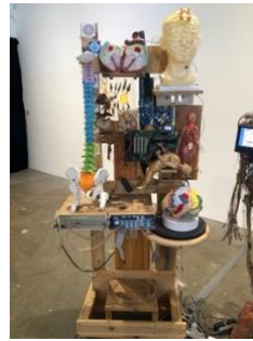
Milford Graves Pathways of Infinite Possibilities: Heartbeat , 2017 Wood, display spinal column, scientific models, Acupuncture model, printed diagrams and labels, old circuitry, wooden construction, video monitor, lights, amplifier, wires, metal brackets, glue, casters 76 ½ x 40 x 29 in. Courtesy of the Estate of Milford Graves