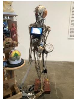
Milford Graves Pathways of Infinite Possibilities: Skeleton , 2017 Human skeleton, steel pipe, wires, stickers, medical ear model, dundun (talking drum), preserved heart, stethoscope, video monitor, transducer, amplifier, wood, metal, printed labels, marker, casters 68 ½ x 27 ½ x 25 in.