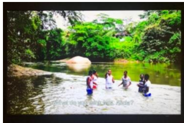
Marcos Ávila Forero Atrato , 2014 Single-channel HD video, color, sound; 13:52 min. Courtesy of the artist