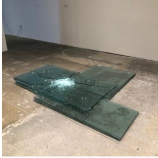
Barry Le Va 1 Edge/2 Corners; 2 Edges/1 Corner , 1968- 71/2022 Shattered glass Dimensions variable.