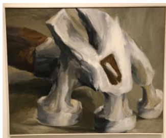
Lee Lozano Untitled , 1963 Oil on canvas 65 x 80 in. Private Collection