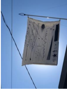
Raven Chacon American Ledger #1 , 2022 Performance score on flag Dimensions variable. Courtesy of the artist