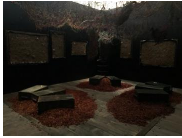
Em'kal Eyongakpa batu kenəŋ XII-rh/ babhi-berat XII-r [babhi-manyep/ babhi-bawet, (mbaŋ)] , 2022 8-channel sound installation, 8 transducers, 4 hydrophone microphones, oil drum, ammunition boxes, mycelium based sound baffles, wood floor, wood chips, water pumps, plastic tubes, yarn Dimensions variable.