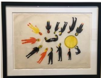
Luke Anguhadluq A Time for Celebration , 1974 Stonecut and stencil on paper 25 x 35 in. Collection of the Perlman Teaching Museum, Carleton College, Northfield, MN