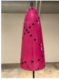
Davina Semo Admirer , 2020 Cast bronze bell, UV protected 2-stage catalyzed urethane, stainless steel chain, polyurethane, clapper, hardware 32 x 13 in.