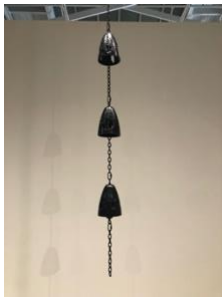
Davina Semo Drop , 2020 Patinated cast bronze bells, UV protected 2-stage catalyzed urethane, stainless steel chain and hardware, polyurethane clapper Each bell: 7 3/4 x 5 3/4 in.