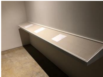
Susan Howe Pages from Concordance , 2020 Paper, glue 8 ½ x 11 in.