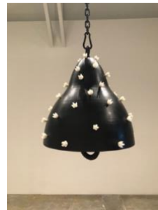
Davina Semo Fetish , 2022 Patinated cast bronze bell, PolyJet 3D-printed opaque VeroWhite resin, leather wrapped solid bronze clapper, hemp shibari rope, powder coated stainless steel hardware, and powder coated galvanized steel chain 18 x 19 in.