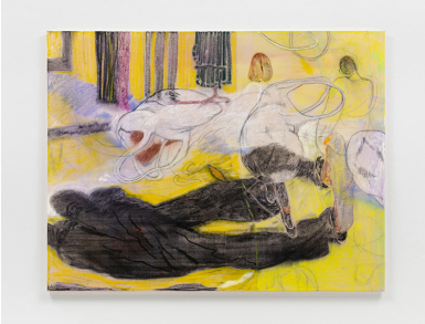
Henry Curchod Autumn Walkers , 2022 Oil and charcoal on linen 92 × 117 cm (36 1/4 × 46 in)