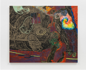
Henry Curchod Green Out in the Co Op , 2022 Oil and charcoal on linen 102 × 122 cm (40 1/8 × 48 in)