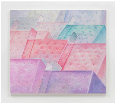
Richard Burton No Way Out , 2022 Oil and sand on linen 130 × 150 cm (51 1/8 × 59 in)