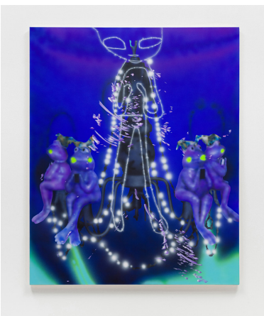
Rao Weiyi Prayers into the Void , 2022 Acrylic on canvas 180 x 140 cm (70 7/8 x 55 1/8 in)