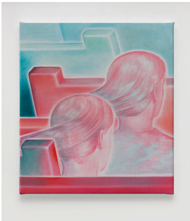
Richard Burton Torque , 2022 Oil on canvas 50 × 45 cm (19 3/4 × 17 3/4 in)