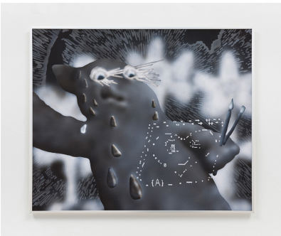
Rao Weiyi Worries in the Blink of an Eye , 2021 Acrylic on canvas 50 x 60 cm (19 3/4 x 23 5/8 in)