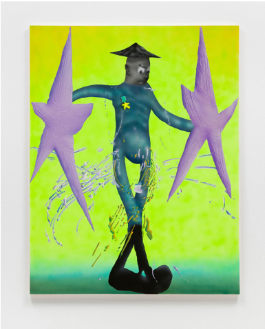
Rao Weiyi Captain Pentacle , 2022 Acrylic on canvas, sand 180 x 140 cm (70 7/8 x 55 1/8 in)