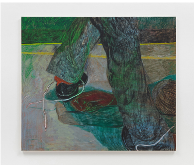
Henry Curchod A Conservative Hierarchal Type Walks into A Bar , 2022 Oil and charcoal on linen 91.5 × 105.5 cm (36 × 41 1/2 in)