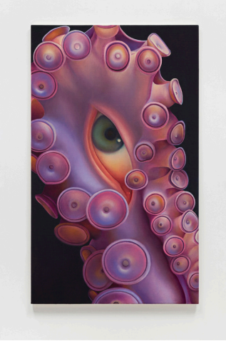
Ariane Heloise Hughes Watch & Learn , 2022 Oil on linen 50 × 30.5 cm (19 3/4 × 12 in)