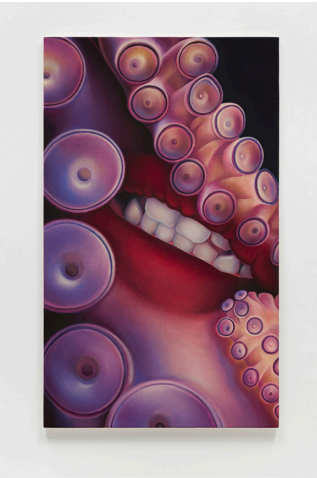
Ariane Heloise Hughes You Suck ! , 2022 Oil on linen 50 × 30.5 cm (19 3/4 × 12 in)