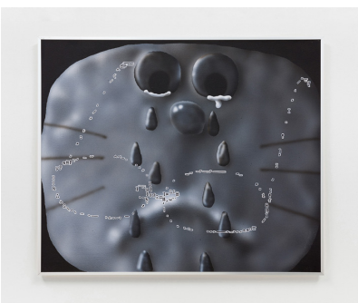
Rao Weiyi Glasses for Nobita , 2021 Acrylic on canvas 50 x 60 cm (19 3/4 x 23 5/8 in)