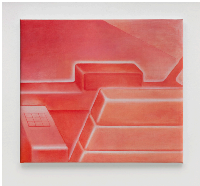
Richard Burton Thermo Static , 2021 Oil on linen 36 × 40 cm (14 1/8 × 15 3/4 in)