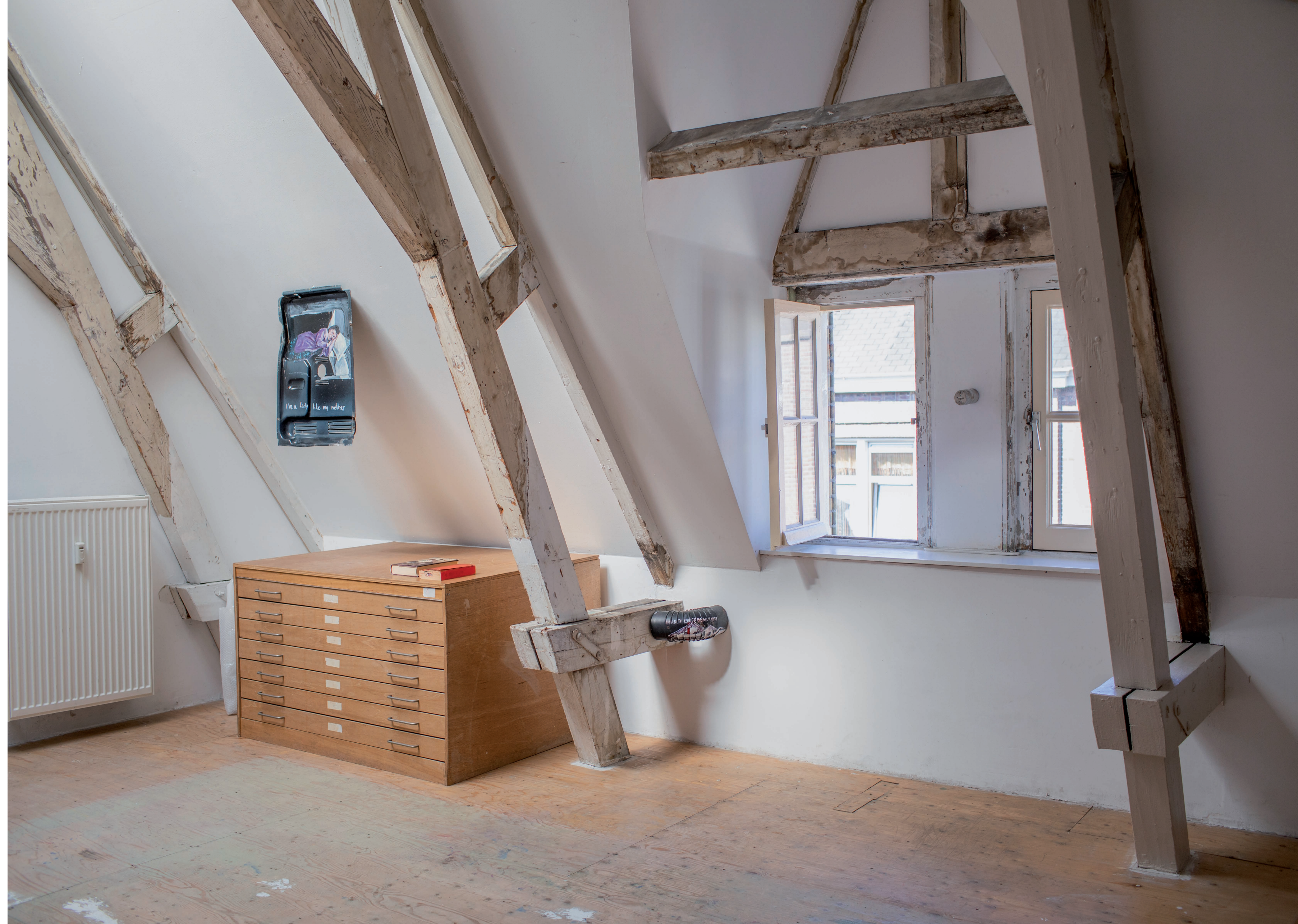
12. Selma Selman – I HAD TO LEAVE TO BE BACK HERE. Three works from the Painting on metal series and I HAD TO LEAVE TO BE BACK HERE book selection. 2020/2021 and 2022.