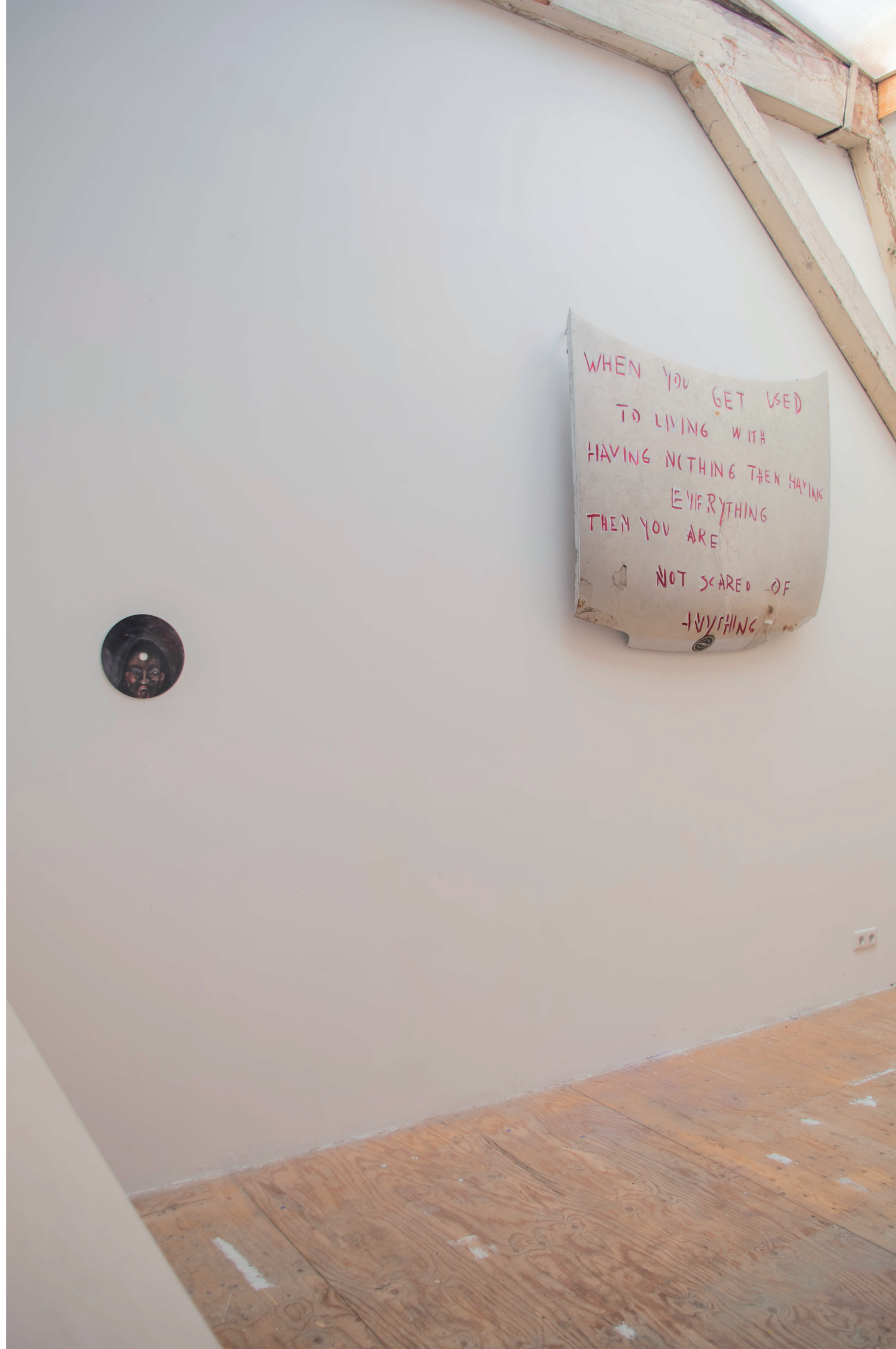
06. Selma Selman. Painting on metal . 2020/2021. Acrylic paint on scrap metal. 23 x 23 cm and 114 x 129 x 13 cm.