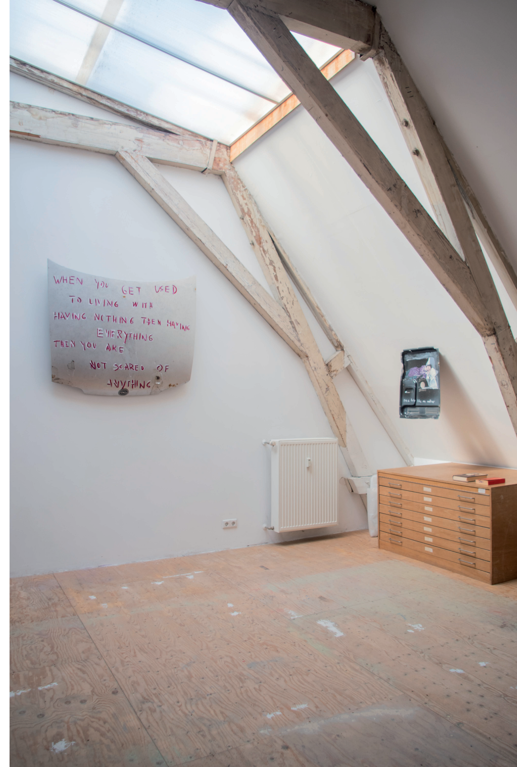
07. Selma Selman. Painting on metal . 2020/2021. Acrylic paint on scrap metal. 114 x 129 x 13 cm and 50 x 60 cm.