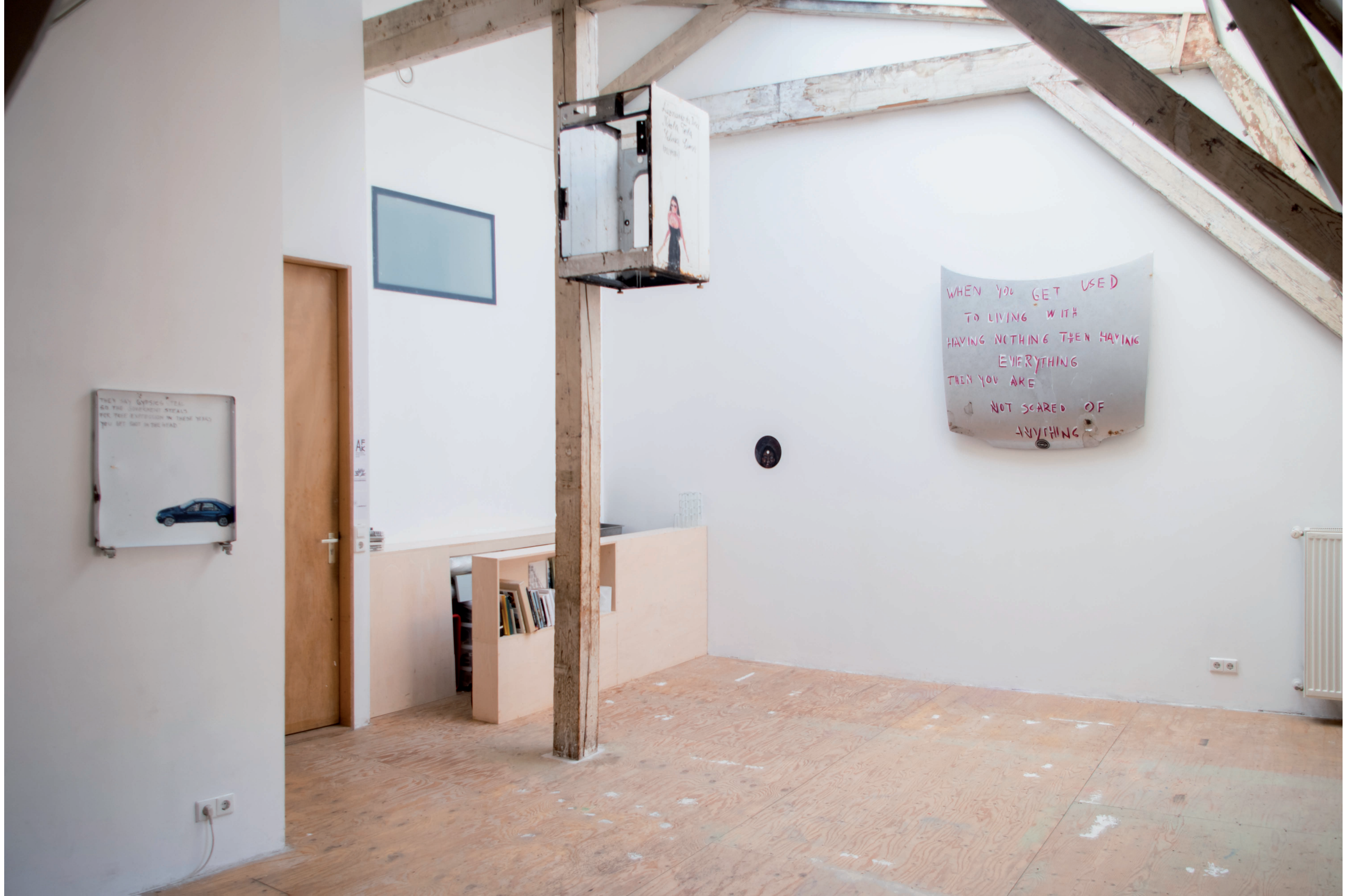
01. Selma Selman – I HAD TO LEAVE TO BE BACK HERE. Four works from the series Painting on metal . 2020/2021.