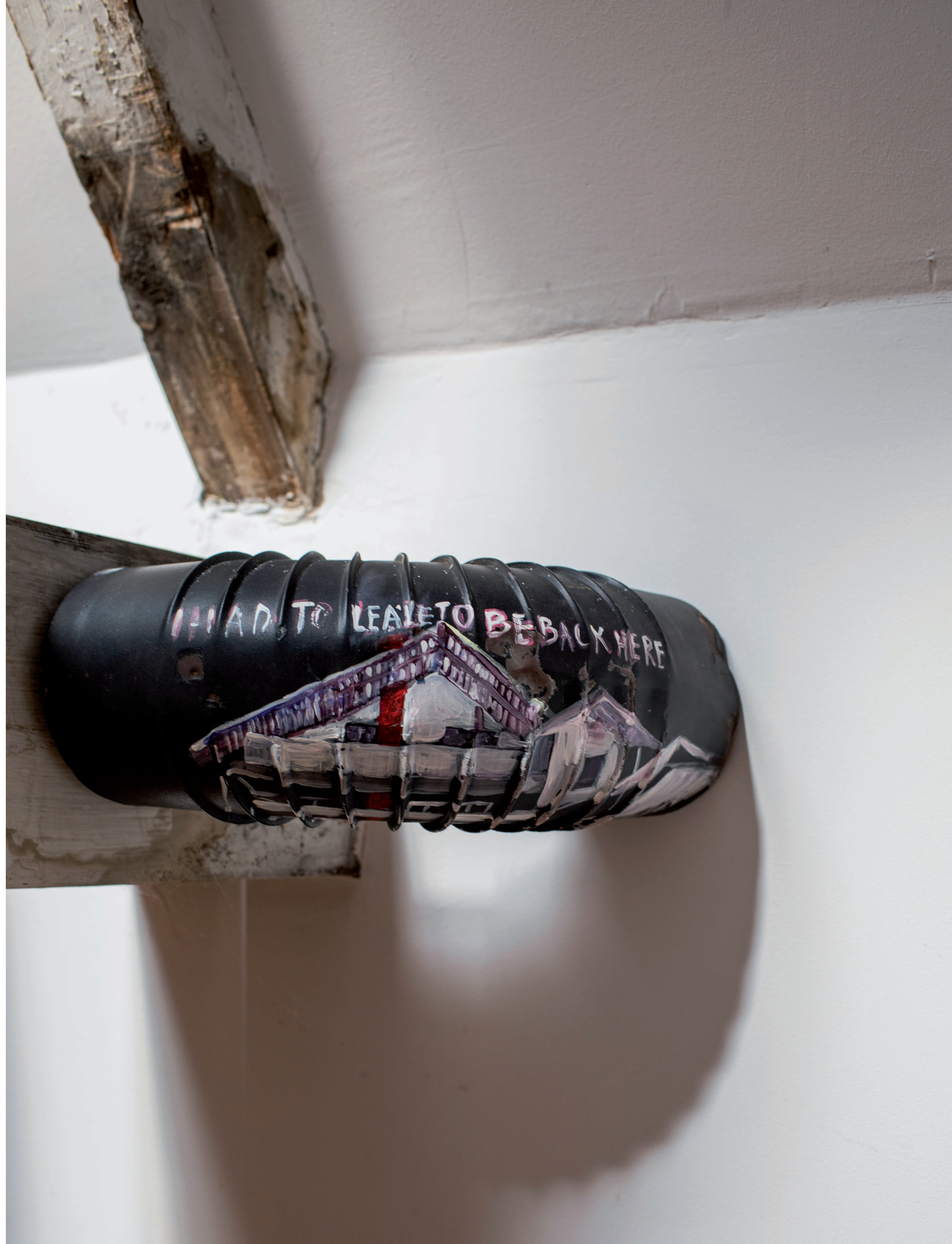
14. Selma Selman. Painting on metal . 2020/2021. Acrylic paint on scrap metal. 20 cm x 40 cm.