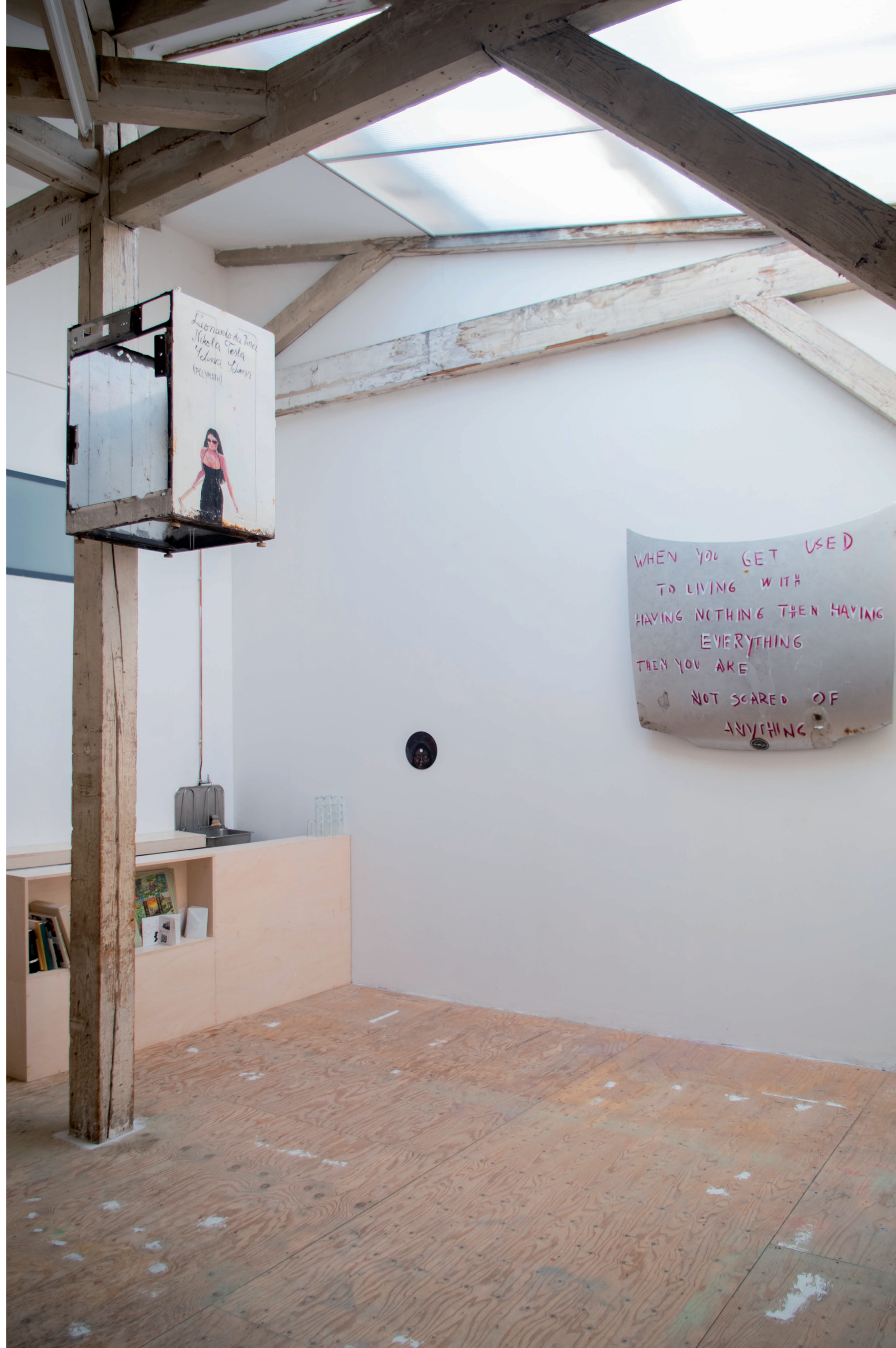
02. Selma Selman – I HAD TO LEAVE TO BE BACK HERE. Three works from the series Painting on metal . 2020/2021.