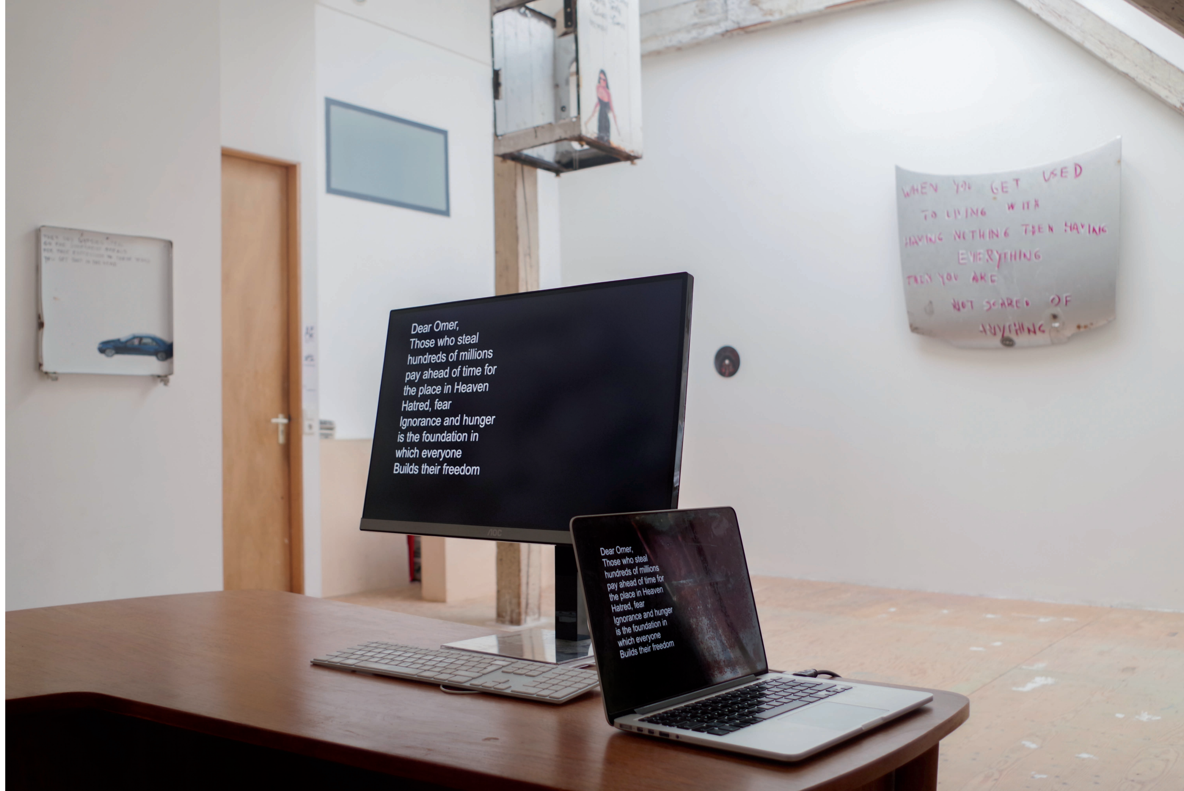
19. Selma Selman – I HAD TO LEAVE TO BE BACK HERE. Four works from the series Painting on metal and Letters to Omer . 2020/2021 and 2022.