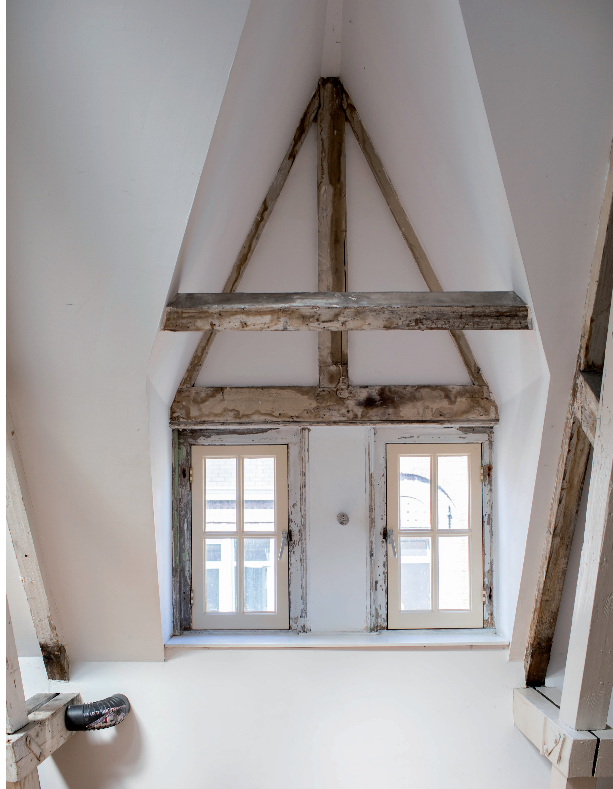
13. Selma Selman – I HAD TO LEAVE TO BE BACK HERE. Two works from the Painting on metal series. 2020/2021 and 2022.