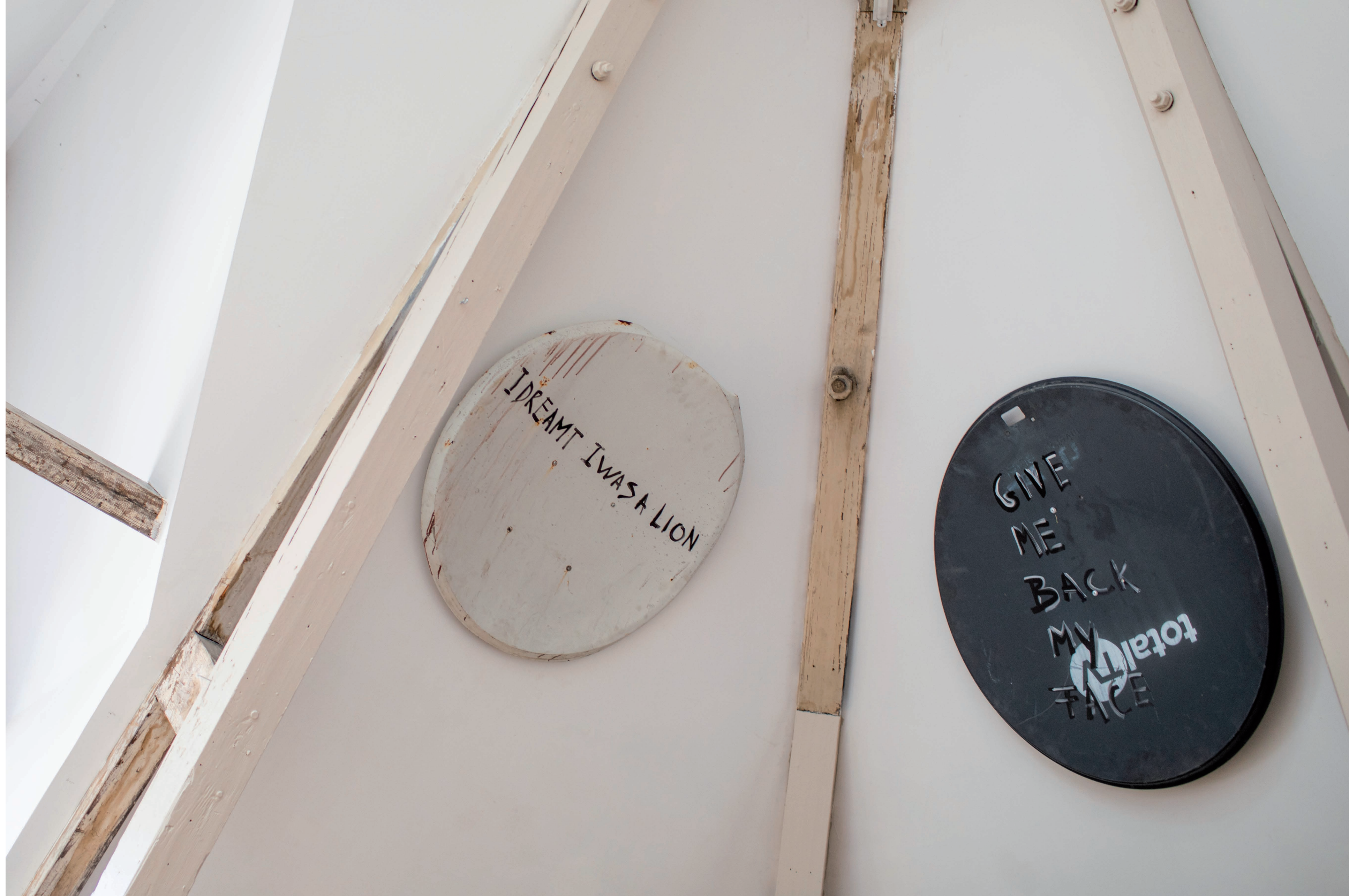
18. Selma Selman. Painting on metal . 2020/2021. Acrylic paint on scrap metal. 60 x 60 cm and 68 x 68 cm.