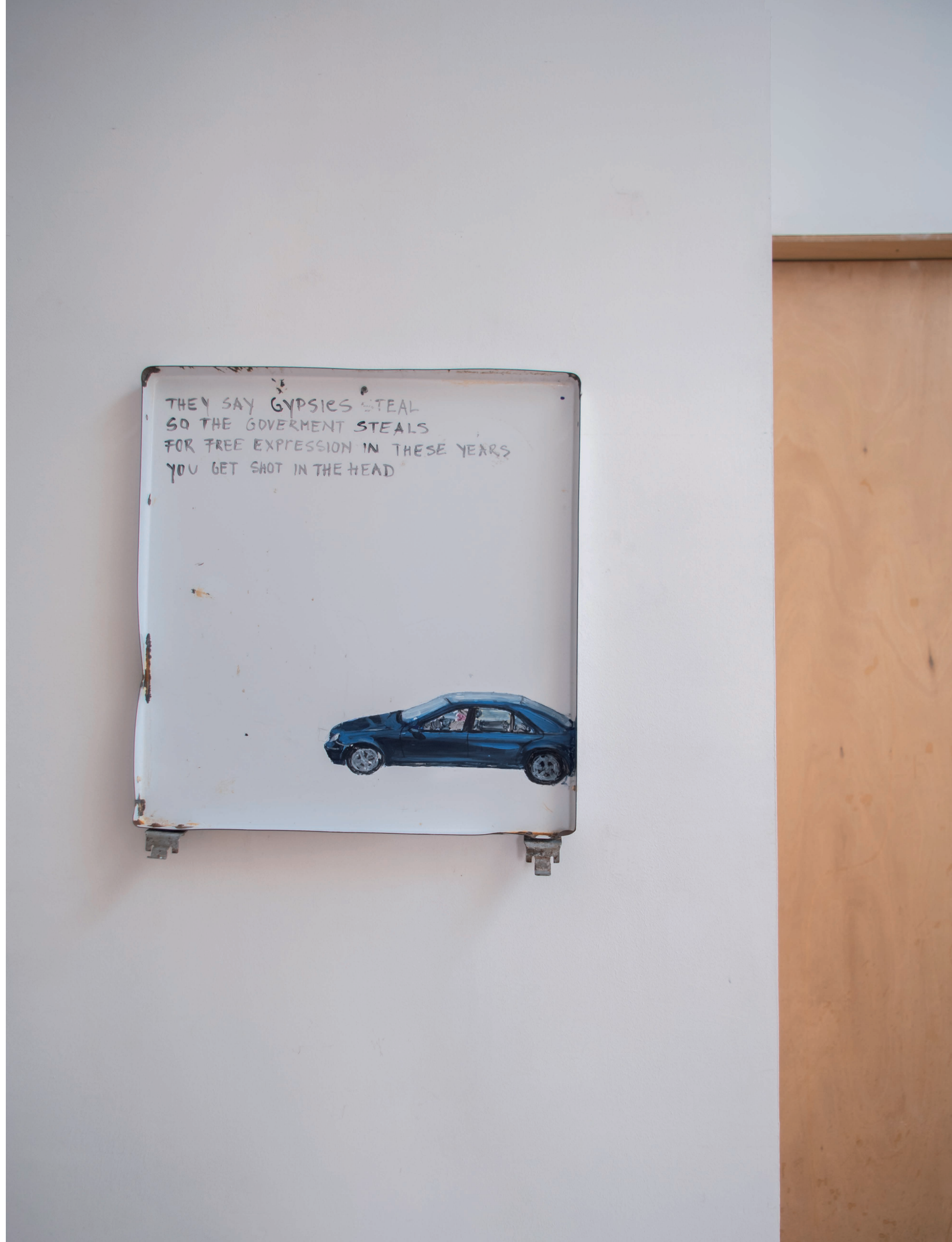
22. Selma Selman. Painting on metal . 2020/2021. Acrylic paint on scrap metal. 57.5 x 50 x 6 cm.