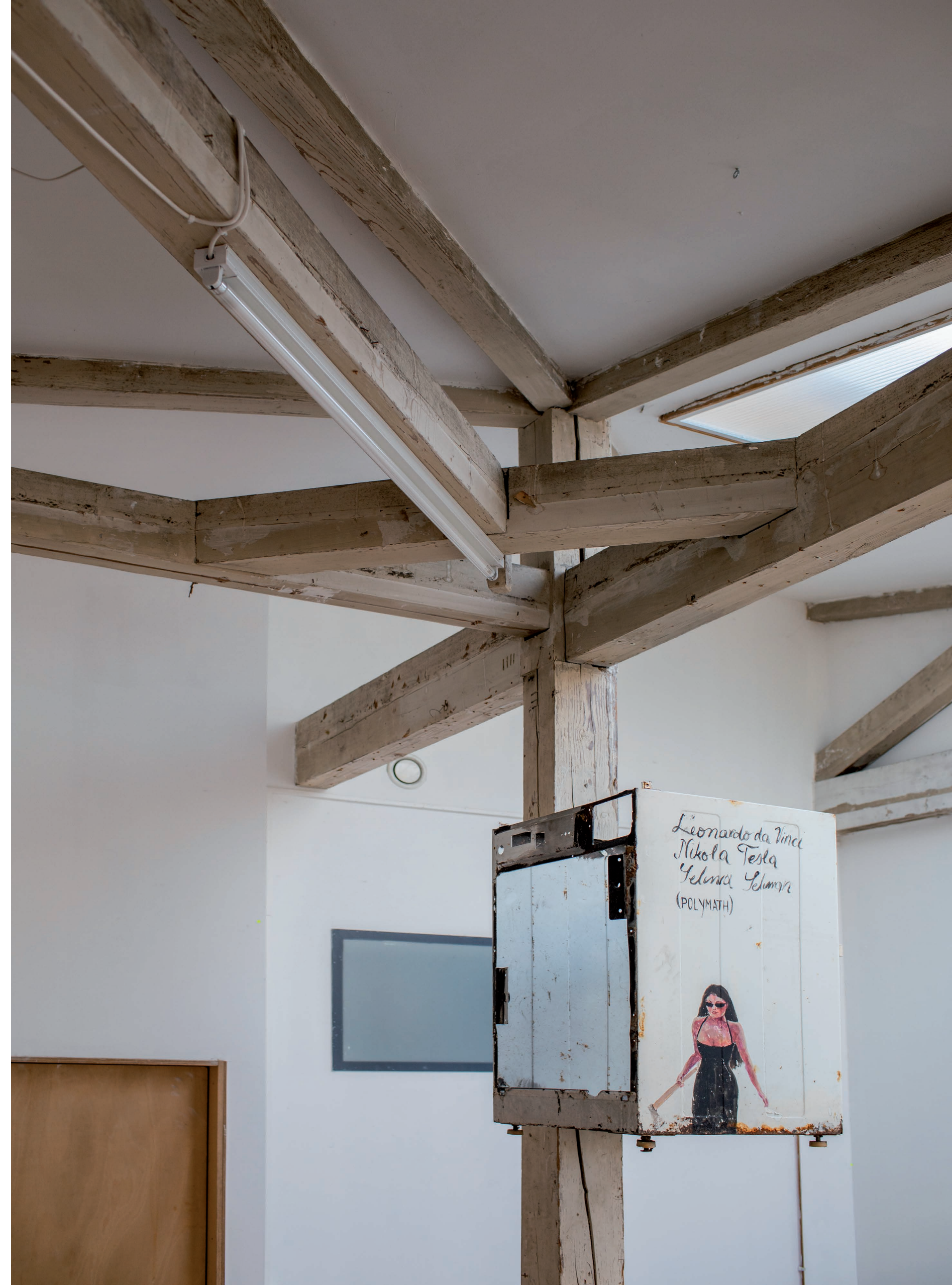
03. Selma Selman. Painting on metal . 2020/2021. Acrylic paint on scrap metal. 85 x 54 x 60 cm.