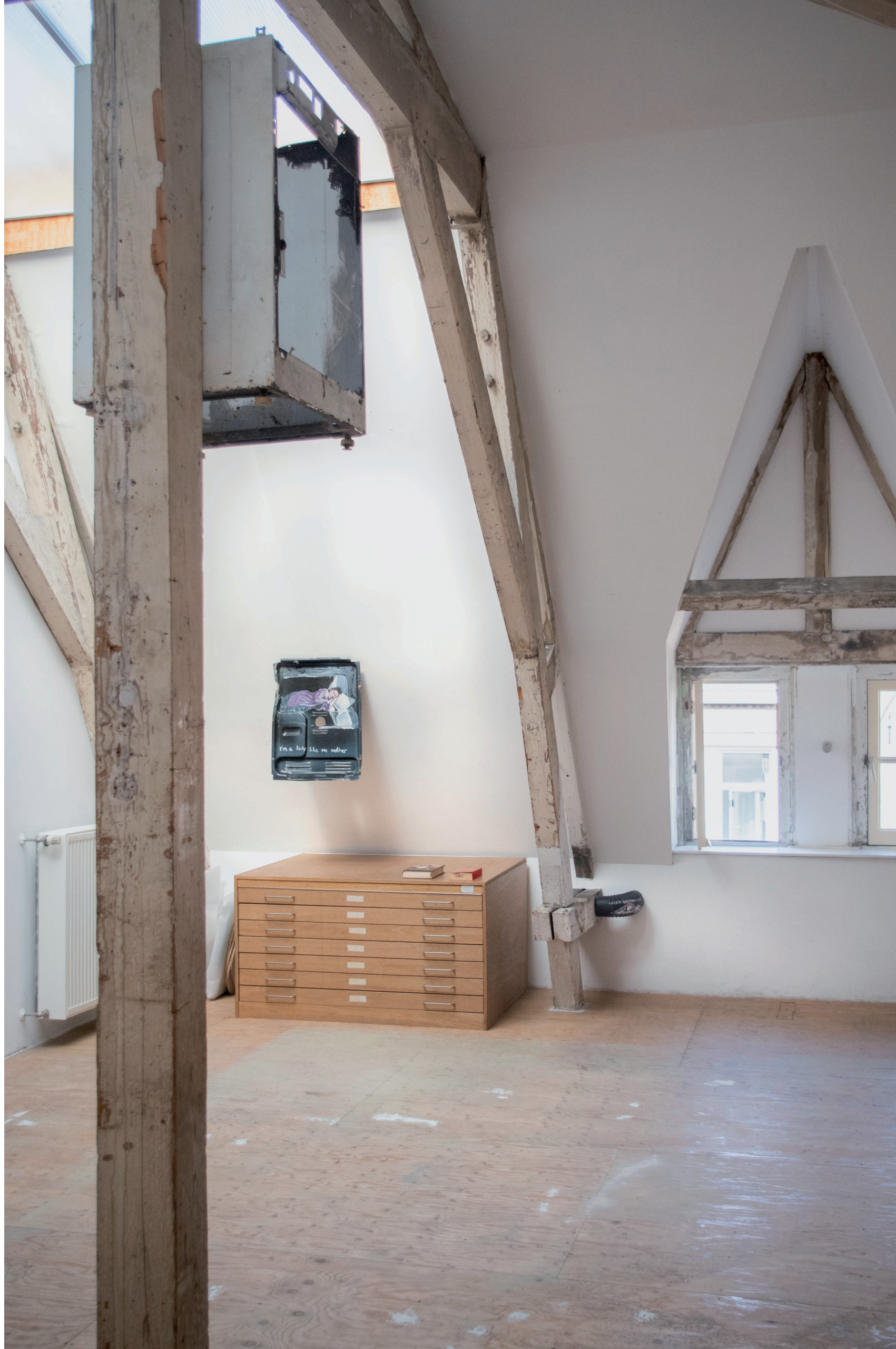
08. Selma Selman – I HAD TO LEAVE TO BE BACK HERE. Four works from the series Painting on metal and I HAD TO LEAVE TO BE BACK HERE book selection. 2020/2021.