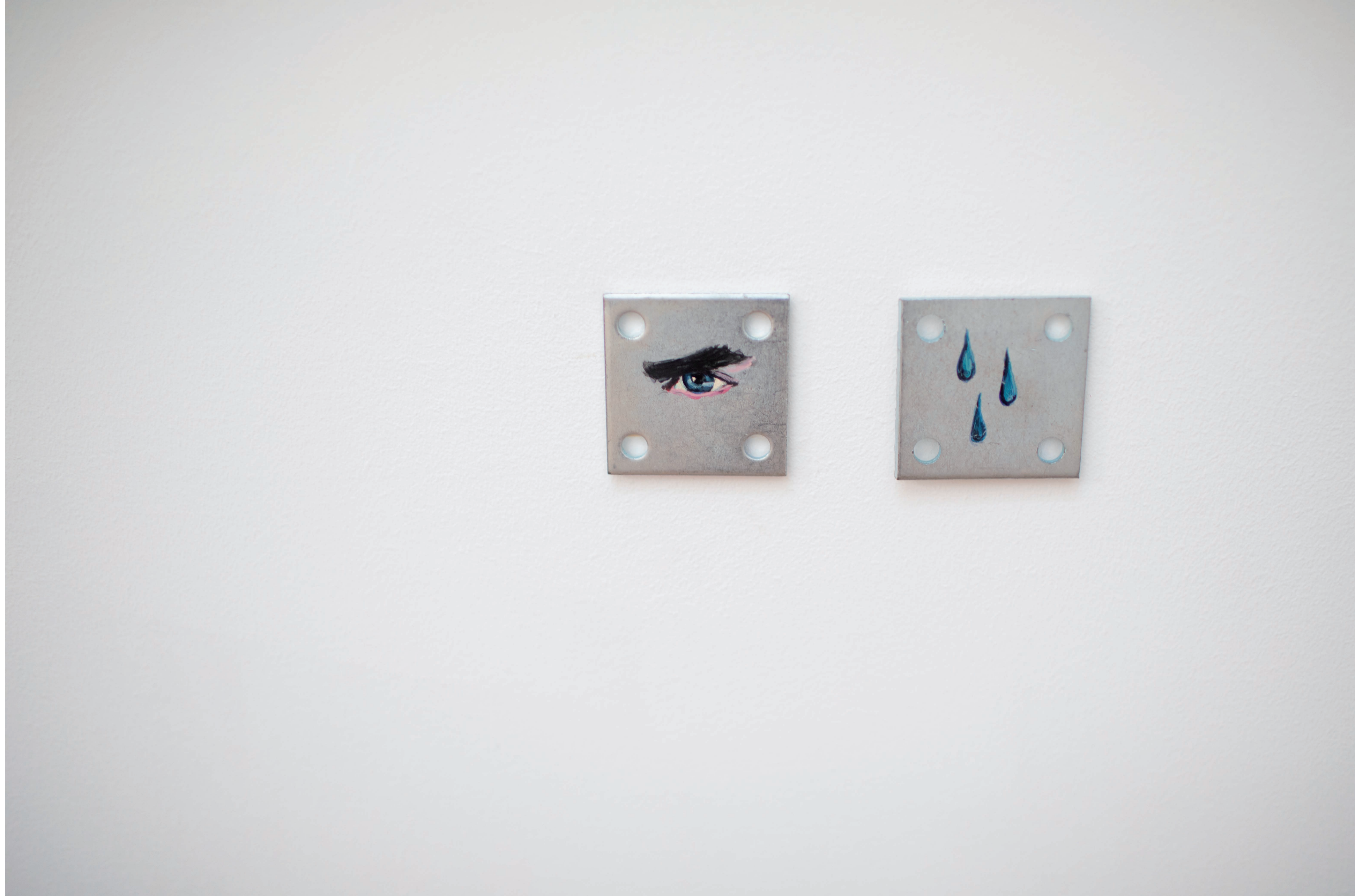
21. Selma Selman. Painting on metal . 2020/2021. Acrylic paint on scrap metal. (2 x) 6 x 6 cm.