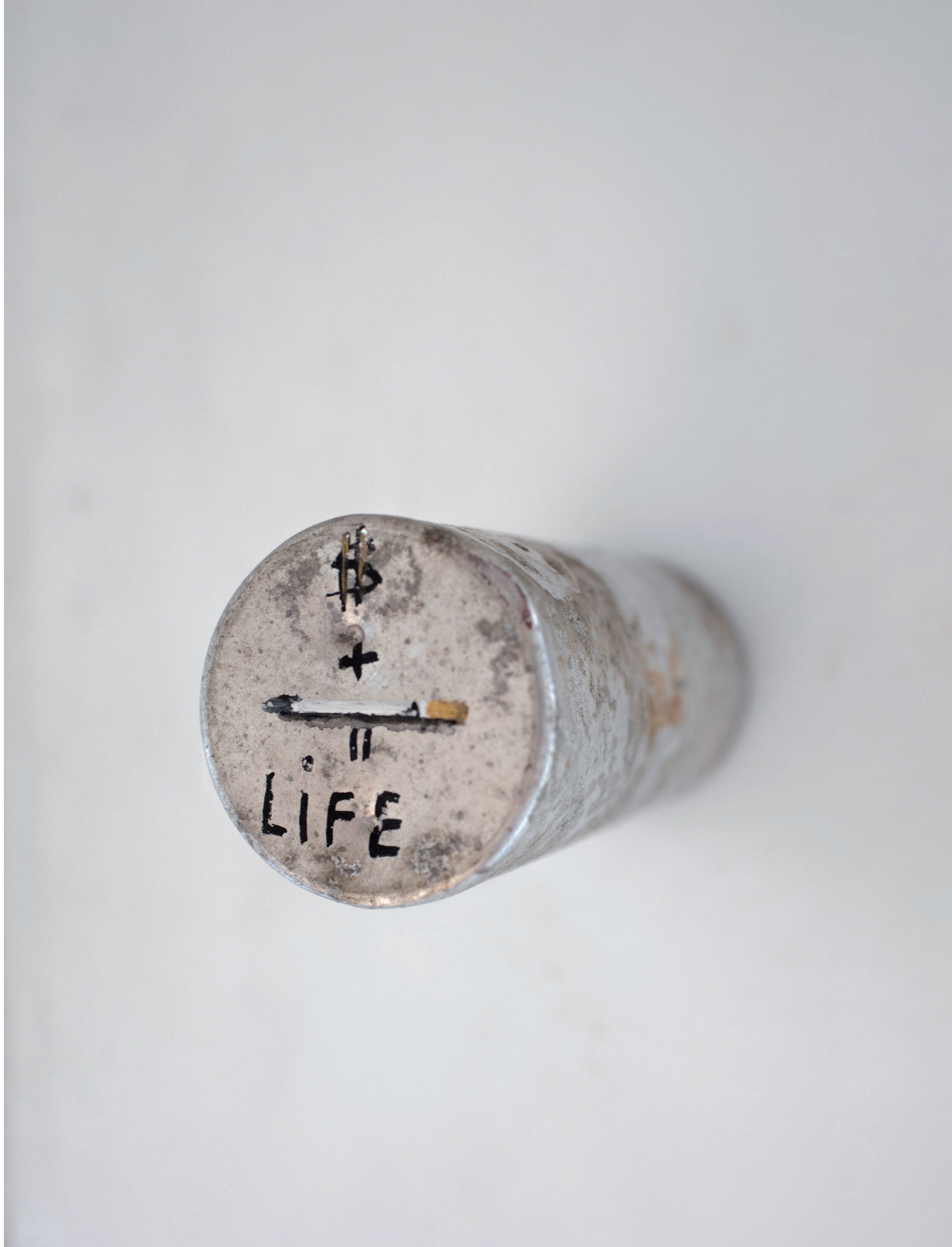
16. Selma Selman. Painting on metal . 2020/2021. Acrylic paint on scrap metal. 5 cm x 12 cm.