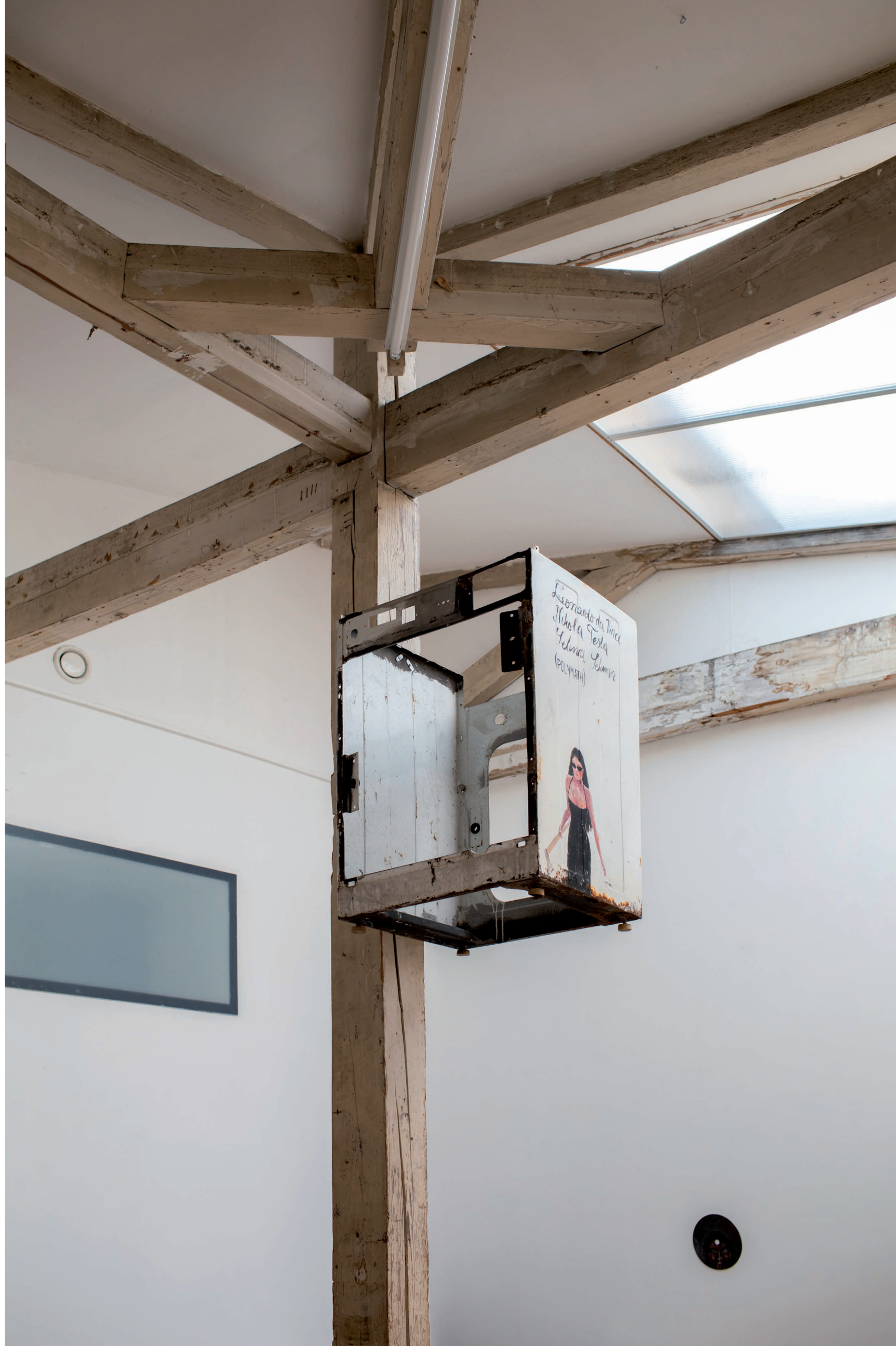
04. Selma Selman. Painting on metal . 2020/2021. Acrylic paint on scrap metal. 85 x 54 x 60 cm and 23 x 23 cm.