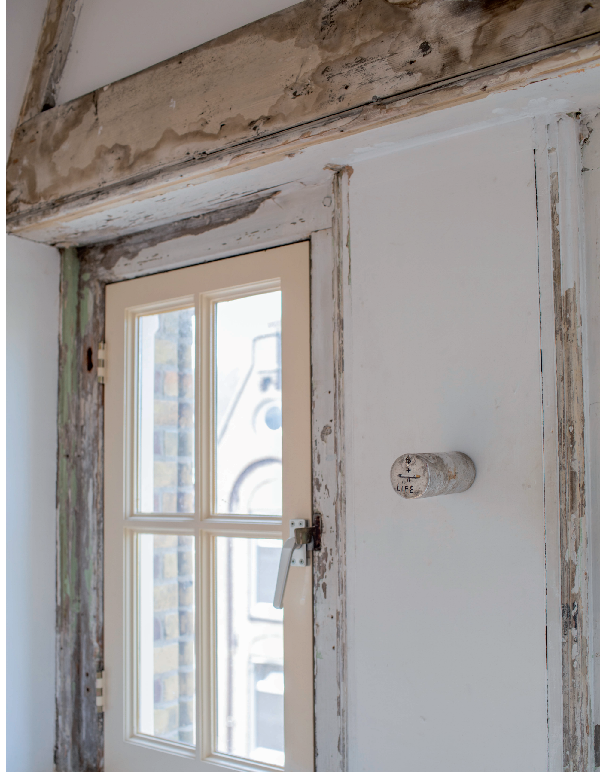
15. Selma Selman. Painting on metal . 2020/2021. Acrylic paint on scrap metal. 5 cm x 12 cm.