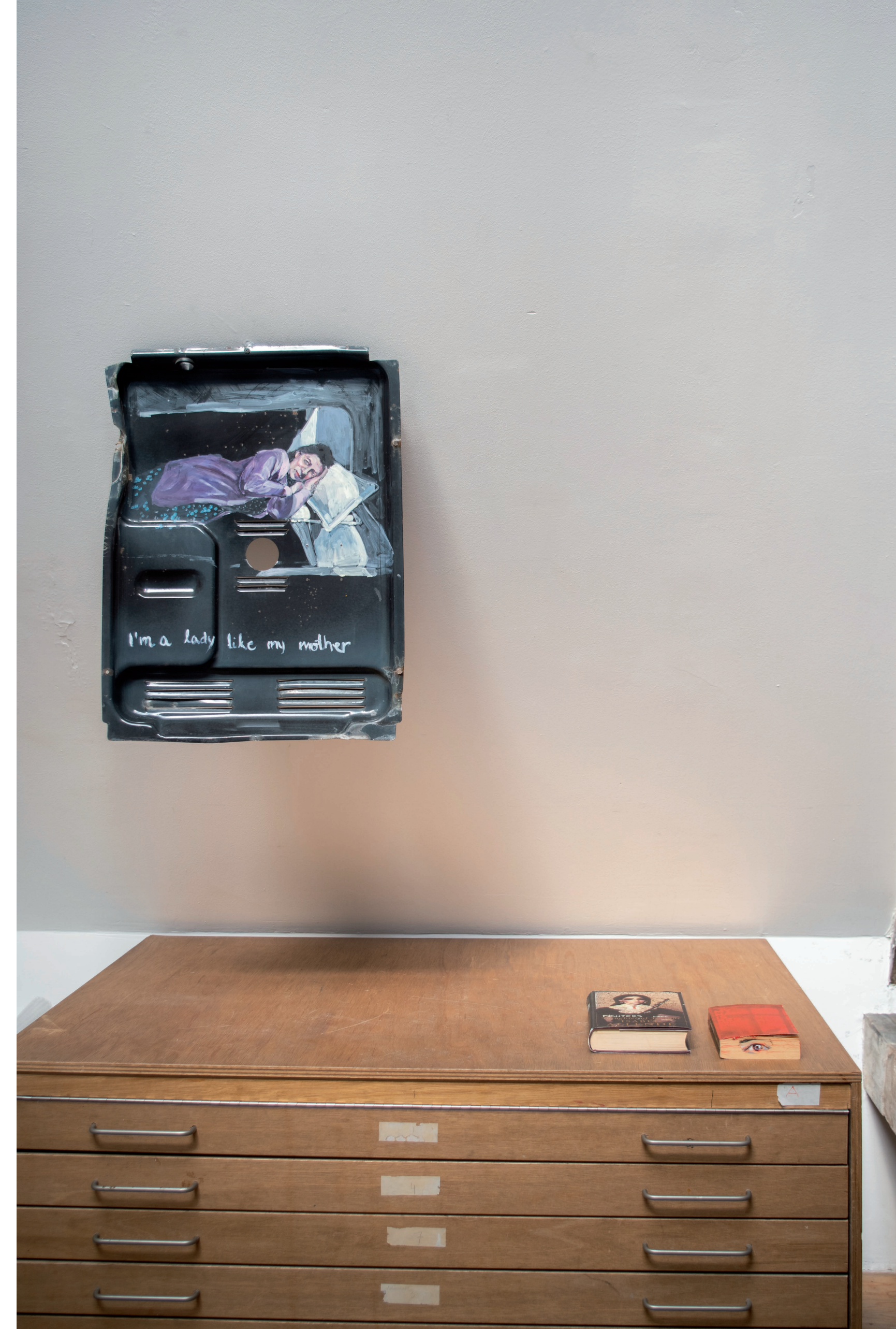
09. Selma Selman – I HAD TO LEAVE TO BE BACK HERE. Painting on metal and I HAD TO LEAVE TO BE BACK HERE book selection. 2020/2021.