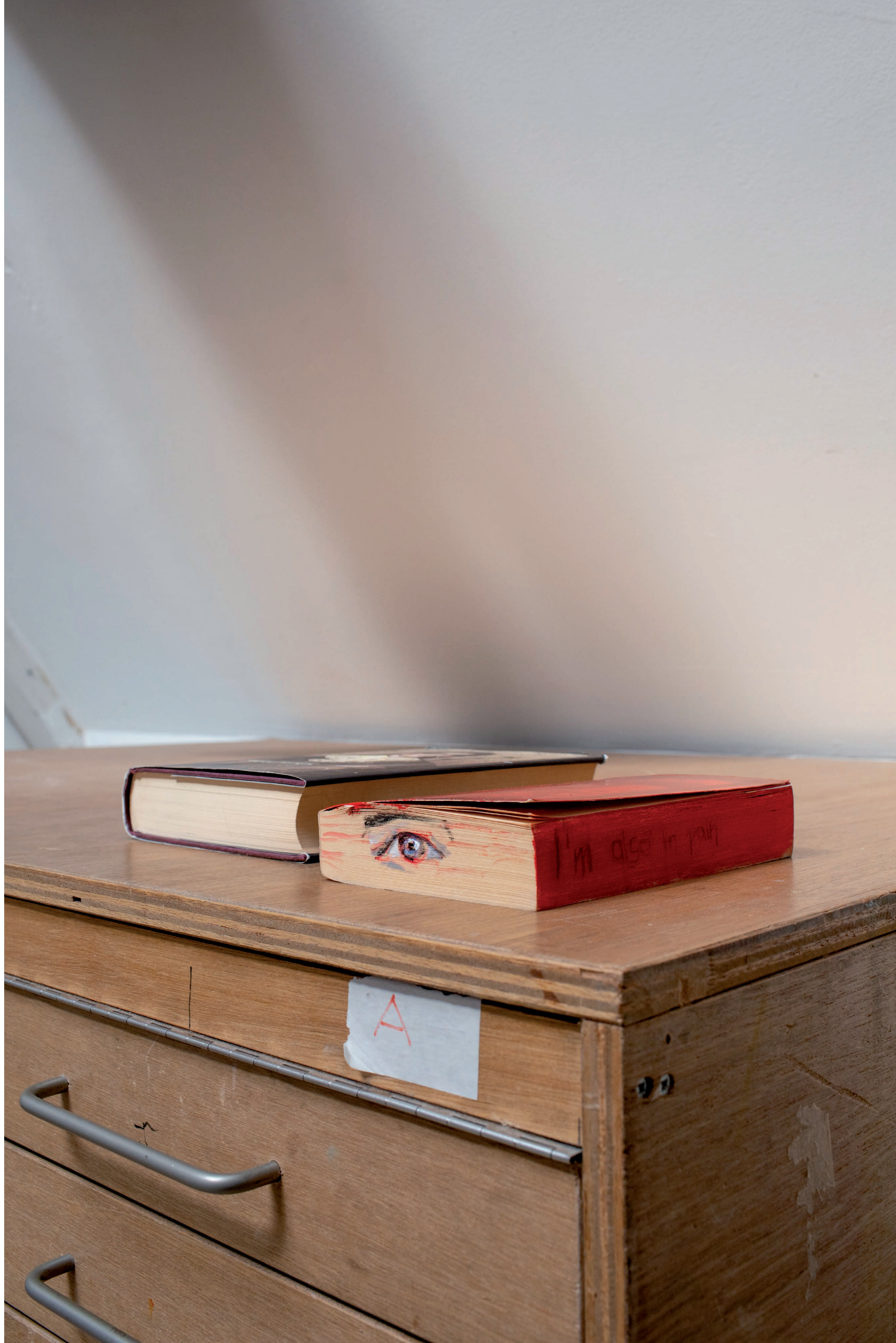
10. Selma Selman – I HAD TO LEAVE TO BE BACK HERE book selection. 2022.