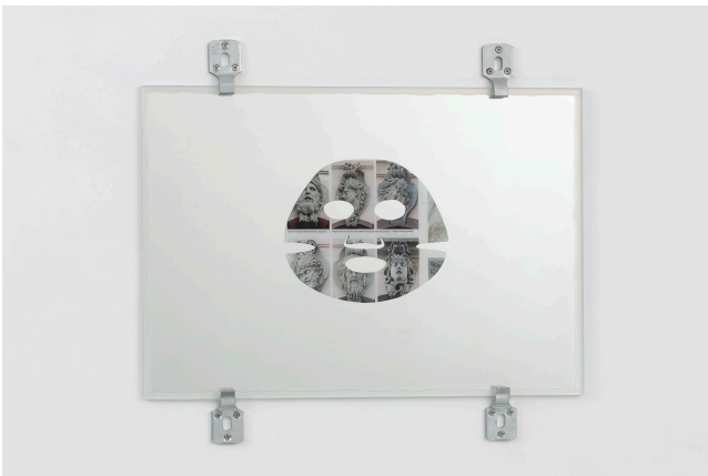
Max Paul Exfoliating Treatment (Berliner Extrablatt, Schlüter Masken #1) , 2022 Newsprint paper, glue, glass, mirror, silicone, gal- vanized steel 45 x 65 cm