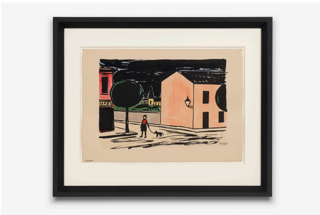
Werner Heldt Mappe » Berlin « , 1949 7 lithographies, unique colorised edition each 42,5 x 30,5 cm