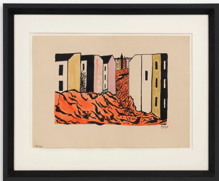
Werner Heldt Mappe » Berlin « , 1949 7 lithographies, unique colorised edition each 42,5 x 30,5 cm