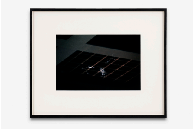
Max Paul Bird in Space #2 , 2022 chromogenic print mounted on museum board, framed 46 x 58 cm