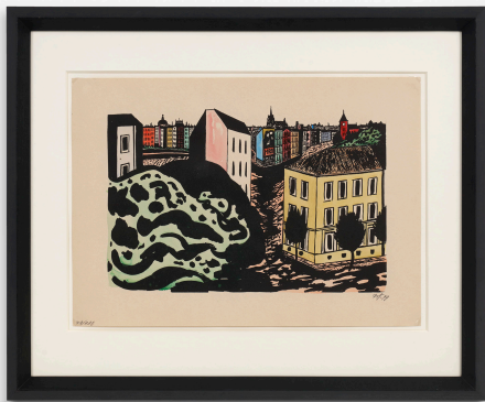
Werner Heldt Mappe » Berlin « , 1949 7 lithographies, unique colorised edition each 42,5 x 30,5 cm