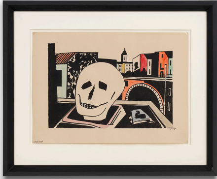
Werner Heldt Mappe » Berlin « , 1949 7 lithographies, unique colorised edition each 42,5 x 30,5 cm