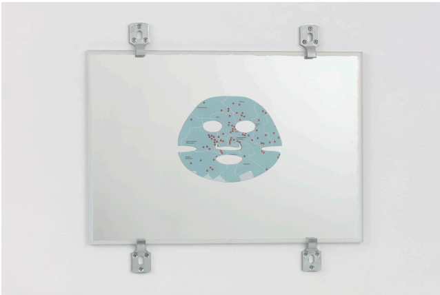
Max Paul Exfoliating Treatment (Neubau Kompass, Karte #1) , 2022 cartographic material (paper), glue, glass, mirror, silicone, galvanised steel 45 x 65 cm