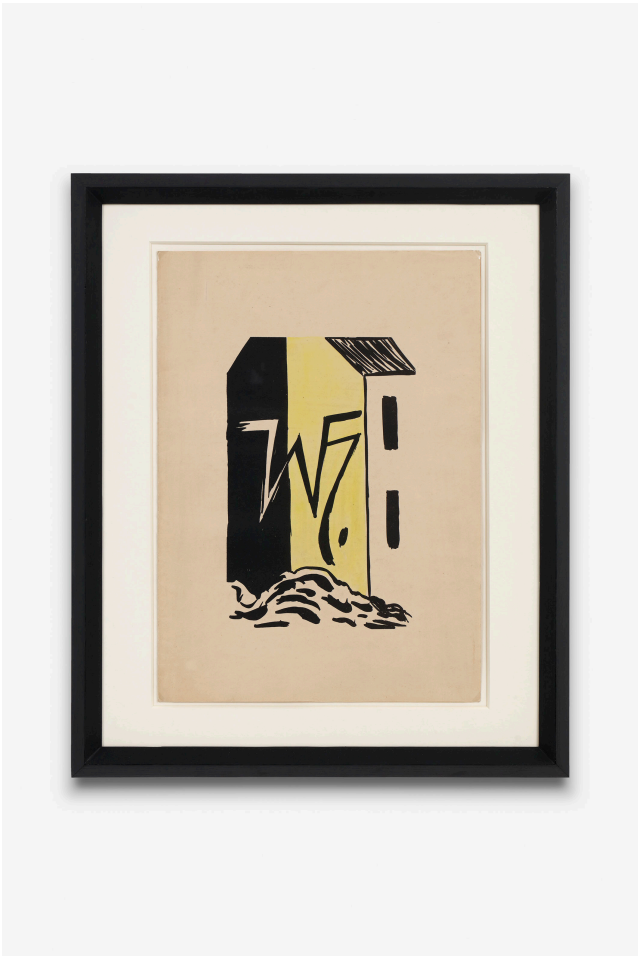
Werner Heldt Mappe » Berlin « , 1949 7 lithographies, unique colorised edition each 42,5 x 30,5 cm