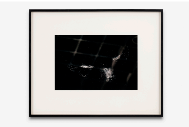
Max Paul Bird in Space #1 , 2022 chromogenic print mounted on museum board, framed 46 x 58 cm