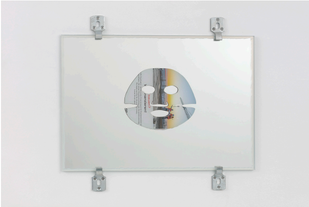
Max Paul Exfoliating Treatment (Let Berlin Take Care of You #1) , 2022 cartographic material (paper), glue, glass, mirror, silicone, galvanised steel 45 x 65 cm