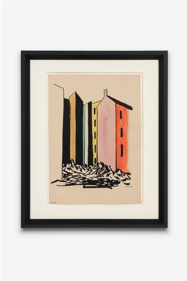
Werner Heldt Mappe » Berlin « , 1949 7 lithographies, unique colorised edition each 42,5 x 30,5 cm