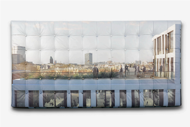
Max Paul Berlin Bed #1 , 2022 found printed advertisement tarp, upholstery material, wood, galvanised steel 192 x 96 x 42 cm

Werner Heldt, Max Paul, Resting Visions 02.09. – 08.10.2022